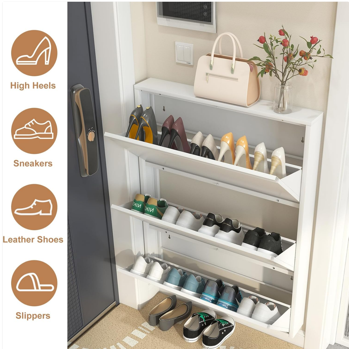
Image: Shoe cabinet with various shoes stored in its flip drawers.