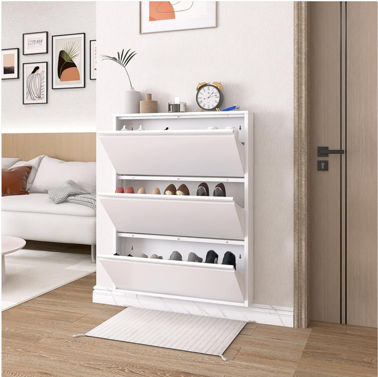
Image: LUCYPAL Shoe Cabinet with all three flip drawers open, illustrating internal storage.