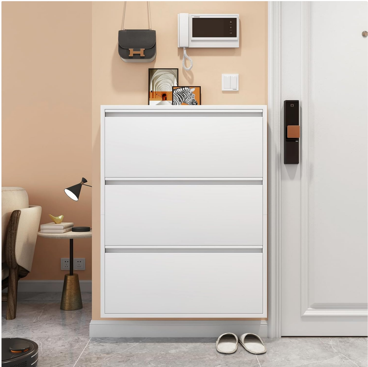
Image: Features of the cabinet: friction resistance, waterproof, and easy to clean surface.