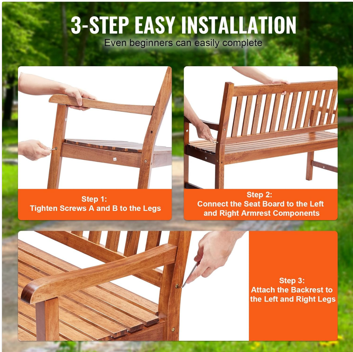
Image: Visual guide for the 3-step assembly process.

Note: Some users have found that using a personal hex wrench of better quality than the included one can make tightening screws easier and prevent stripping. Applying a small amount of screw lubricant can also aid in assembly.