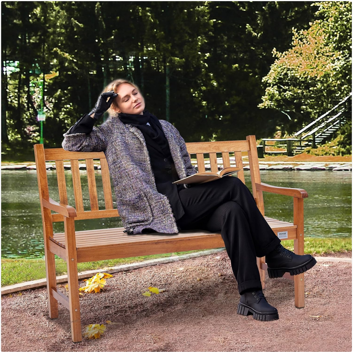
Image: Bench designed for comfortable relaxation.