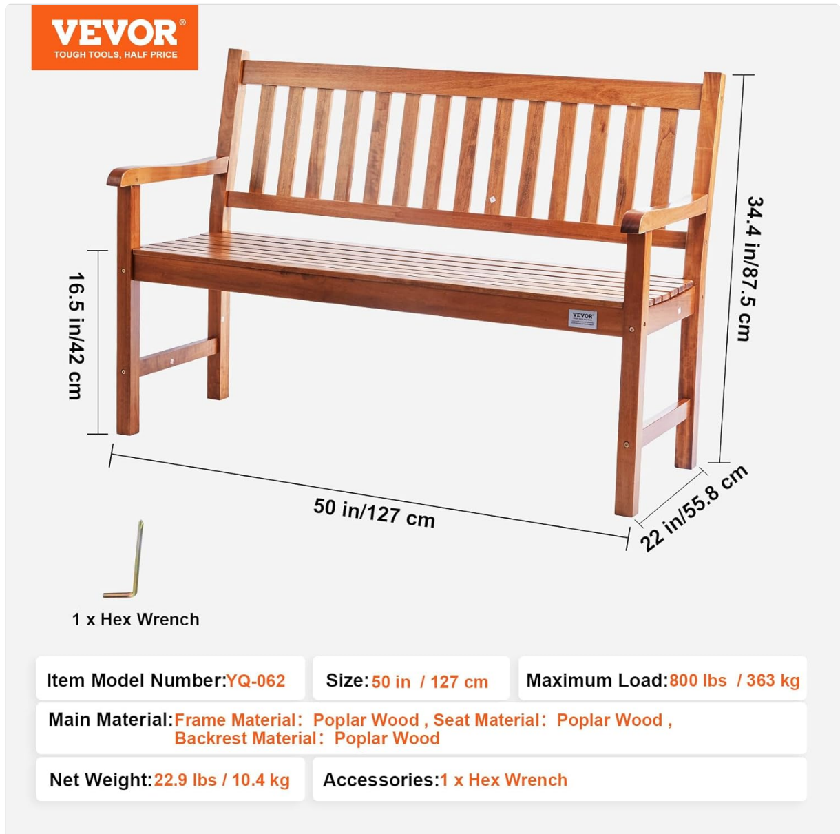
Image: Key dimensions and specifications of the bench.