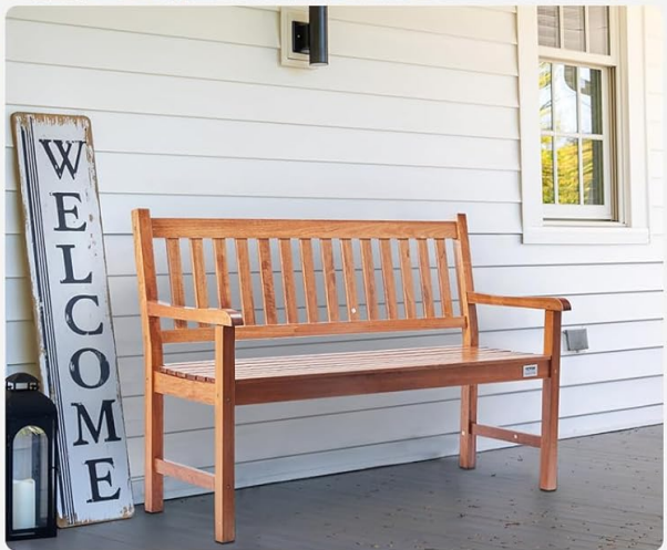
Image: Versatile style for multiple outdoor scenes.