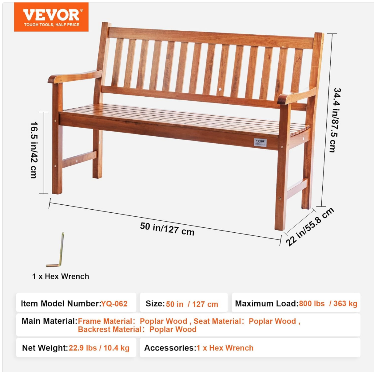
Image: All parts included in the package, ready for assembly.