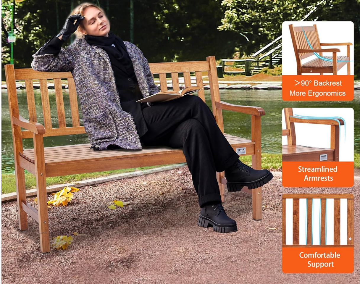
Image: Ergonomic design for superior comfort.

Experience complete physical and mental relaxation