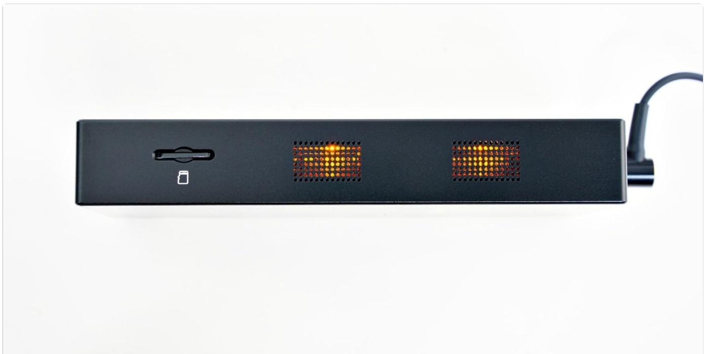
Image: Top view of the Cayin N3 Ultra, showing the Micro SD card slot for expandable storage and the power button.