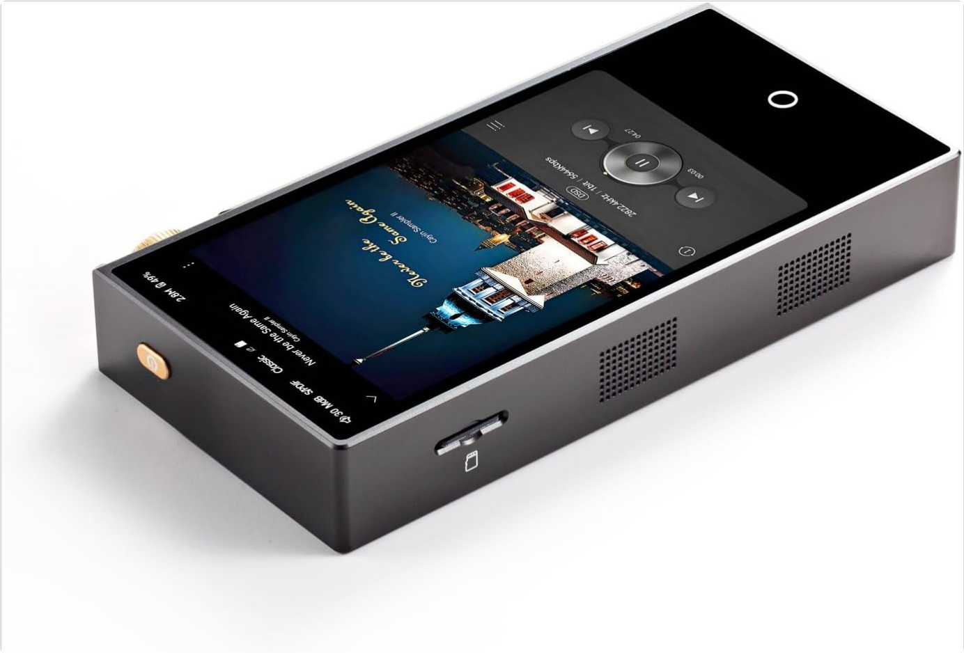
Image: The Cayin N3 Ultra's screen showing a music track playing, complete with album artwork and playback controls.

A key feature of the N3 Ultra is its vacuum tube integration, which can be activated to enhance the audio output with a warmer, more analog sound signature. Refer to the on-screen menu for options to enable or disable this feature and adjust related settings.