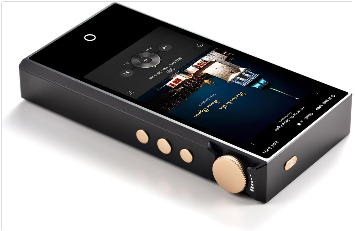
Image: A detailed view of the Cayin N3 Ultra, highlighting its touchscreen display, side control buttons, and the prominent gold-colored volume knob.