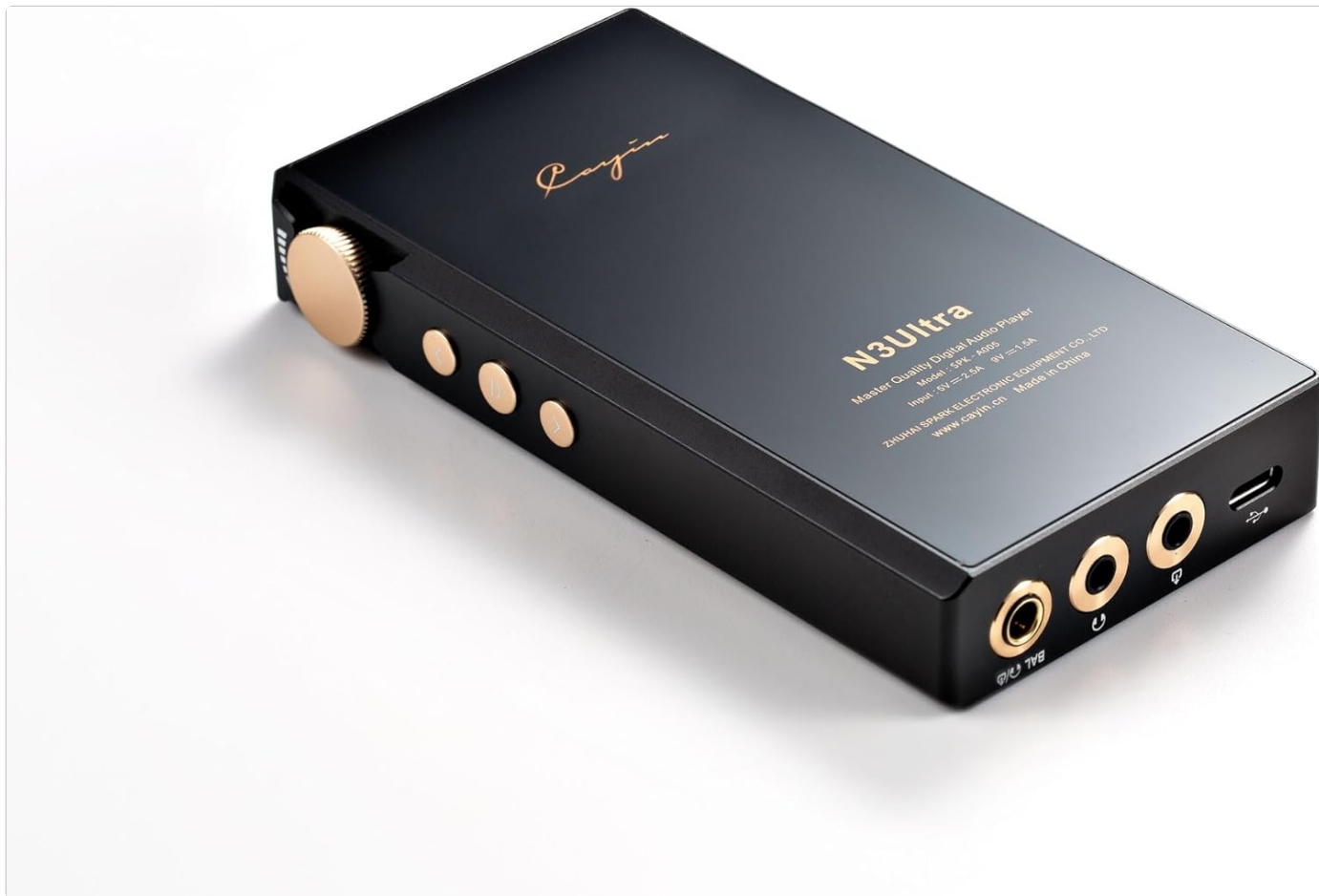
Image: Bottom view of the Cayin N3 Ultra, displaying the various audio output ports and the USB charging/data port.