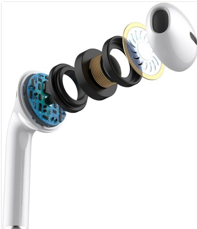
Image: An exploded view illustrating the internal components of a Riversong AirFly L2 earbud, including the driver, battery, and circuit board.

Familiarize yourself with the components of your AirFly L2 earbuds: