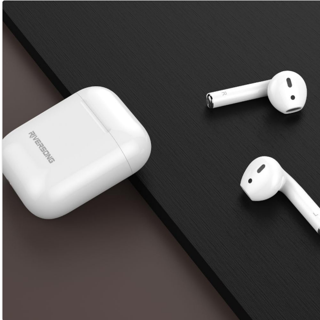
Image: The Riversong AirFly L2 earbuds and their charging case, typically found in the product package.