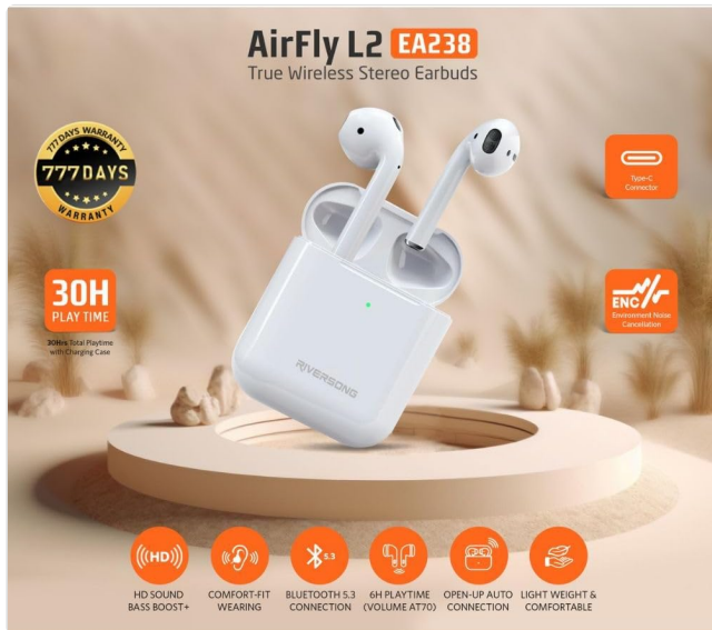
Image: Riversong AirFly L2 earbuds showcasing key features like 30H playtime, Type-C connector, Bluetooth 5.3 (note: specifications state 5.2), ENC, HD sound, and comfort-fit design.