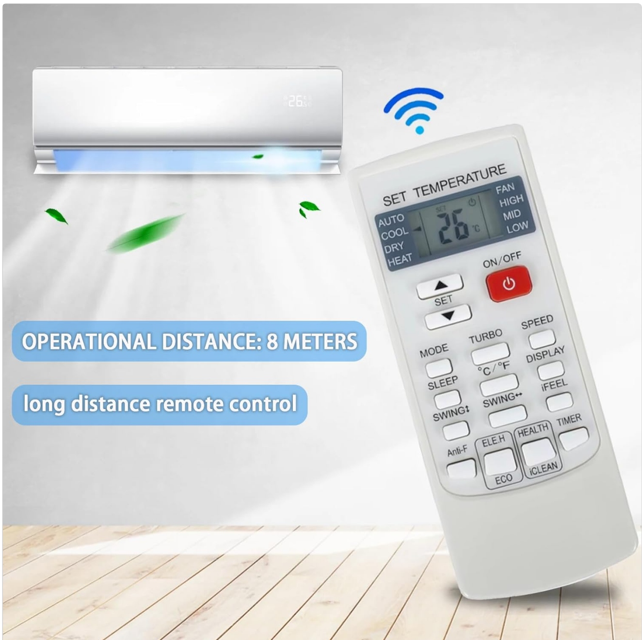
Image: The remote control is shown with an air conditioner unit in the background, illustrating its operational distance of 8 meters and strong signal capability.