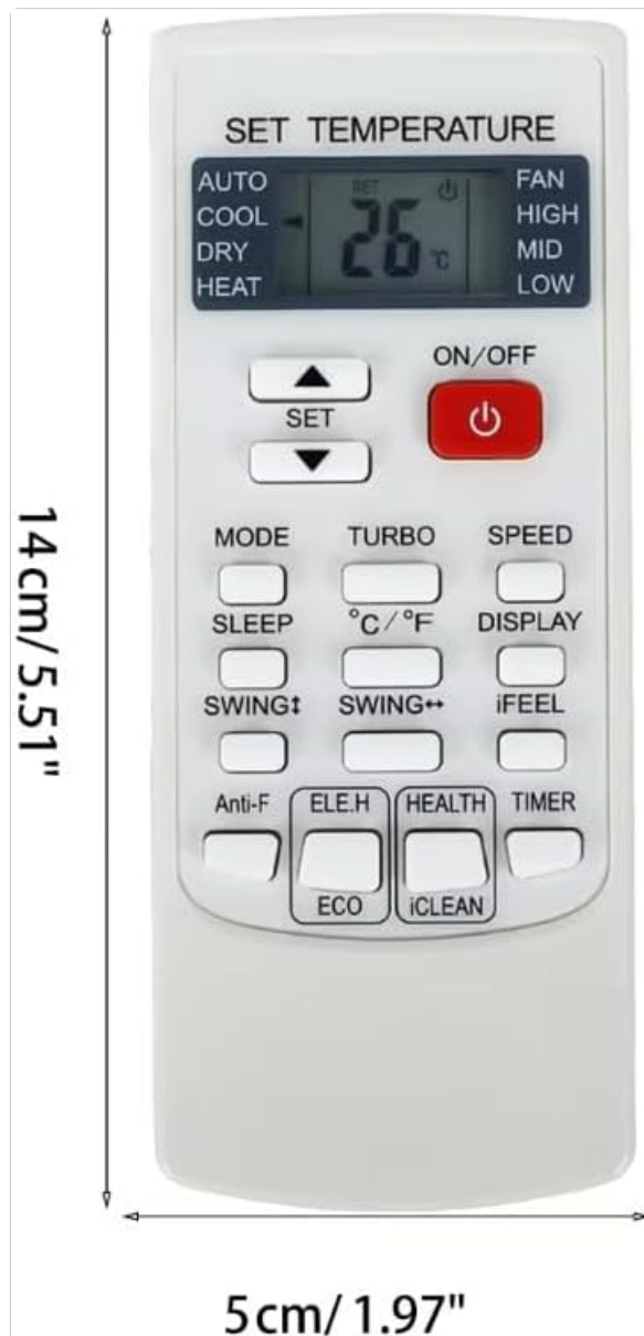
Image: The remote control with overlaid measurements indicating a length of 14 cm (5.51 inches) and a width of 5 cm (1.97 inches).