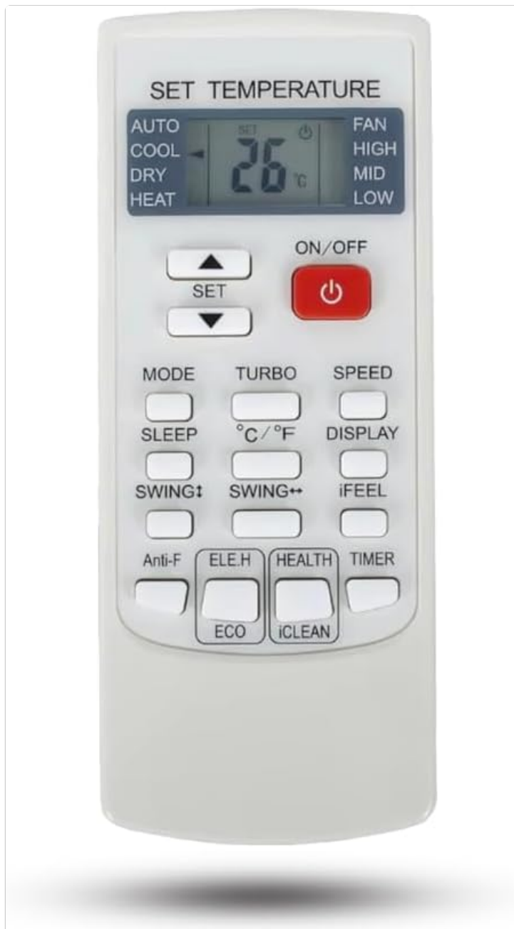
Image: Front view of the AZBME YKR-H/102E replacement remote control, showing all buttons and the LCD screen displaying "SET TEMPERATURE" and "26°C".

Important Note: This remote control only displays temperature in Celsius.