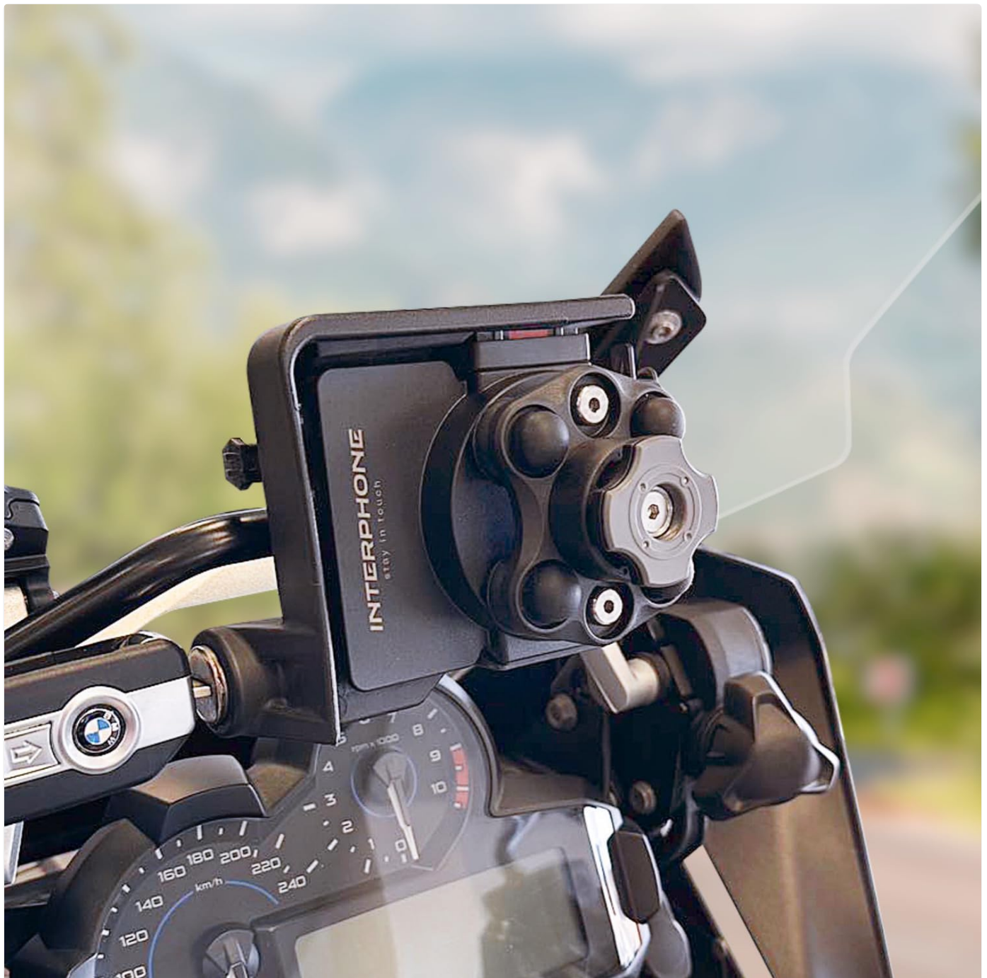
Image: The Interphone QUIKLOX Support securely installed on a BMW motorcycle's pre-existing navigator mount.