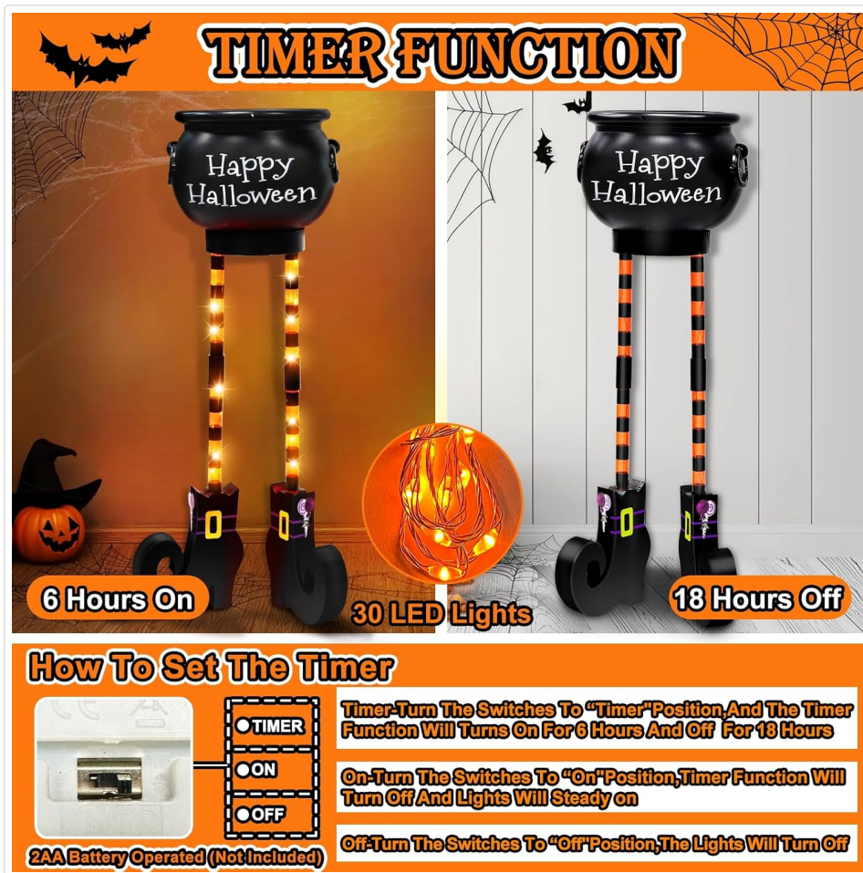
Image: Battery box switch settings for ON, OFF, and TIMER functions.