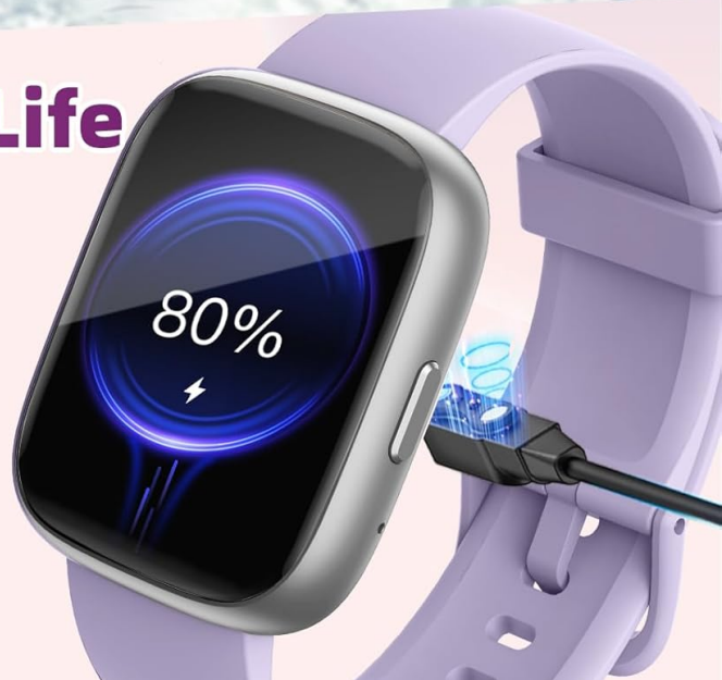
Image: The MILOUZ Smart Watch connected to its magnetic charging cable, displaying battery status.

The watch has a working time of up to 7 days and a standby time of 30 days on a single charge.