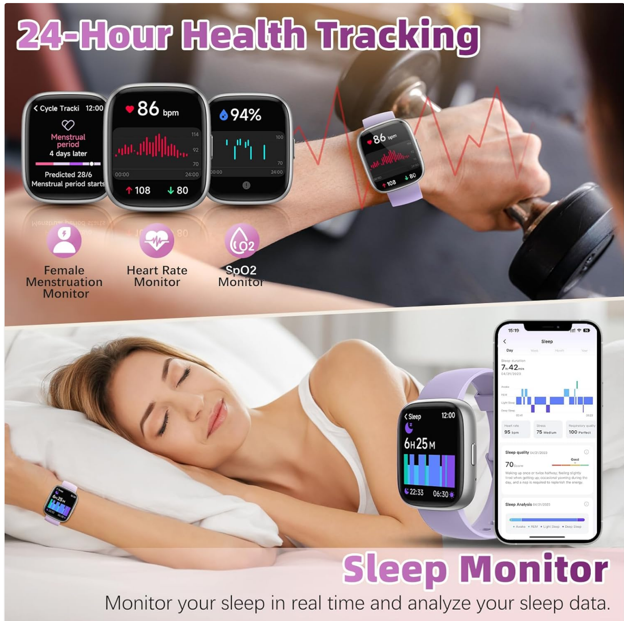
Image: The MILOUZ Smart Watch showing health metrics like heart rate, SpO2, and menstrual cycle tracking, alongside sleep monitoring data.

The MILOUZ Smart Watch provides 24-hour health monitoring capabilities.