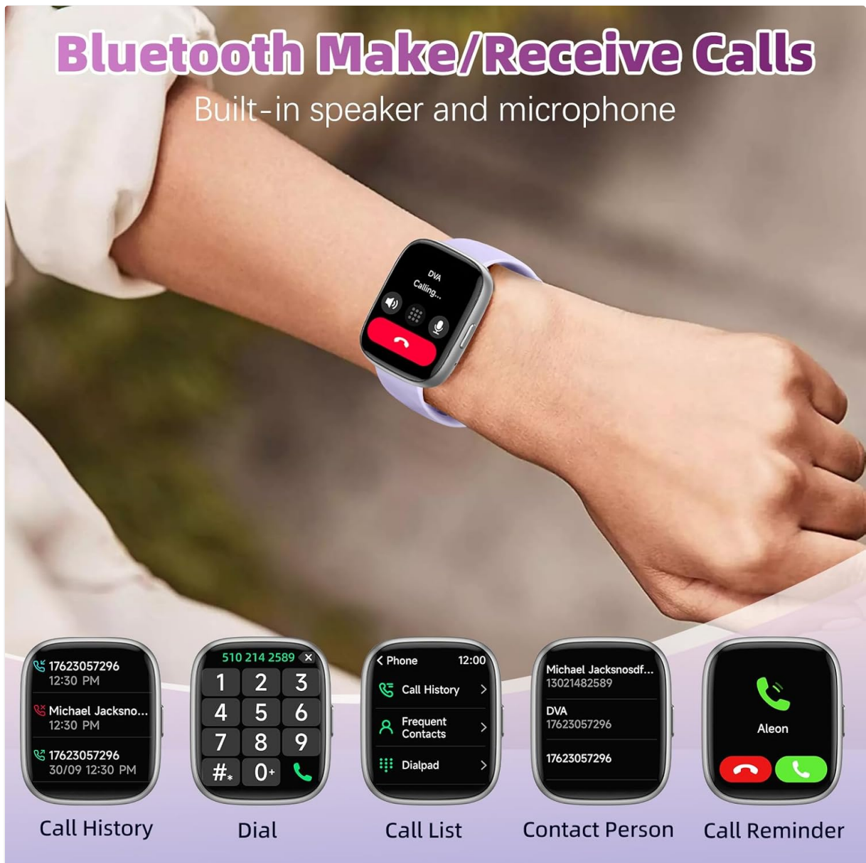
Image: The MILOUZ Smart Watch showing an incoming call and various call management options.