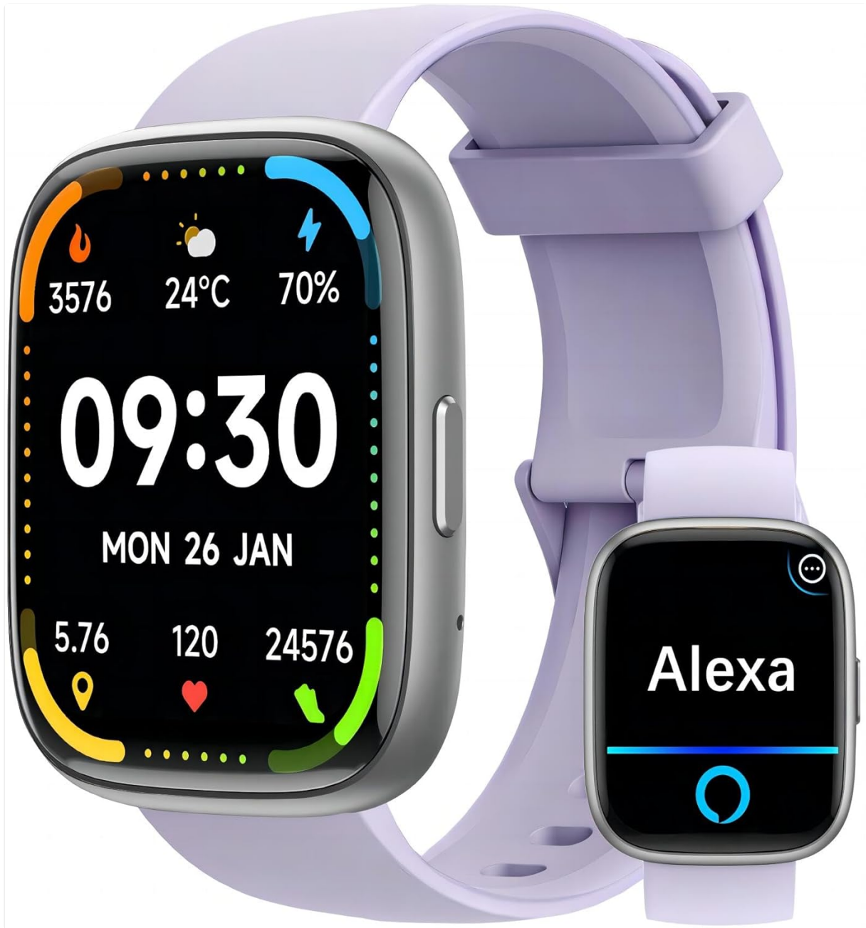
Image: The MILOUZ Smart Watch main display and an Alexa interface screen.

The MILOUZ Smart Watch features a 1.83-inch HD touch screen for intuitive navigation. Swipe left, right, up, or down to access different menus and functions. Tap to select an option, and typically swipe right or press the side button to return to the previous screen or watch face.