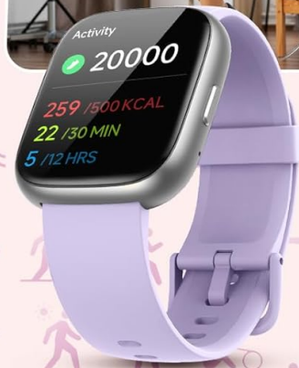
Image: Various sports activities being performed, illustrating the 100 sports modes feature of the MILOUZ Smart Watch.

Tracking Record all workout data, distance, time, calories. etc. Enjoy your healthy life