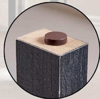
Table Foot Pads

Close-up of the open shelf and groove barn door design.