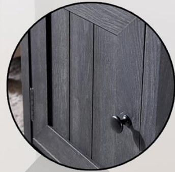
Groove Barn Door