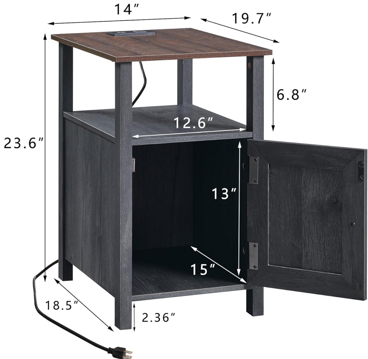
Detailed product dimensions to assist with assembly and placement.