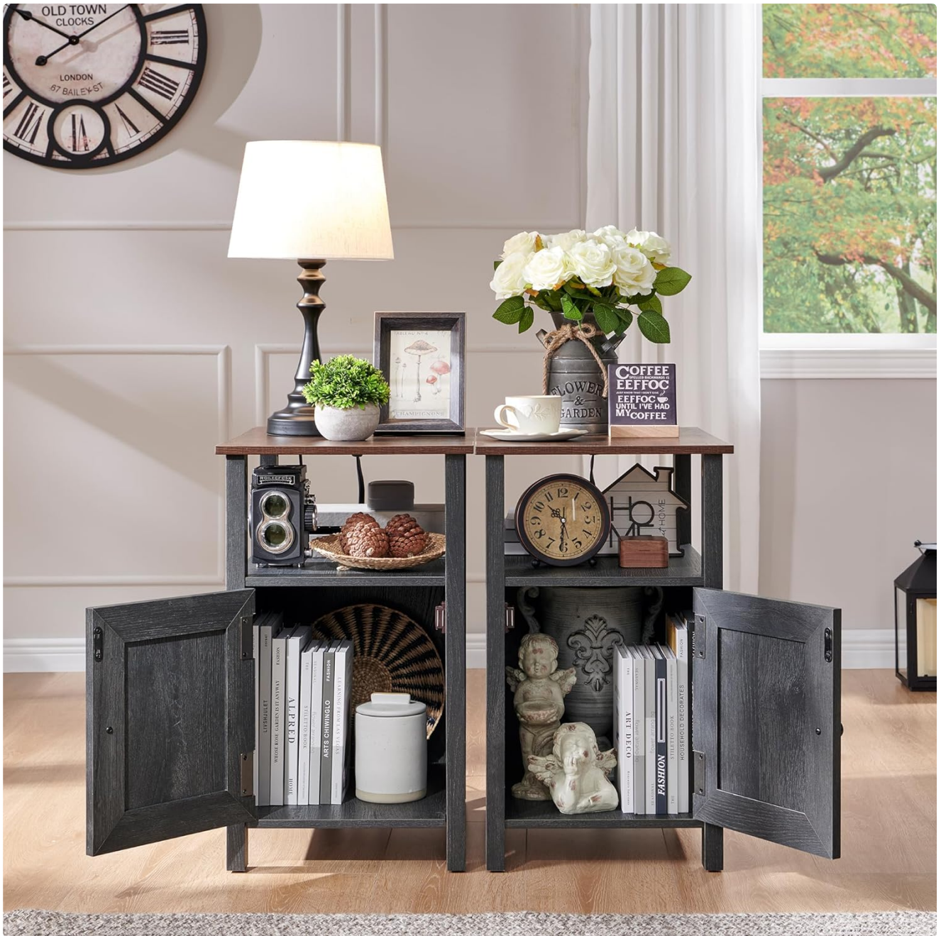
View demonstrating the ample storage capacity within the nightstand's open shelf and closed cabinet.