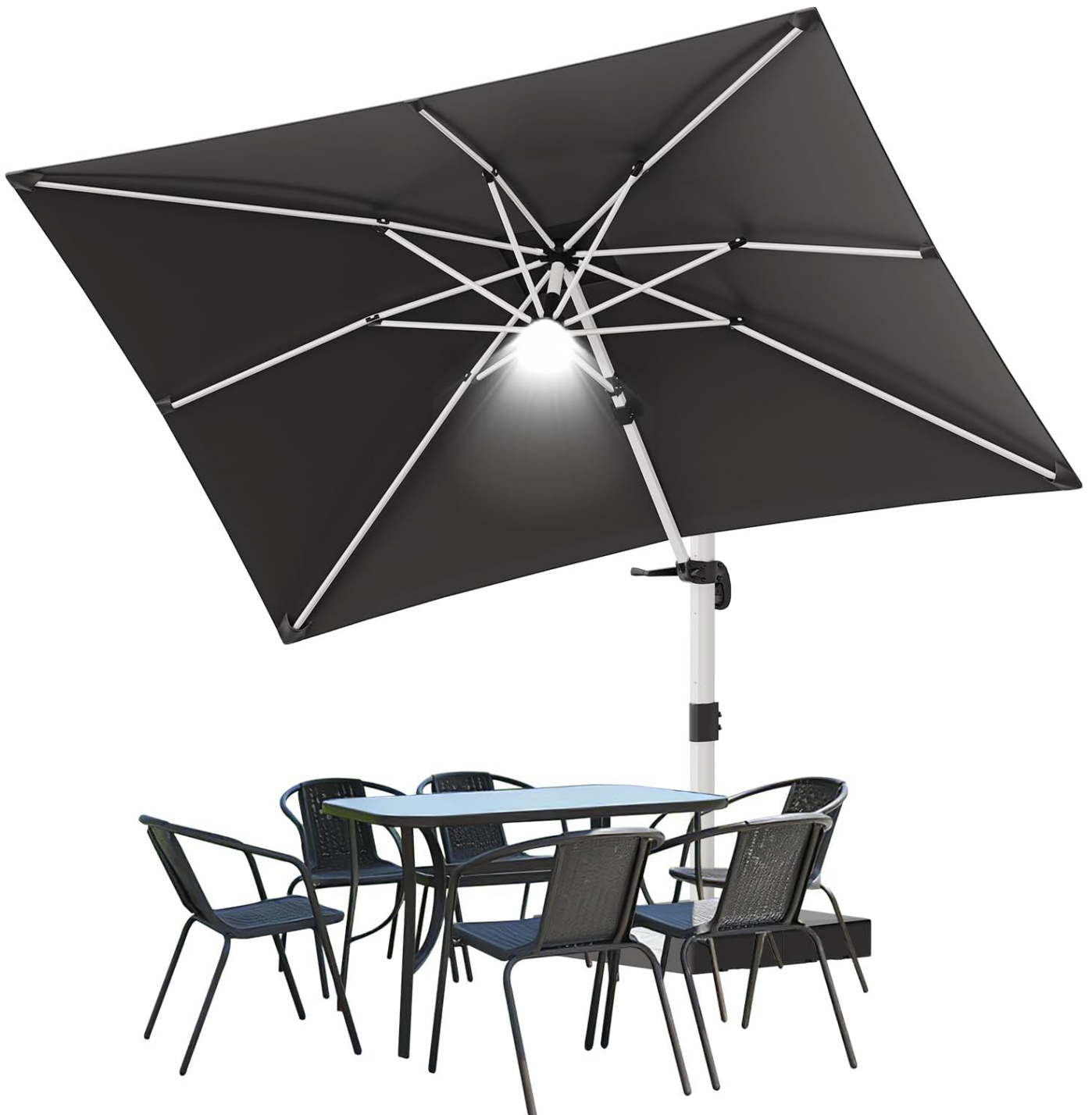
Image 1.1: The Devoko Cantilever Umbrella providing shade over a patio table and chairs.