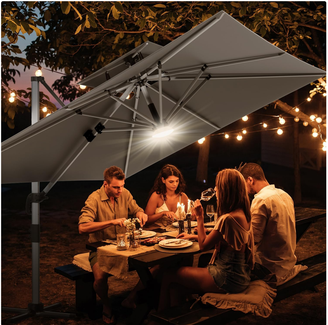
Image 5.2: The integrated LED lighting creates a comfortable ambiance for evening use.