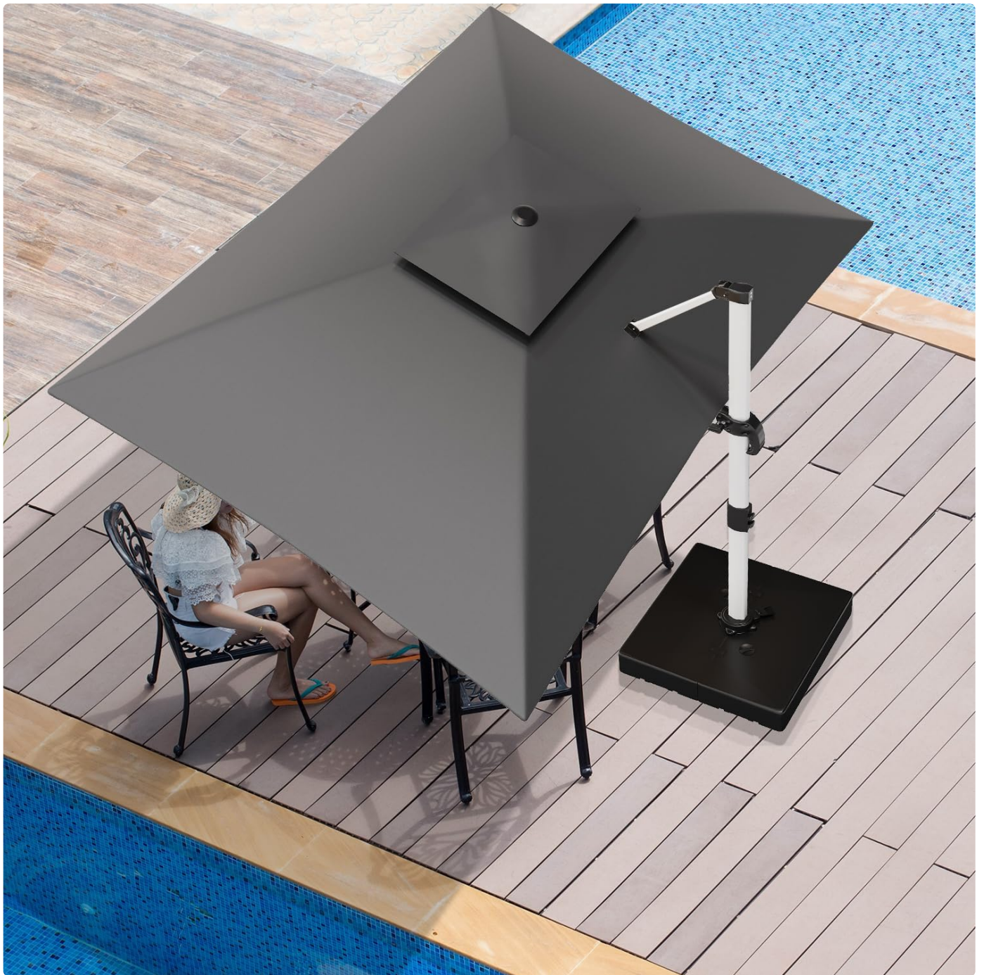
Image 4.1: The umbrella's cross base requires additional weights for stability, as shown in this overhead view.