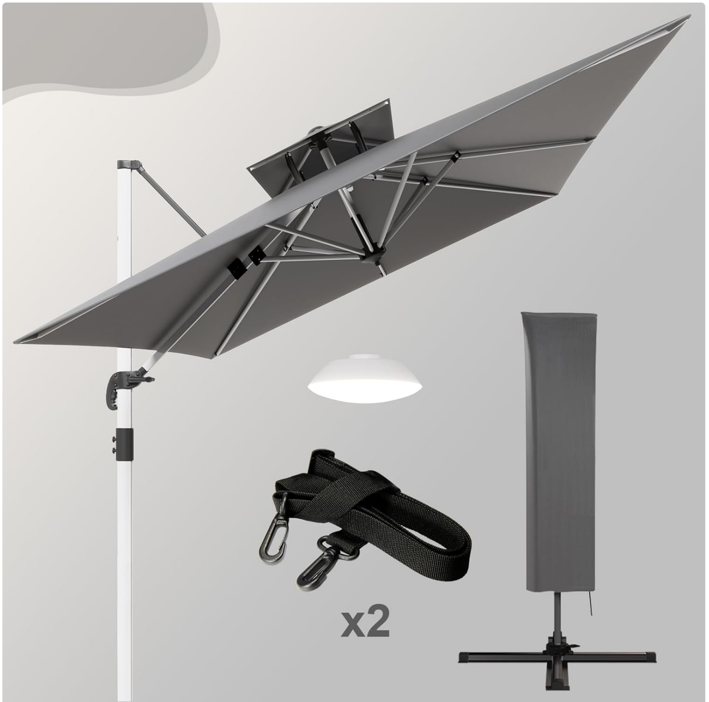
Image 3.1: Overview of the umbrella components, including the canopy, main pole, base, LED light, and protective cover.