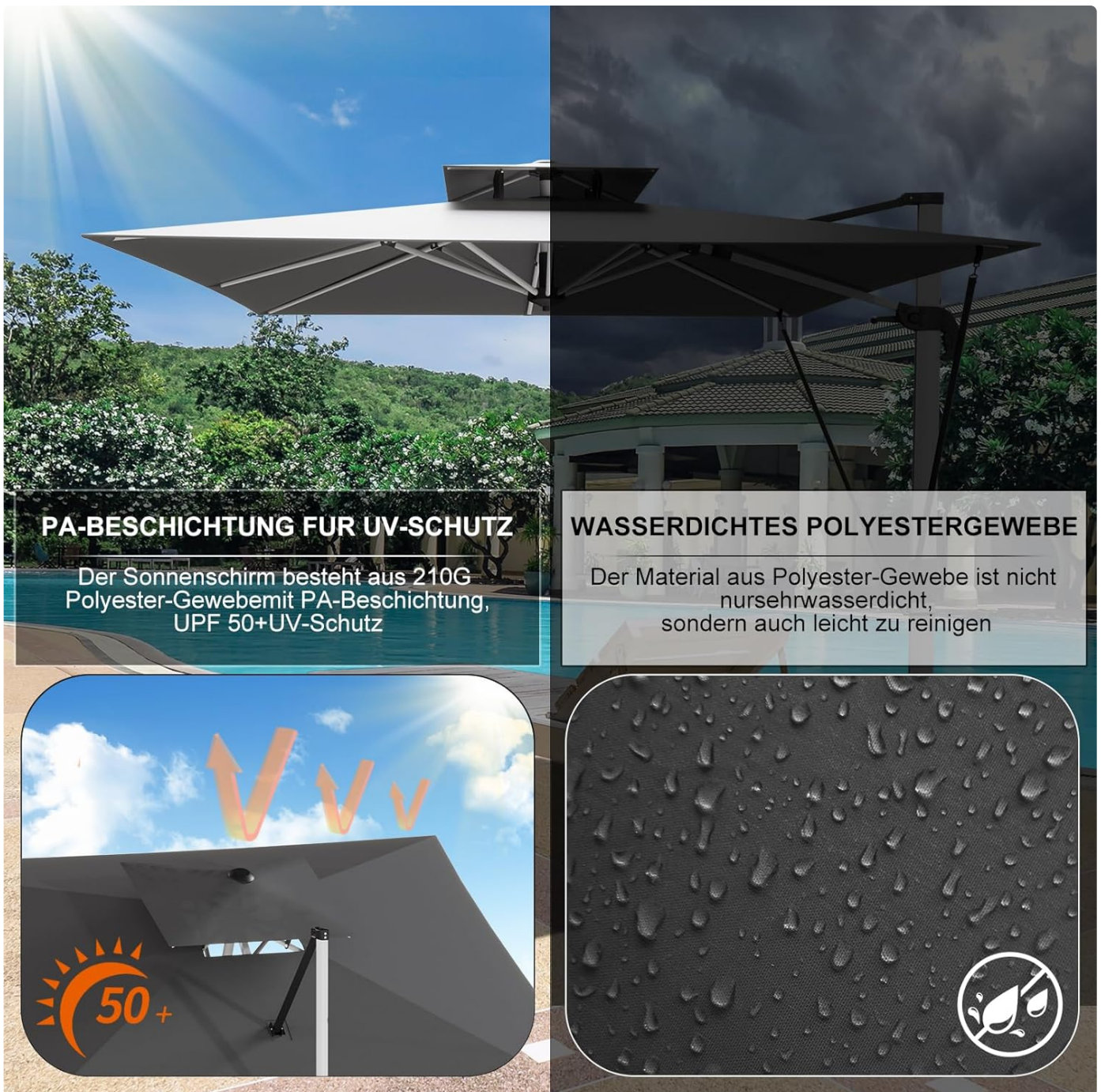
Image 6.1: The umbrella canopy is designed with PA coating for UV protection (UPF 50+) and is made from waterproof polyester fabric for easy cleaning.