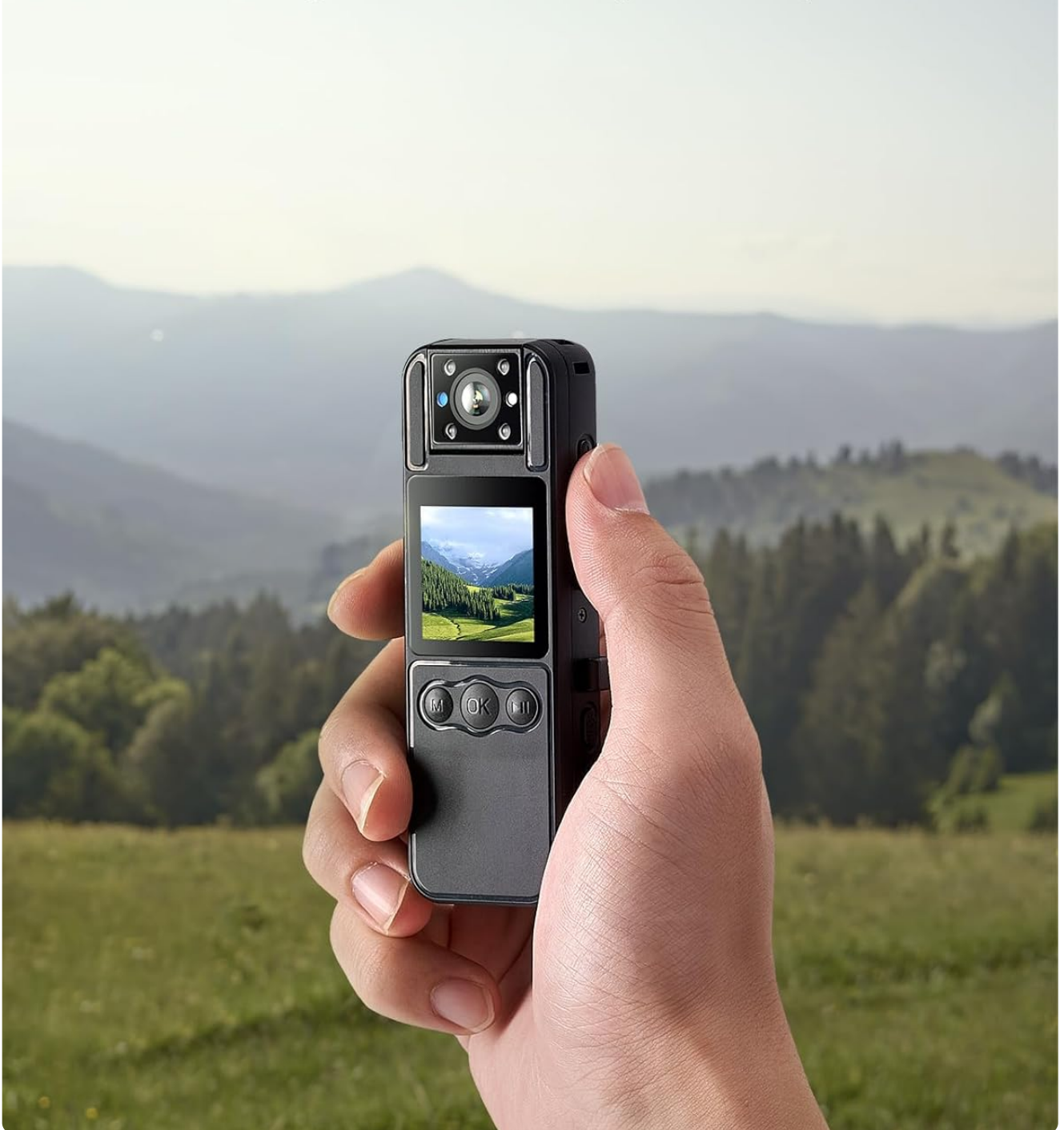
Image: A hand holding the BOBLOV A26 Body Camera, demonstrating its portability and clear 1080P HD video capability against a natural landscape background.

Shooting for Clear Footage for Daily Life