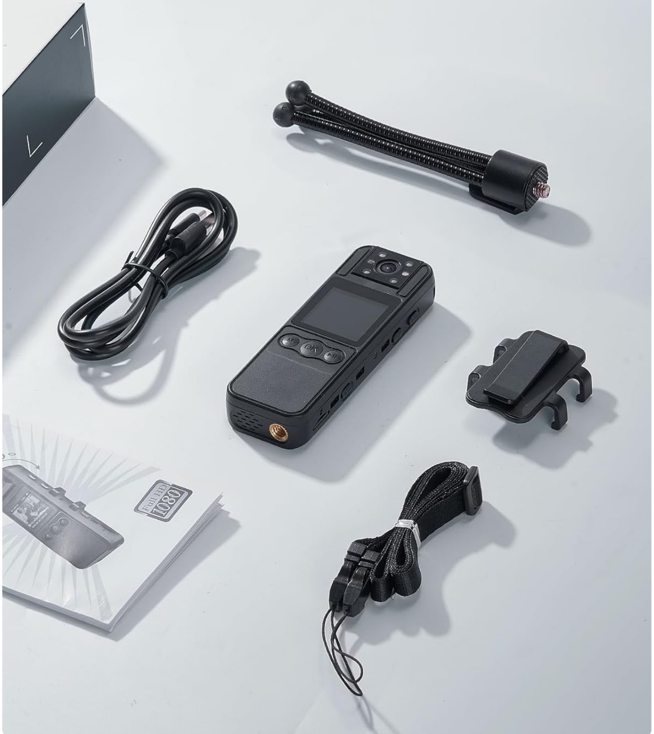
Image: All components included in the BOBLOV A26 package, neatly arranged on a white surface, showing the camera, tripod, clip, lanyard, USB-C cable, and user manual.