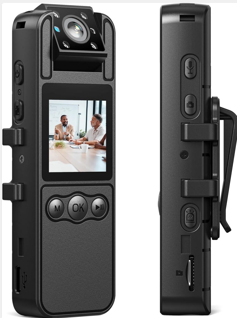
Image: Front and side view of the BOBLOV A26 Body Camera, showcasing its compact design and various buttons and ports.