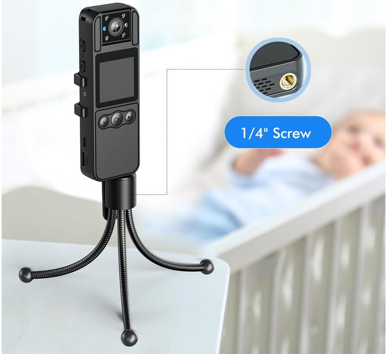
Image: The BOBLOV A26 Body Camera mounted on its included flexible tripod, demonstrating its use for stable monitoring in various environments.

1/4" Screw Hole on Bottom for Multi-functional Use