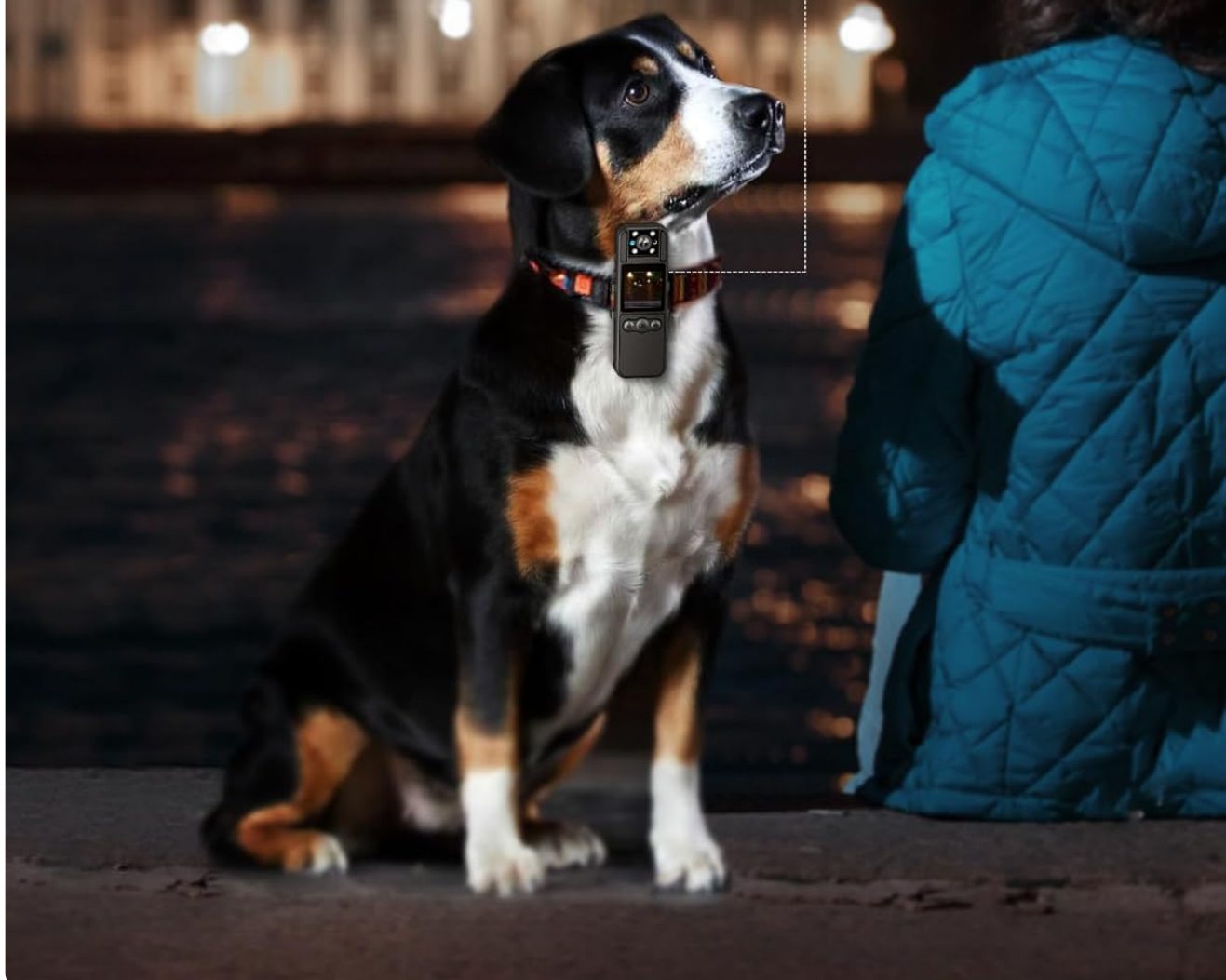
Image: The BOBLOV A26 Body Camera shown in a low-light setting, with an overlay indicating the long press action to activate its night vision feature, capturing moments effectively at night.