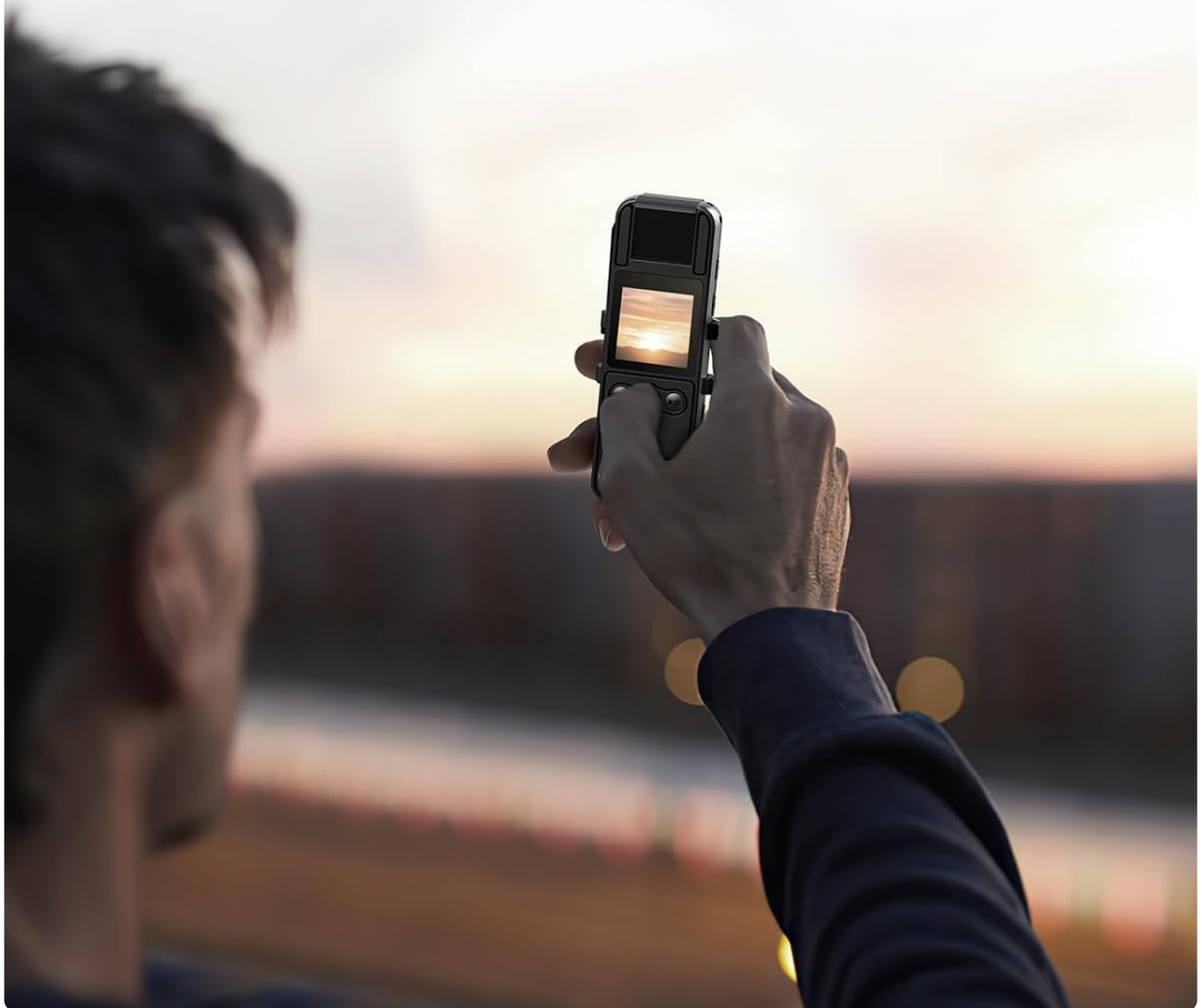
Image: A visual representation of the BOBLOV A26 Body Camera's 180-degree rotatable lens, showing its flexibility to capture different angles (0°, 90°, 180°).