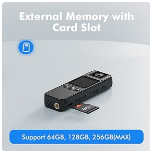
Image: A close-up view of the BOBLOV A26 Body Camera showing the external memory card slot with a Micro SD card partially inserted, indicating support for up to 256GB.