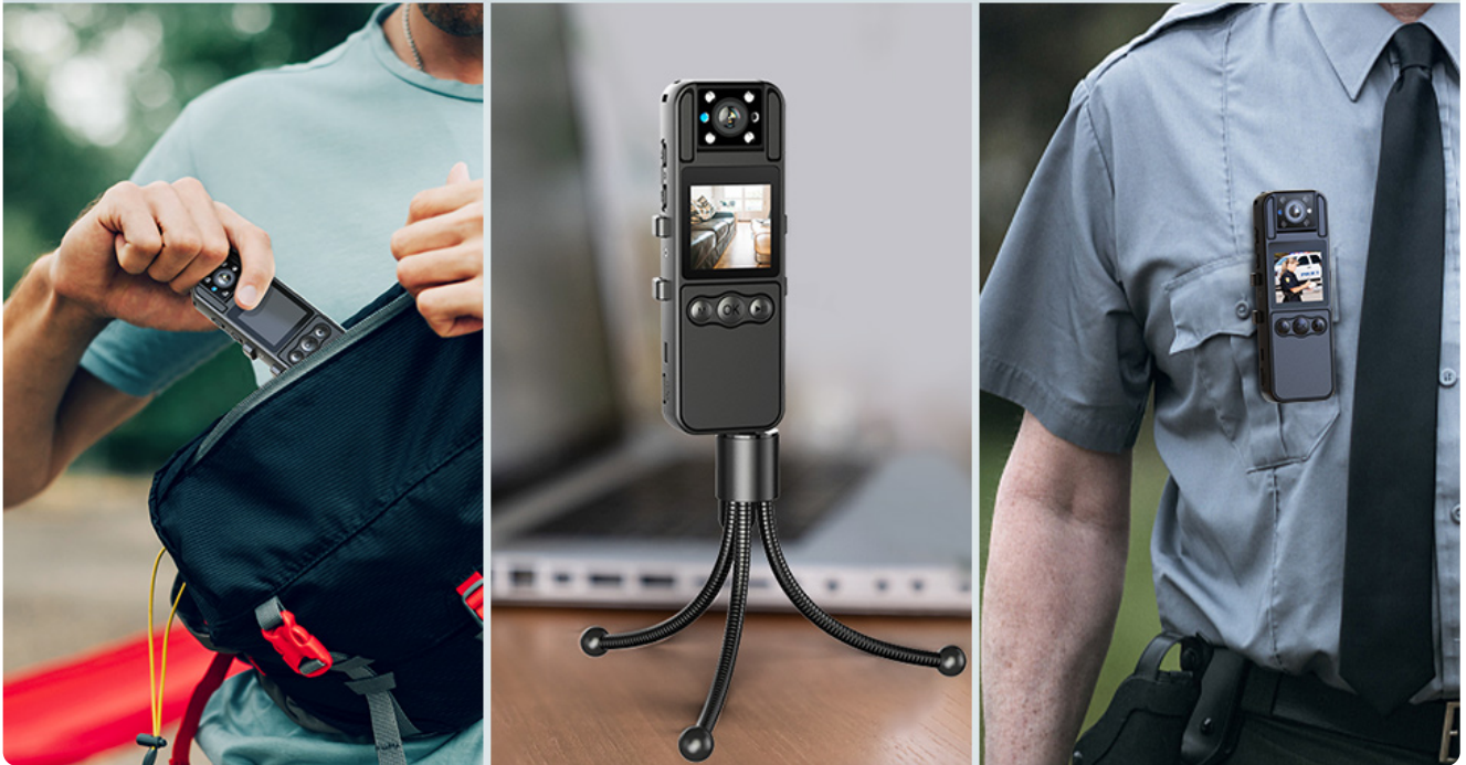
Image: A collage showing the BOBLOV A26 Body Camera in different use scenarios: carried in a bag, mounted on a tripod for stationary recording, and clipped to a uniform for body-worn use.