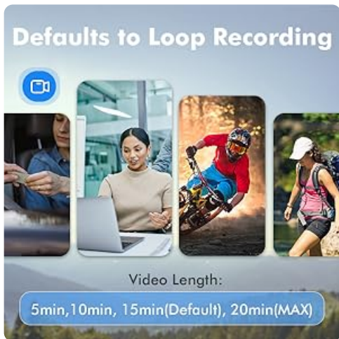
Image: A graphic illustrating the loop recording feature of the BOBLOV A26 Body Camera, showing customizable video lengths (5min, 10min, 15min, 20min) for continuous recording.

The camera supports loop recording, which automatically overwrites the oldest files when the memory card is full. You can set video segment lengths to 5, 10, 15 (default), or 20 minutes through the camera's settings.