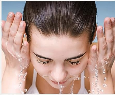
Clean the skin