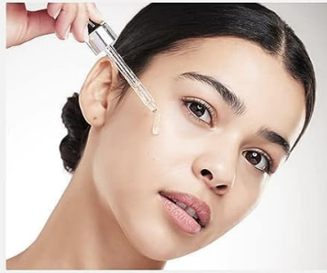
Apply the massage oil/ cream