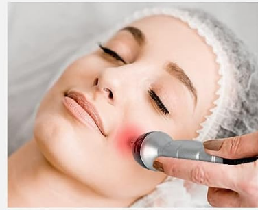
Treat with the massage probe