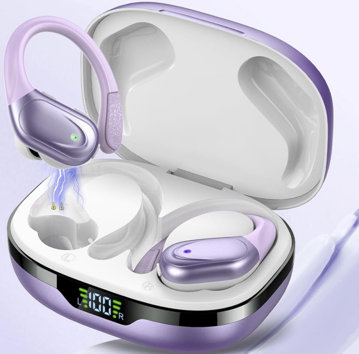
Image: Close-up of the charging case's dual LED digital display, indicating power levels for the case and individual earbuds.