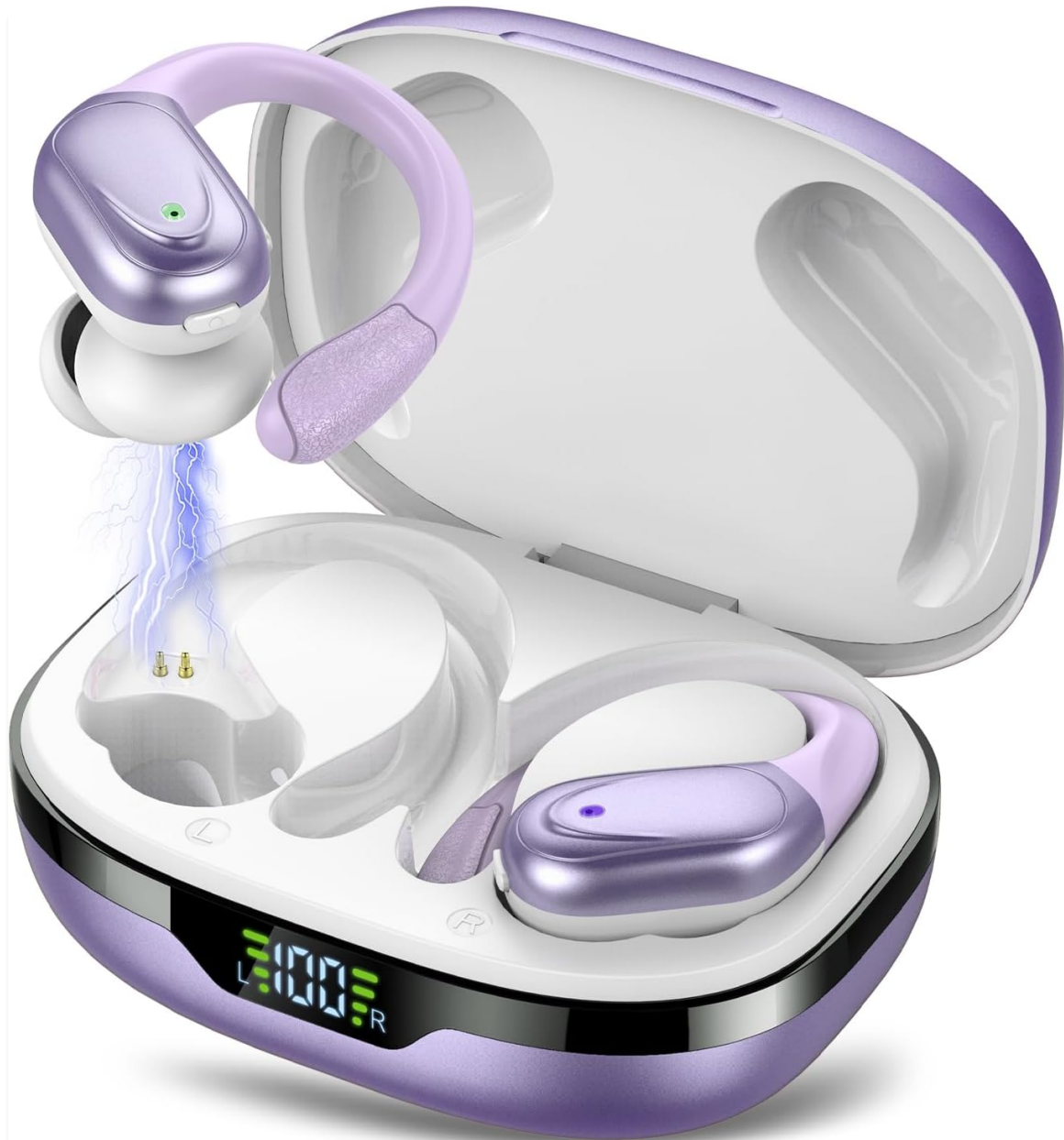
Image: CASCHO BX17 Wireless Earbuds in their open charging case, showing the digital battery display.

Before first use, fully charge the earbuds and the charging case. Place the earbuds into the charging case. Connect the USB-C charging cable to the charging port on the case and a power source. The LED digital display on the case will show the battery percentage. Each grid represents 25% of the power. The LED light will flash during charging.