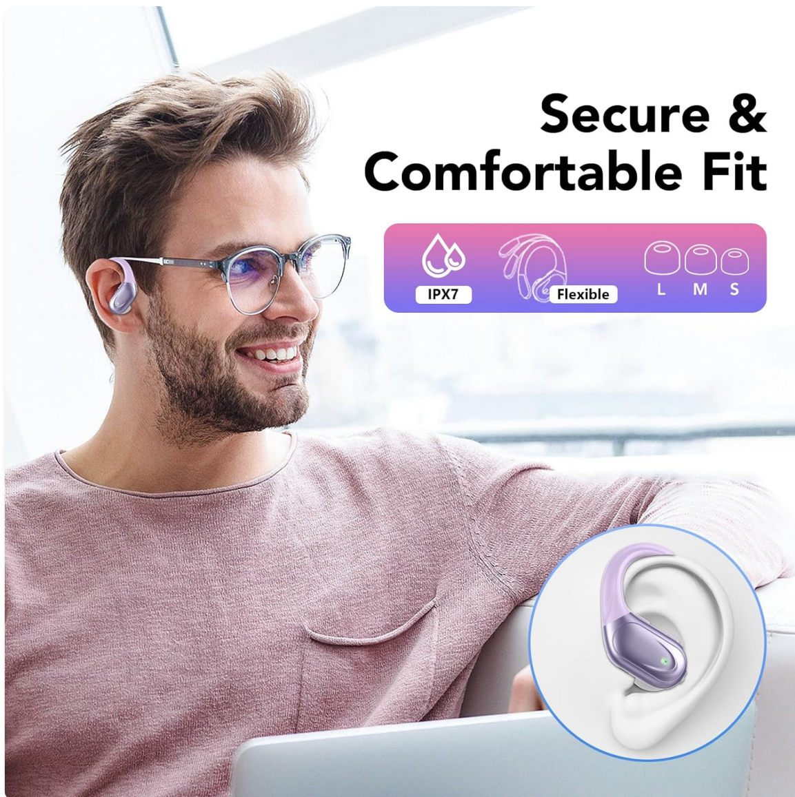
Image: A person wearing the earbuds, highlighting the secure and comfortable fit provided by the flexible earhooks and different eartip sizes.