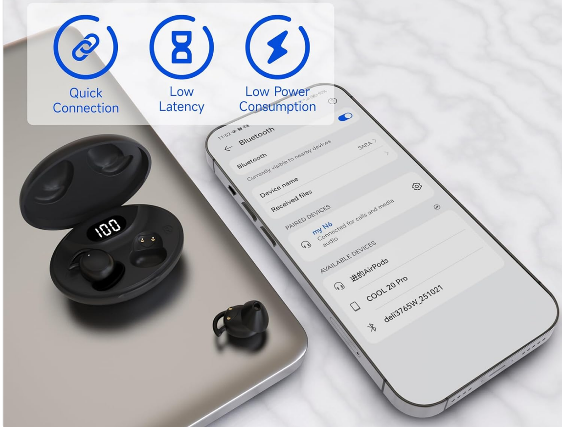
Image: A visual representation of the one-step pairing process via Bluetooth 5.3, showing quick connection, low latency, and low power consumption.

It will automatically connect when the lid is opened after first connection.