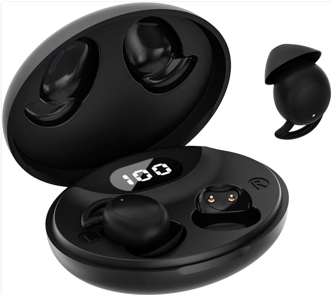
Image: The esonstyle S13 Invisible Sleep Earbuds shown with their compact charging case. One earbud is displayed outside the case, highlighting its small, flat design.