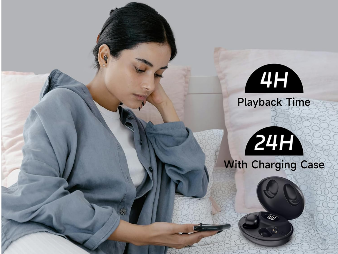
Image: An illustration showing the battery life of the earbuds (4 hours playback) and the charging case (up to 24 hours total with case charges).

The earbuds battery life is 4H and the charging case lasts up to 20H.