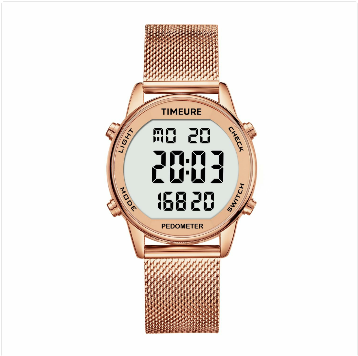
Image: TIMEURE TU-2401 Rose Gold Step Counter Watch.