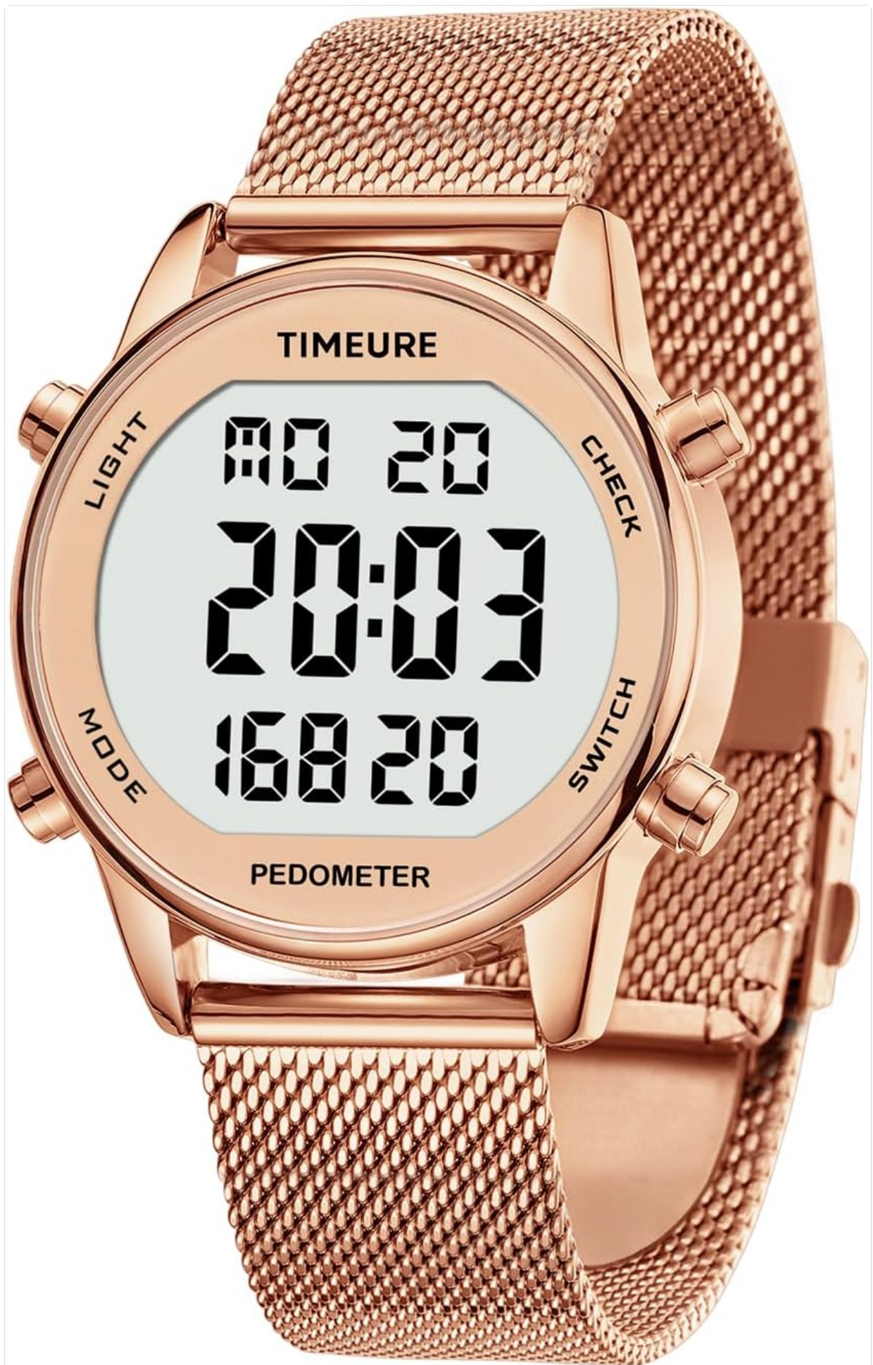
Image: Water resistance capabilities of the watch.