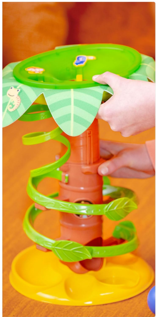
Image: A close-up of hands adjusting the height of the toy's central column, demonstrating its two adjustable height settings.