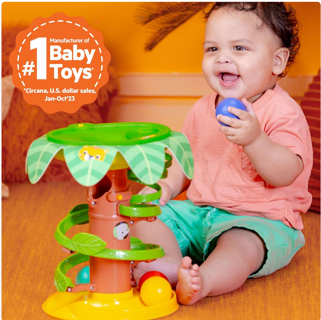
Image: A baby playing with the Tropical Twirl Ball Play Toy, which features a palm tree design with a spiraling ramp and a base for balls. The baby is dropping a blue ball into the top of the toy.