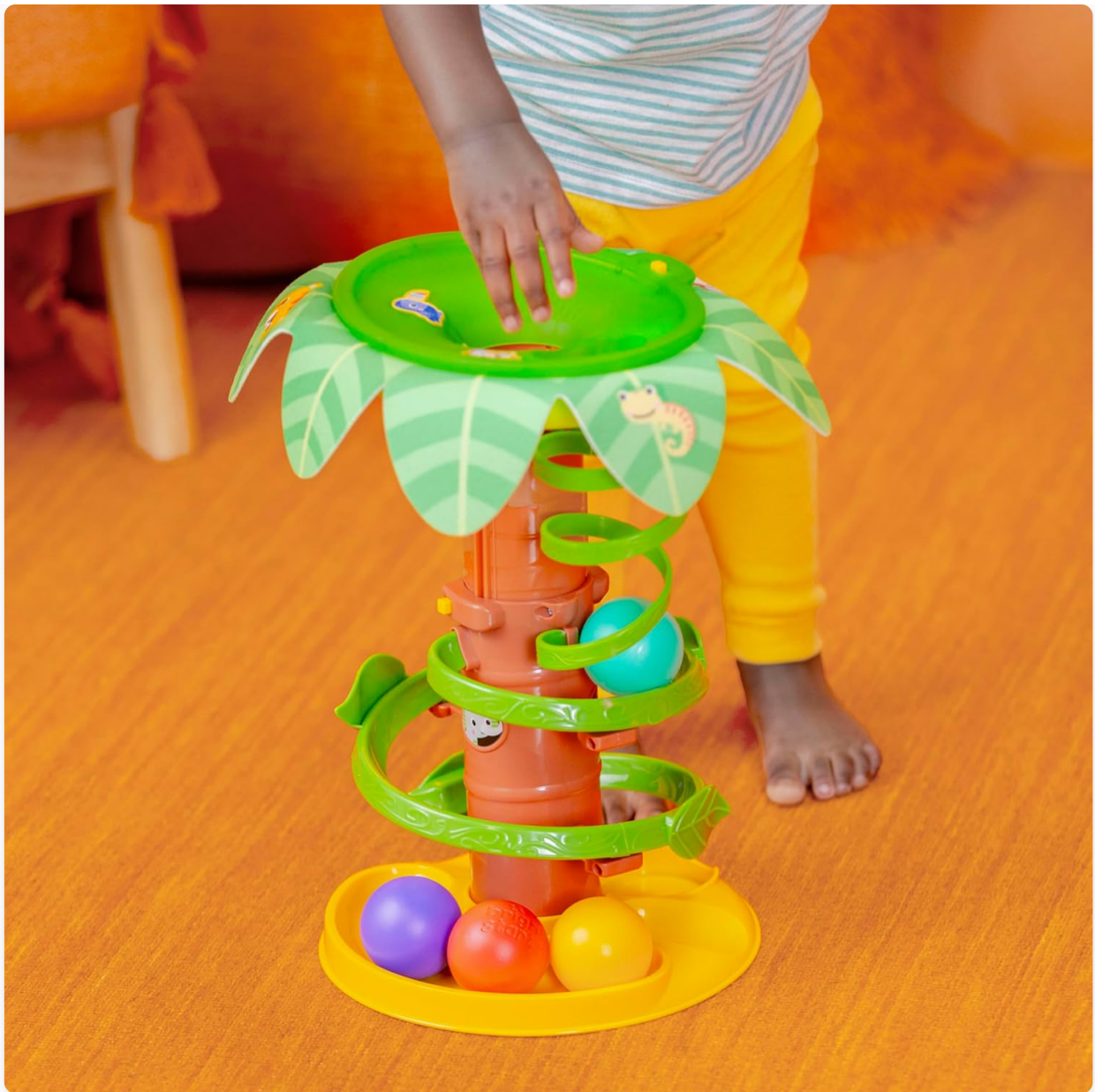
Image: A child actively dropping a ball into the toy, demonstrating the cause-and-effect play.