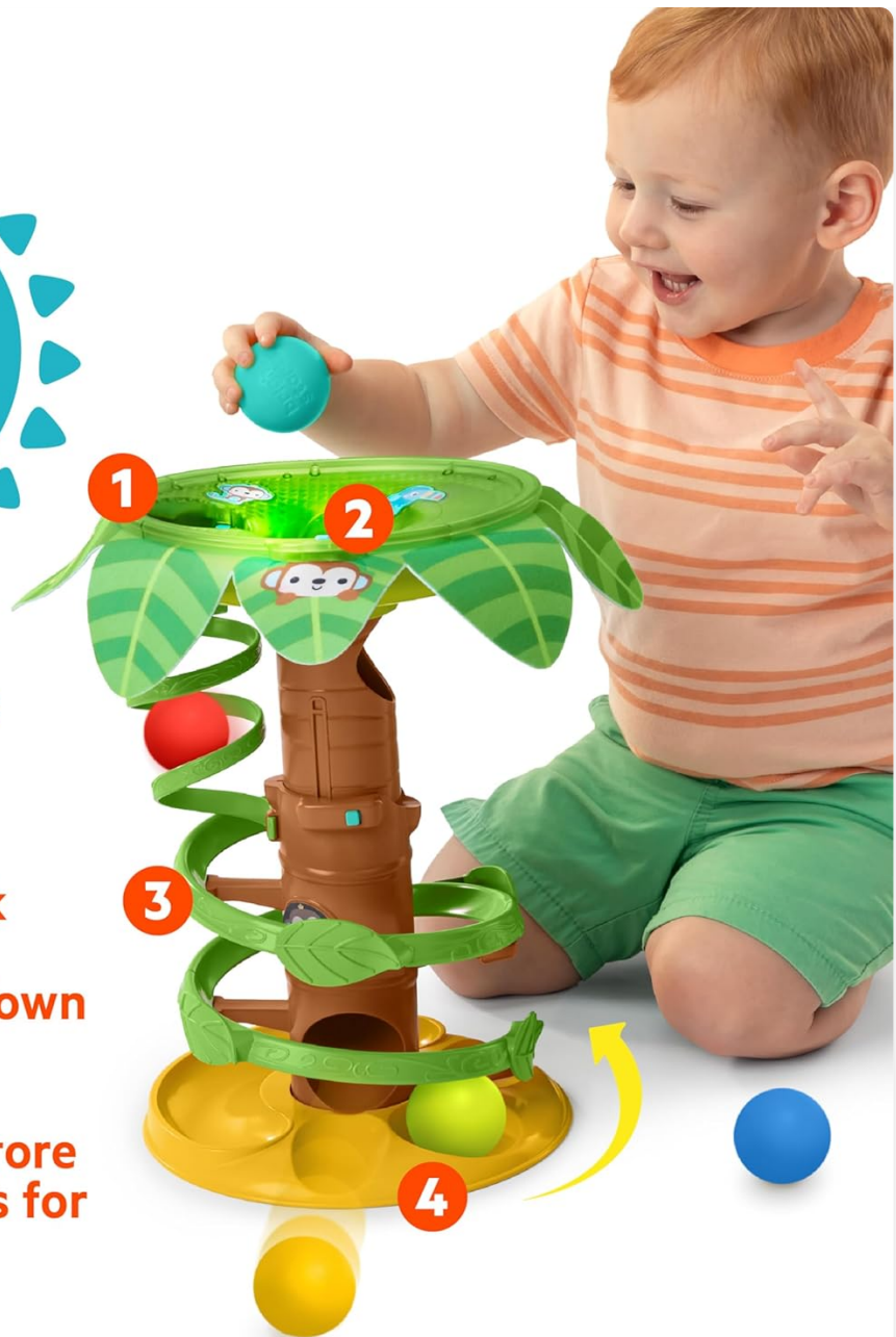
Image: A visual guide showing four interactive play modes for the toy, including pressing buttons, dropping balls, and using the base for ball release.

4. Turn base to store or release balls for more fun!