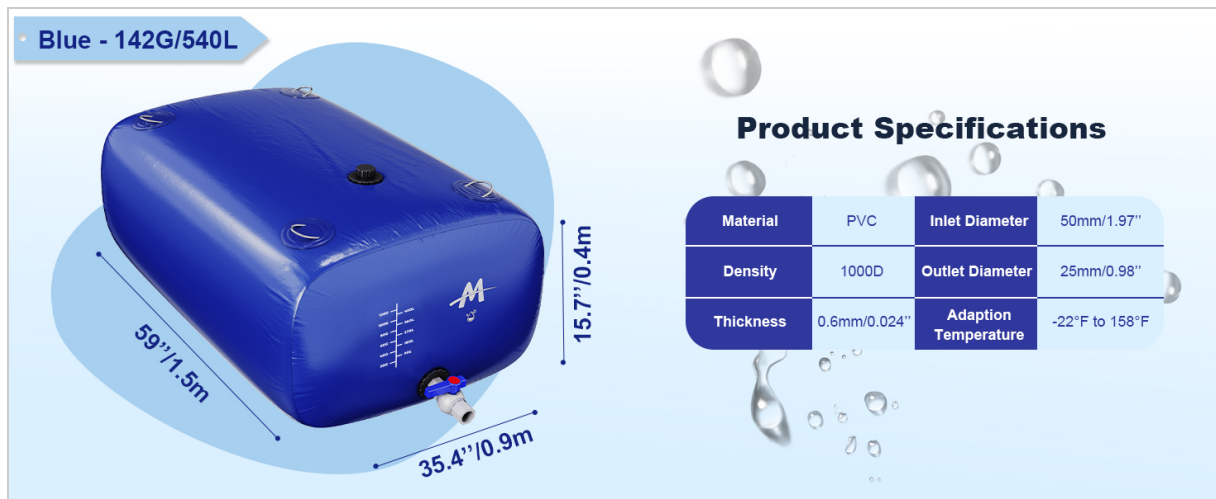
Figure 5: Detailed product specifications for the Moongiantgo Water Bladder.