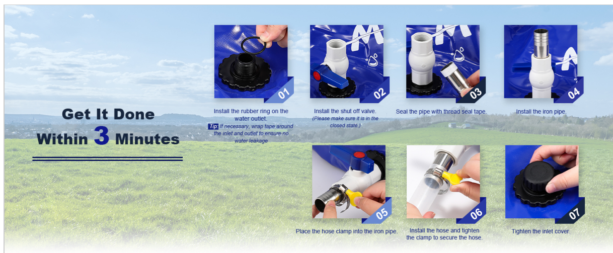
Figure 3: Detailed steps for installing the water outlet components.