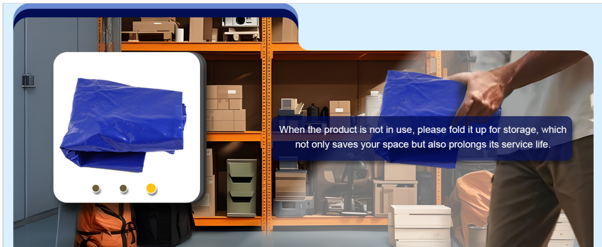
Figure 4: The water bladder can be easily folded for compact storage.

When not in use, the water bladder can be folded and rolled up for compact storage. This saves space and helps prolong its service life.