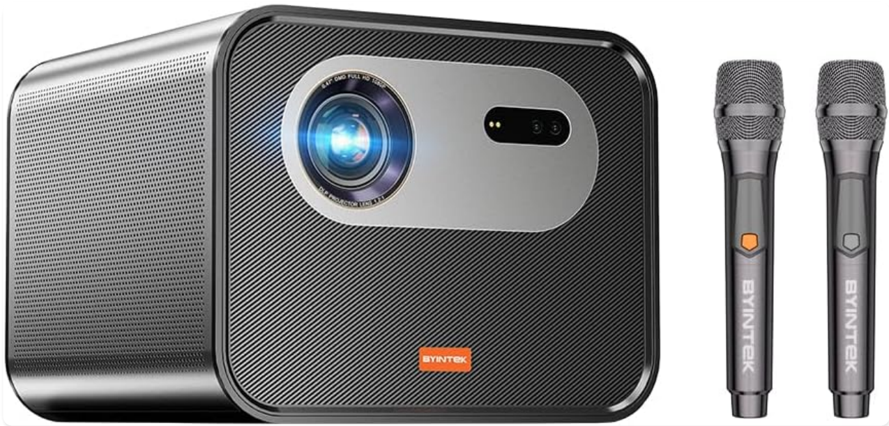
Image 2.1: The BYINTEK R90Rock DLP Projector and its accompanying wireless microphones.