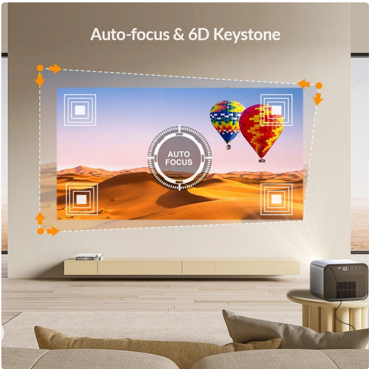
Image 3.1: The projector's auto-focus and 6D keystone correction capabilities, illustrating flexible placement options.