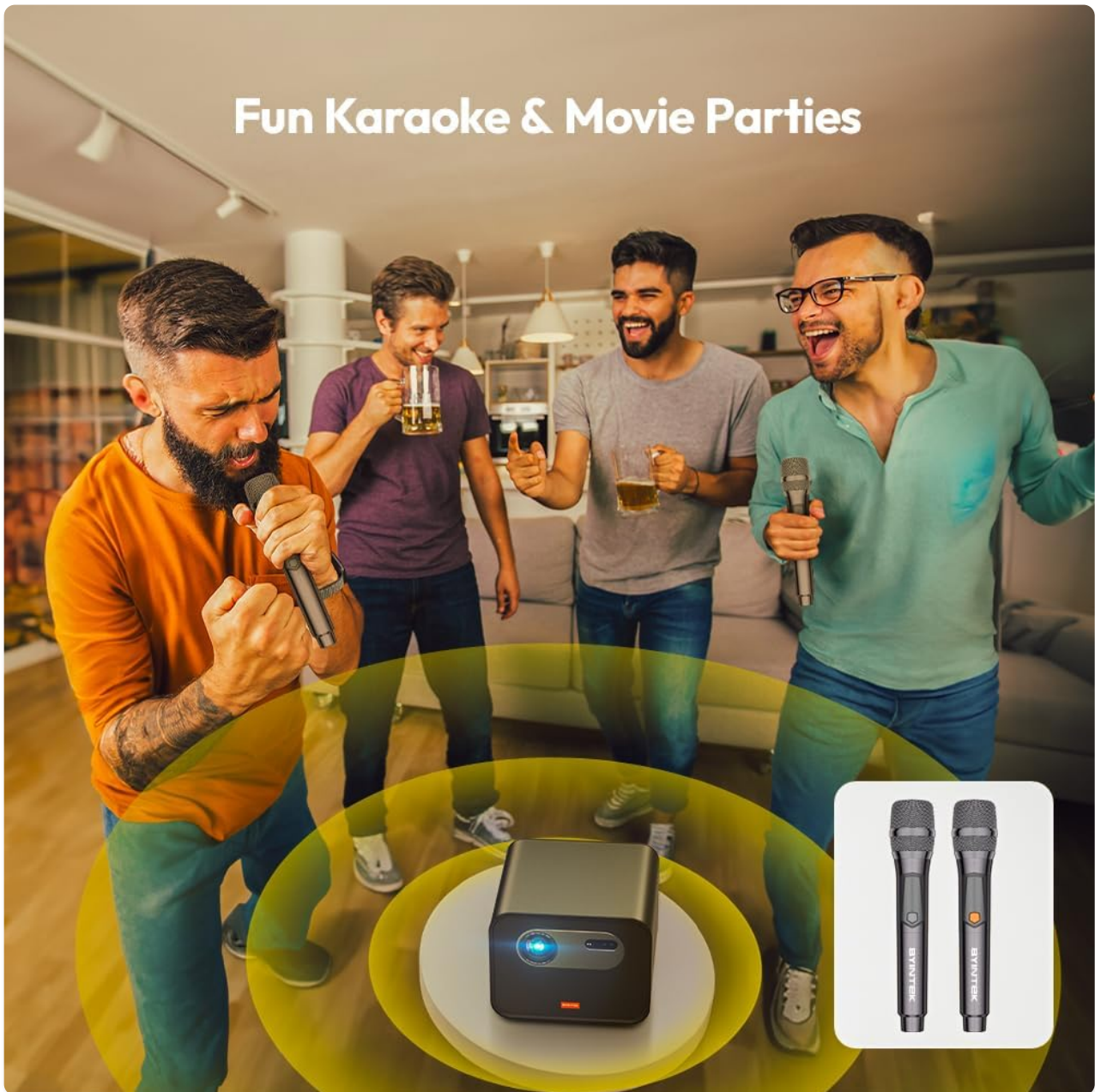
Image 4.2: Friends enjoying a fun karaoke and movie party using the projector's integrated features.