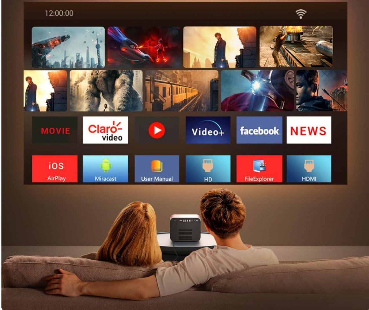
Image 3.2: The Android 11.0 interface of the projector, showing various pre-installed applications and options.