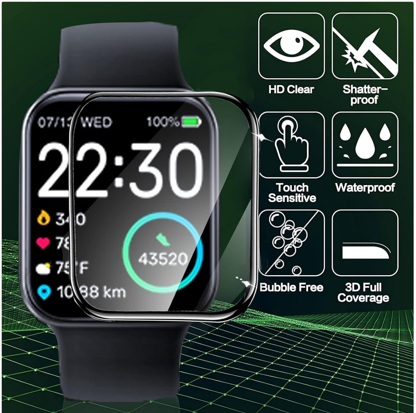
Image: Overview of the screen protector's key features.