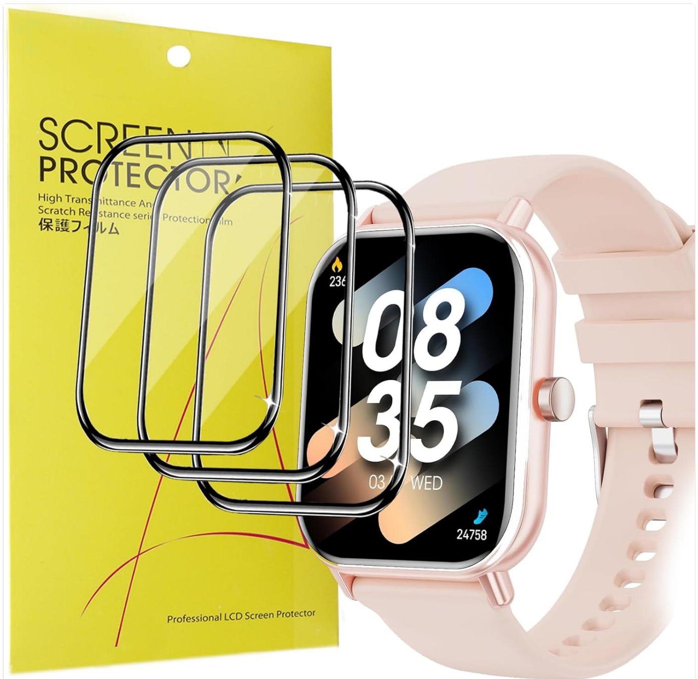
Image: Contents of the screen protector package, including the protectors and cleaning accessories.