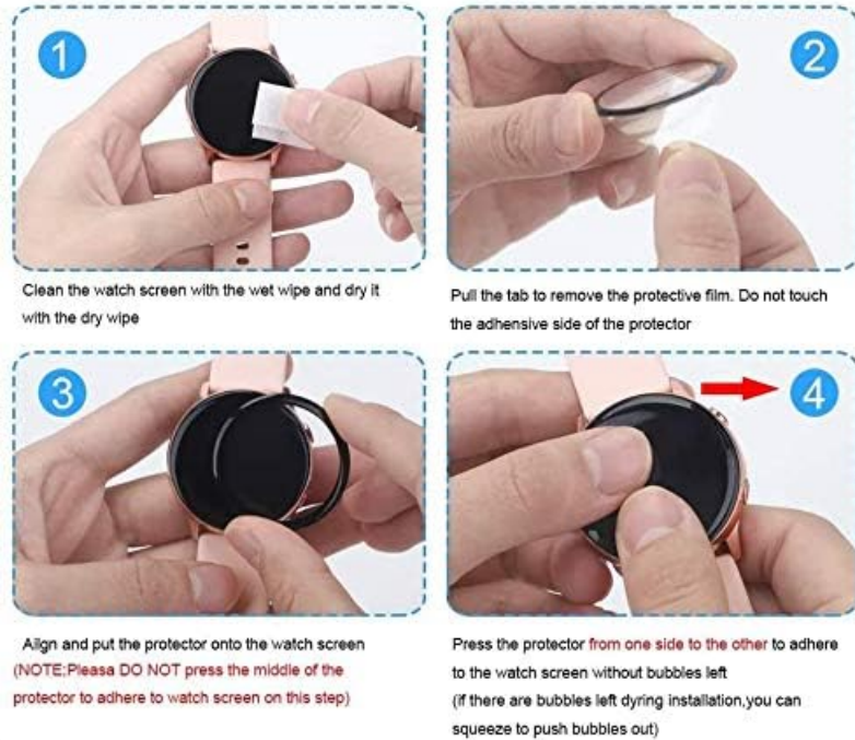
Image: Visual guide demonstrating the four steps of screen protector installation.