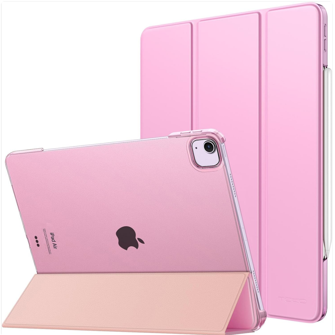
Image: The MoKo Slim Smart Shell Case in Flowers Pink, showcasing its design and how it functions as a stand for the iPad.