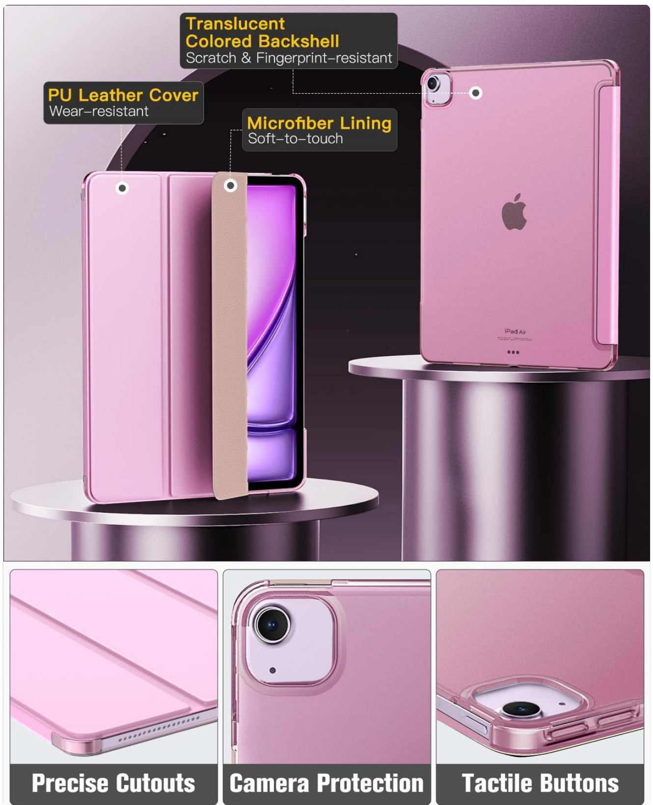
Image: Detailed views highlighting the precise cutouts for ports, enhanced camera protection, and responsive tactile buttons on the case.