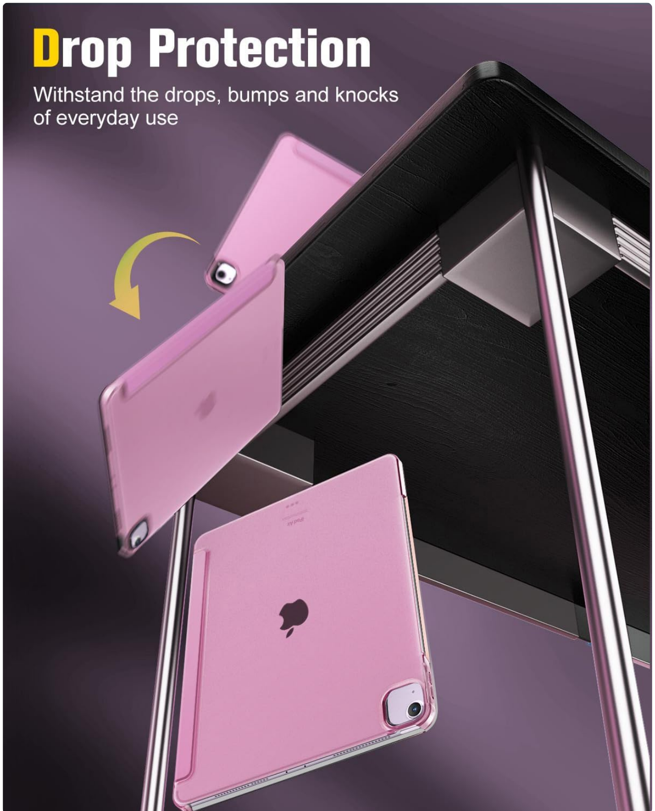
Image: The case is designed to withstand drops, bumps, and knocks from everyday use, providing robust protection for your device.