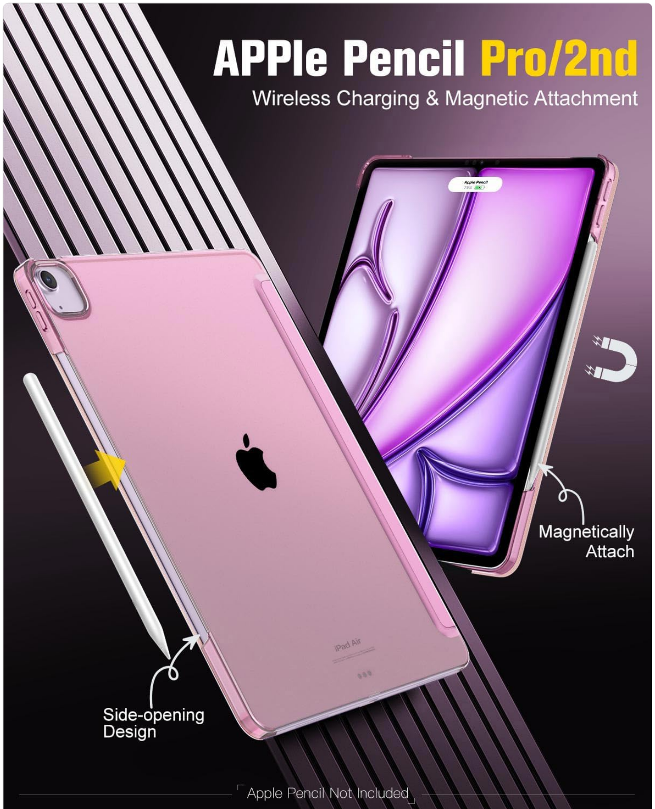
Image: Illustration demonstrating the magnetic attachment and wireless charging capability for Apple Pencil on the side of the iPad when enclosed in the case.

wireless charging of your Apple Pencil Pro, 2nd Generation, or USB-C Pencil. Simply place your Apple Pencil along the designated side edge of the iPad while it is in the case.