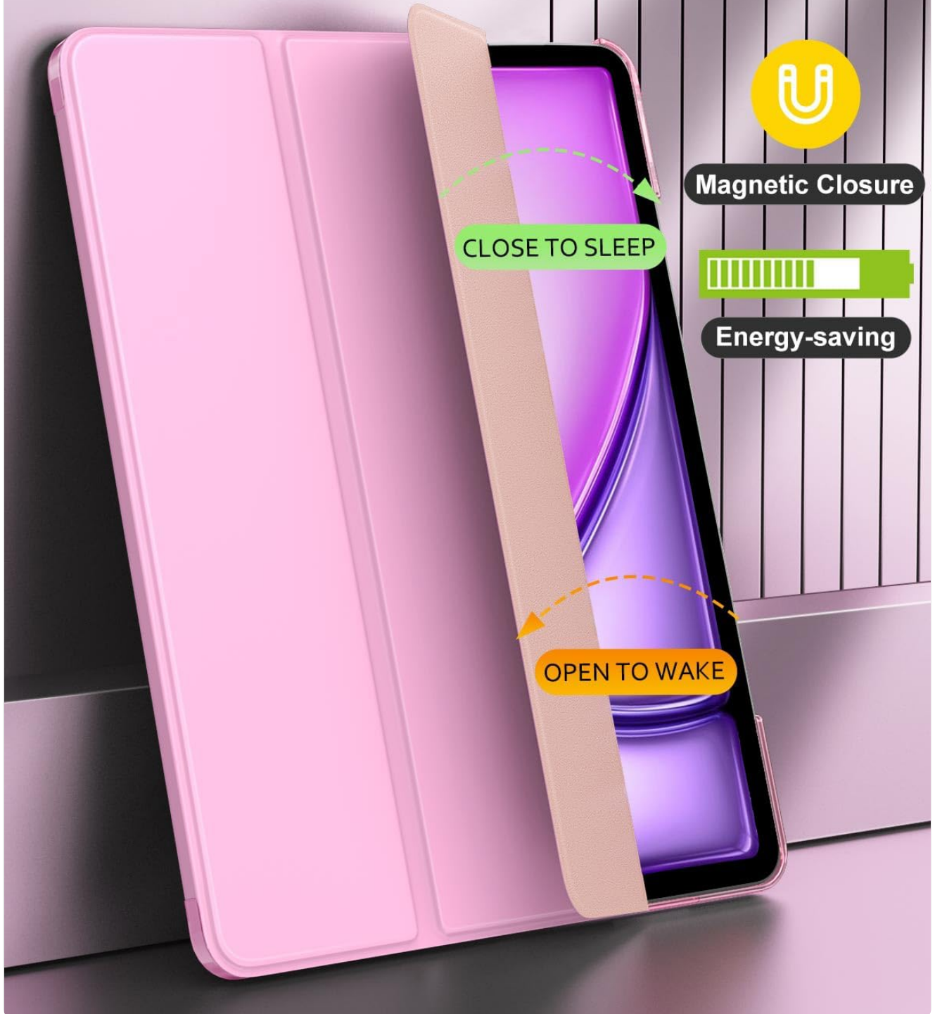
Image: A visual representation of the smart wake/sleep feature, showing how opening the cover wakes the iPad and closing it puts it to sleep, conserving battery.

You're just a flip away from the digital world