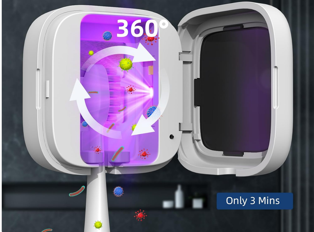
Image: The SwanKiss ES X3 UV-C Toothbrush Sanitizer and Holder in white.

Authoritative certification with a 99.9% sterilization rate