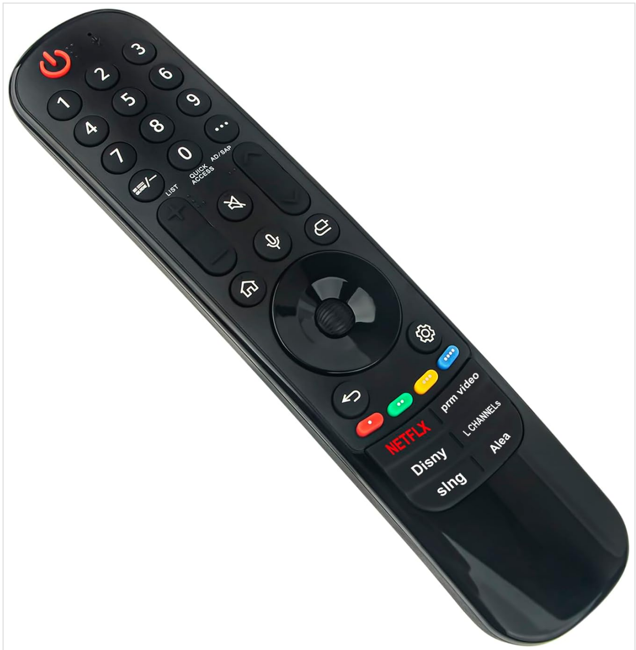
Figure 2.3: Angled view of the remote, demonstrating its contoured shape for comfortable grip.