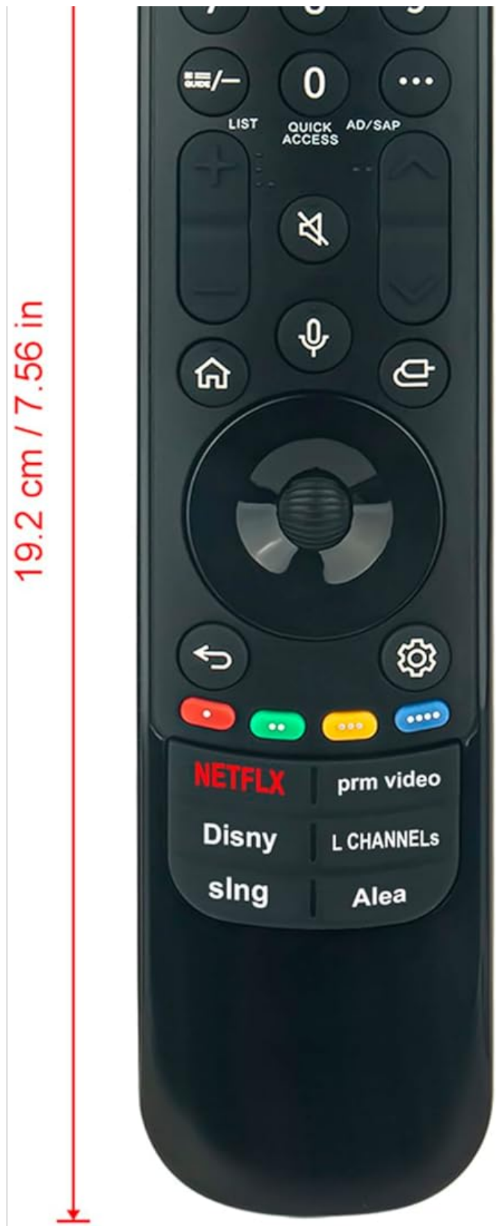
Figure 2.4: Image displaying the dimensions of the remote control: approximately 19.2 cm (7.56 inches) in length and 4.2 cm (1.65 inches) in width.