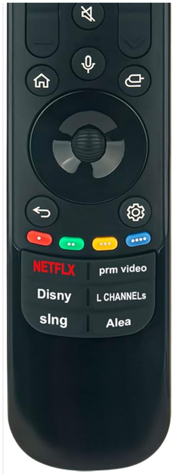
Figure 2.1: Front view of the VINABTY MR23GA Magic Remote Control, showcasing its button layout including number pad, navigation wheel, voice control button, and streaming service shortcuts.