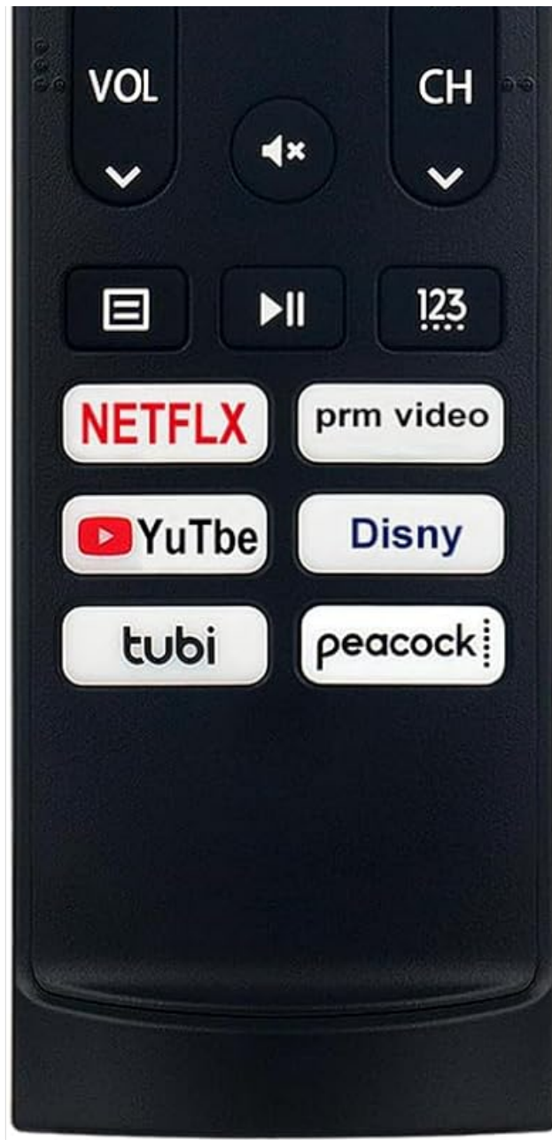
Image 1.1: Front view of the VINABTY Voice Remote Control, displaying all buttons including power, input, Google Assistant, navigation, volume, channel, and streaming service shortcuts.