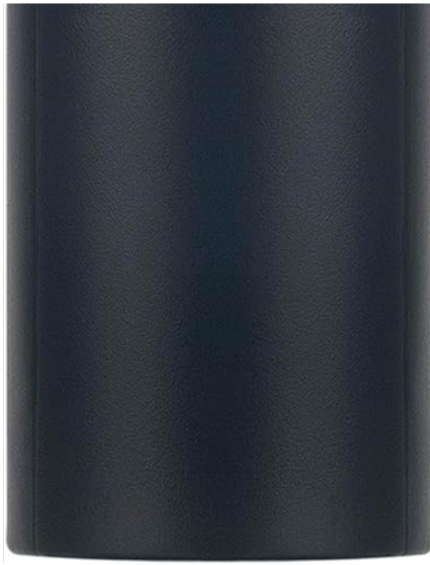
Image 3.1: Back view of the remote control, illustrating the battery compartment for AAA batteries.