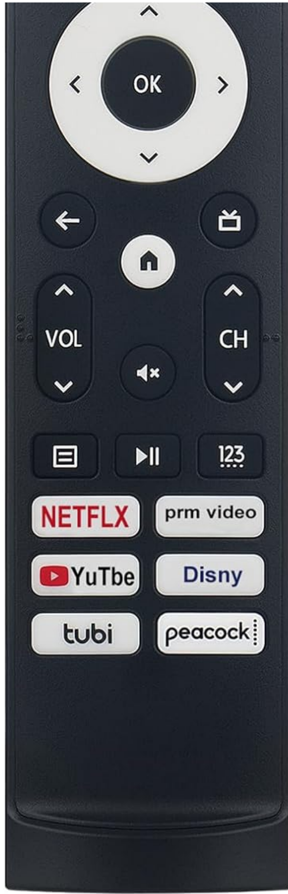
Image 7.1: The remote control with its approximate dimensions: 6.5 inches in length and 1.57 inches in width.