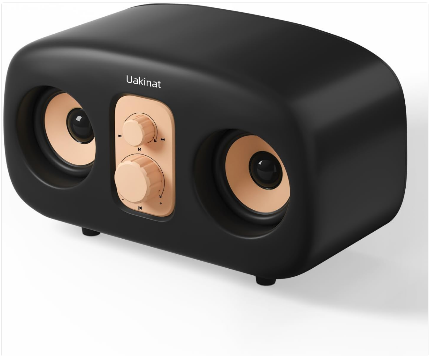
Front view of the Uakinat Bluetooth Wireless Speaker, showcasing its compact design and control knobs.