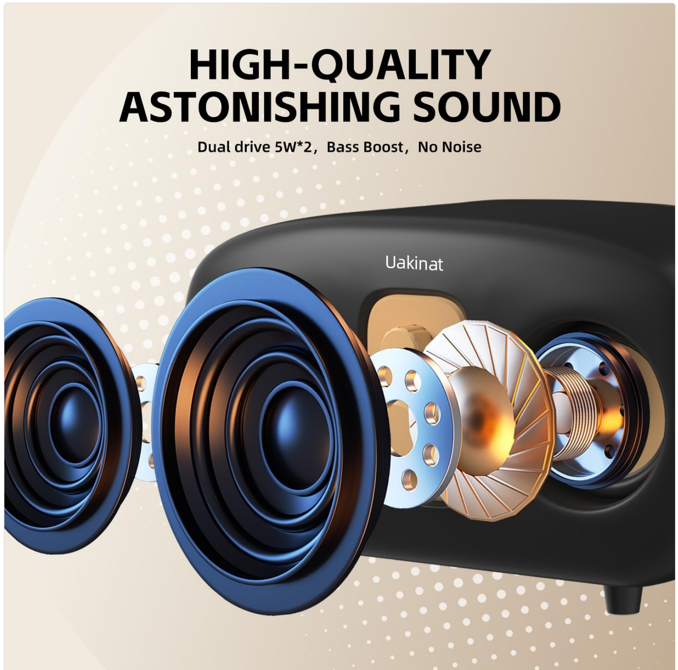
Illustration highlighting the dual 5W drivers and bass boost technology for superior sound quality.