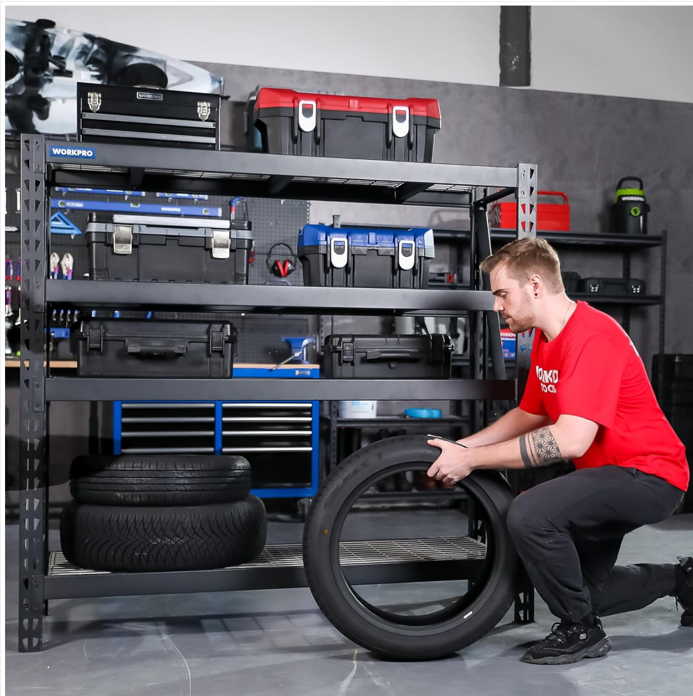
Image: A user demonstrating the placement of heavy items, such as tires, on the shelving unit.