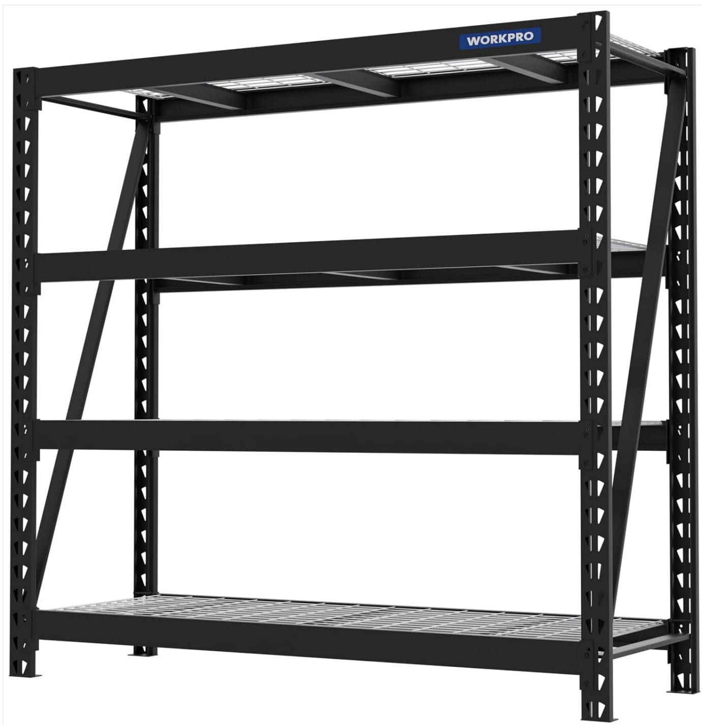
Image: A fully assembled WORKPRO garage shelving unit, ready for use.

An assembly video may be available from the manufacturer for visual guidance. Refer to the product page or manufacturer's website for more details.