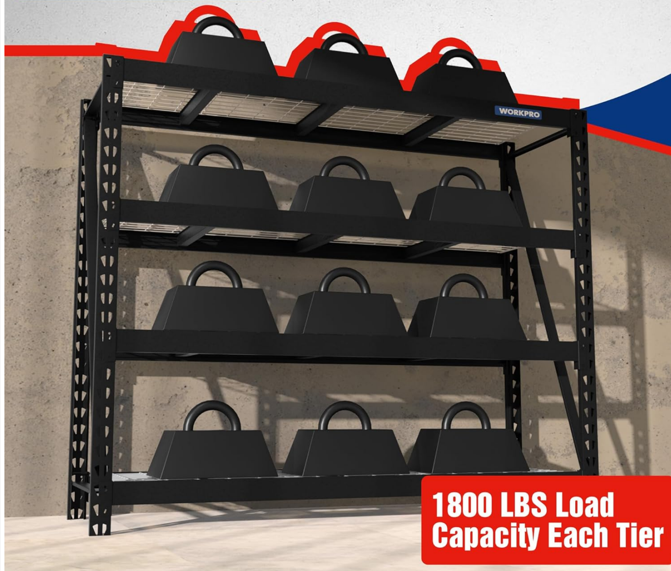
Image: The shelving unit showcasing its impressive 7200 lbs total load capacity, with each tier supporting up to 1800 lbs.