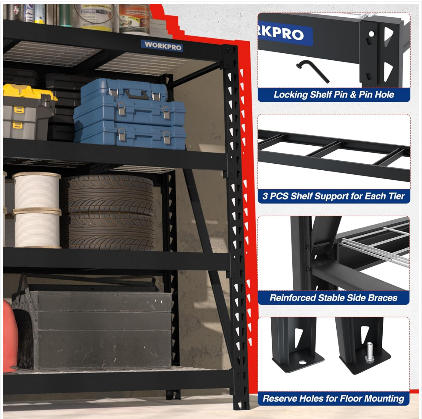
Image: Key structural components of the WORKPRO shelving unit, highlighting locking pins, shelf supports, reinforced side braces, and the floor mounting option.