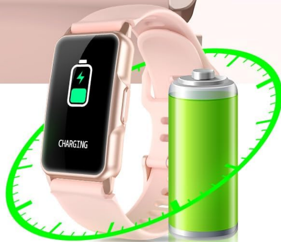
Image: Magnetic USB Charging for the Smart Watch