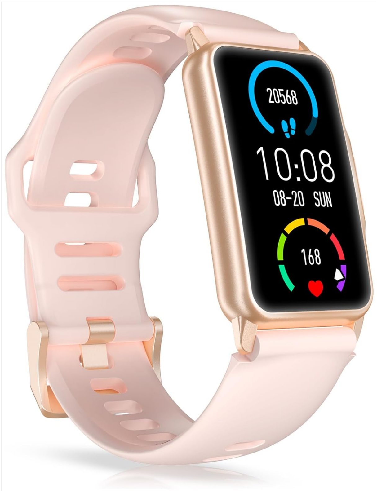
Image: Bestinn Smart Watch Fitness Tracker