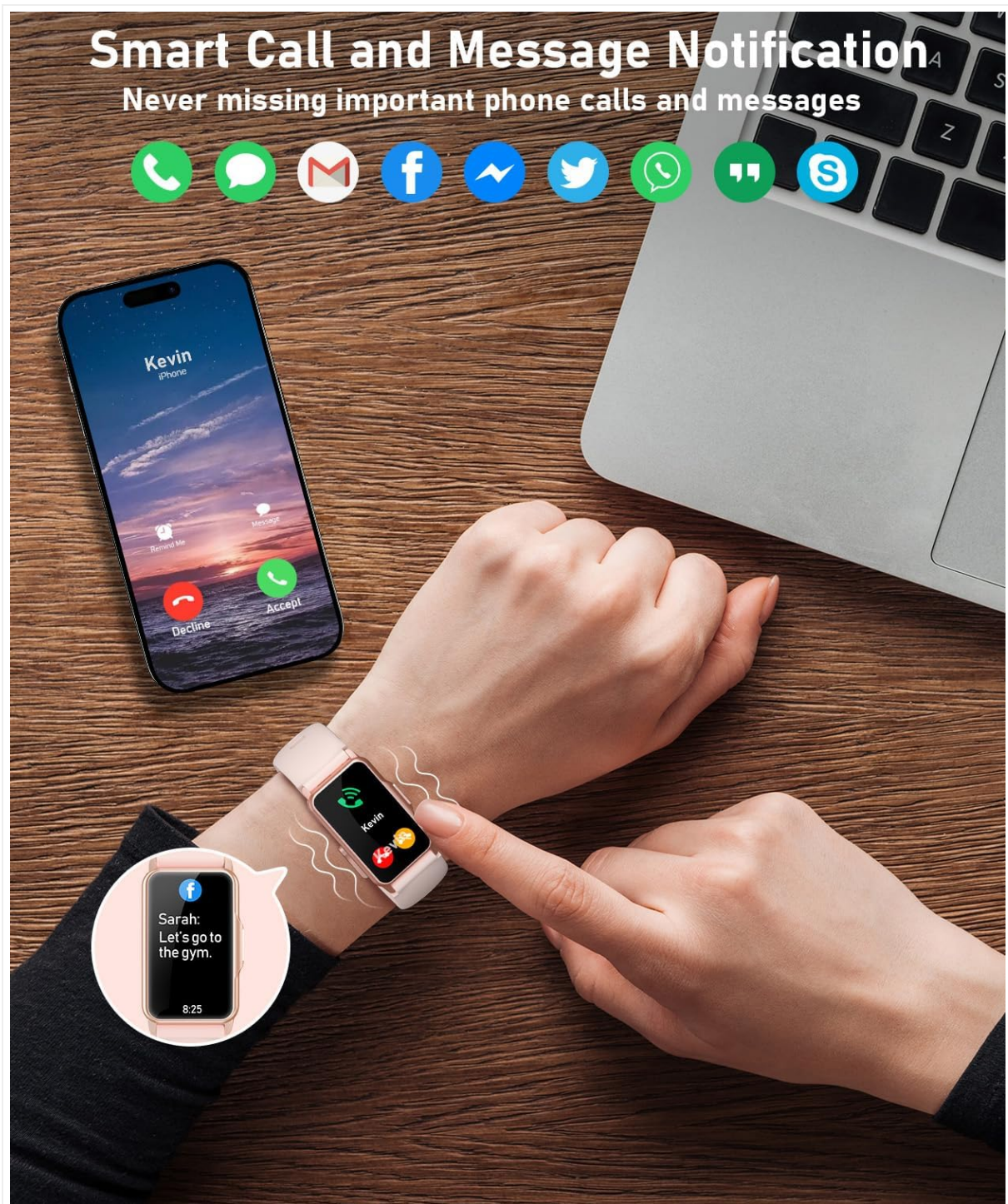
Image: Smart Call and Message Notifications