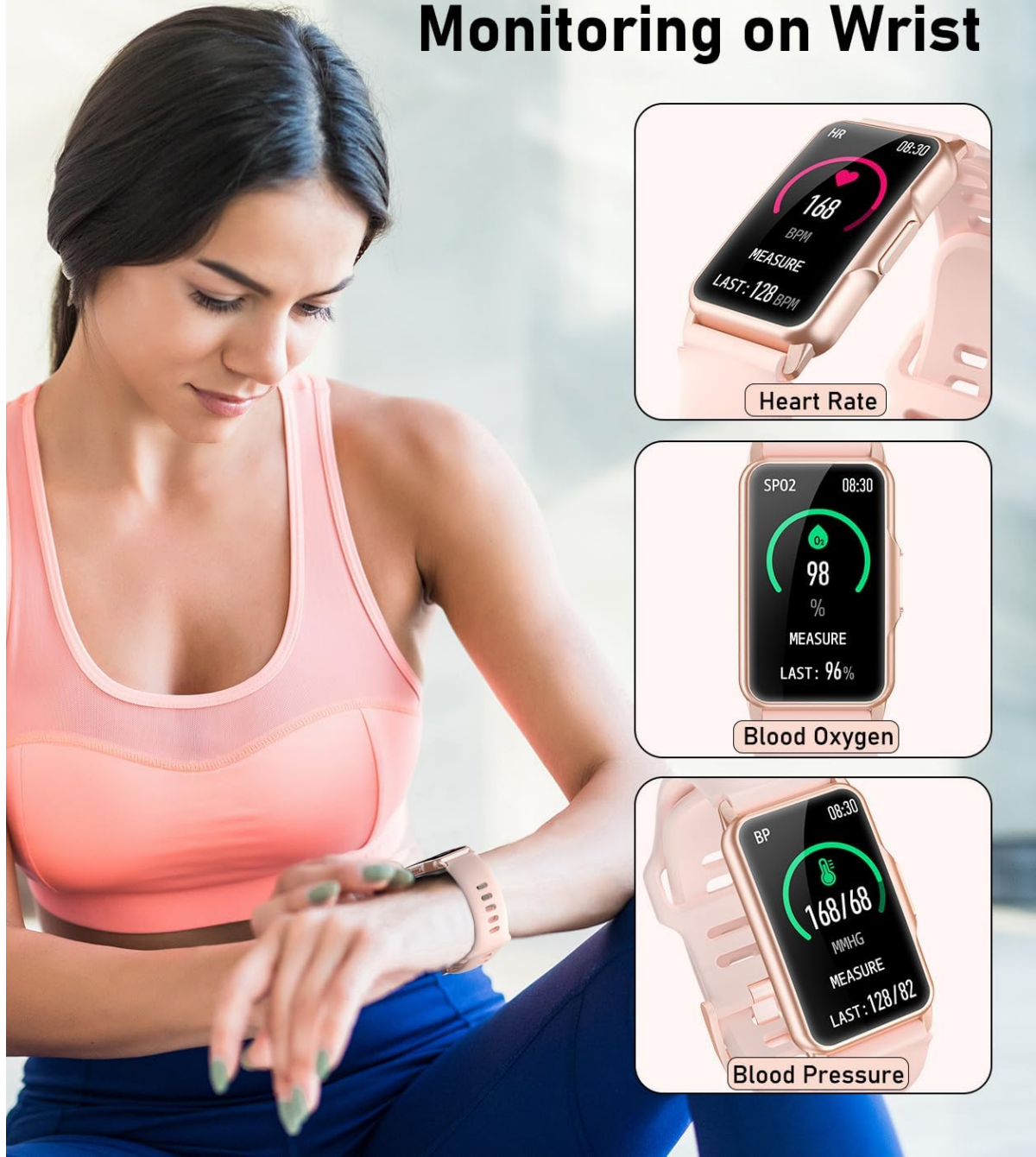
Image: Comprehensive Health Monitoring on Wrist