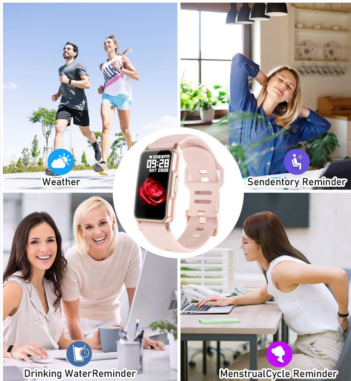
Image: Multiple Reminders and Life Assistant Features