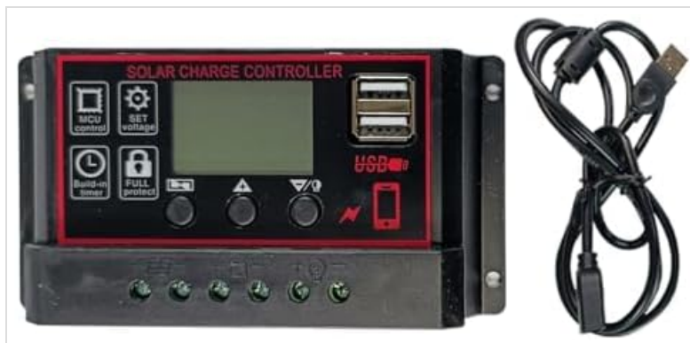
Image 1.1: The 100A Solar Charge Controller and its accompanying USB extension cable.

This manual provides detailed instructions for the installation, operation, and maintenance of your Generic 100A Solar Charge Controller. Designed to efficiently manage power from solar panels to charge 12V or 24V lead-acid, AGM, or Gel batteries, this controller utilizes PWM technology for optimal performance and battery longevity. It features dual USB ports for convenient device charging and comprehensive protection mechanisms to ensure safe and reliable operation of your solar system.