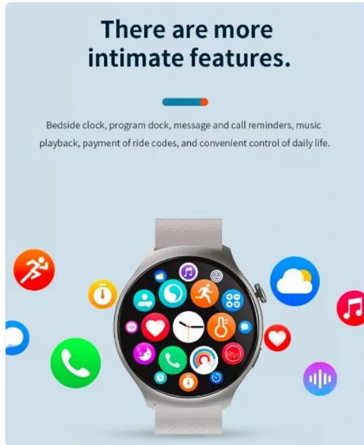
Figure 5: The Z93 Pro Smart Watch displaying a grid of application icons, representing its diverse range of features.