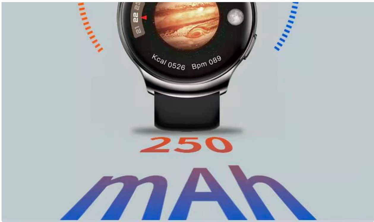
Figure 2: The Z93 Pro Smart Watch being charged wirelessly, illustrating its efficient power management and 250 mAh battery.