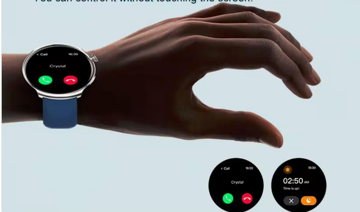
Figure 6: A hand demonstrating the two-finger gesture control feature on the Z93 Pro Smart Watch for call management.

You can control it without touching the screen.