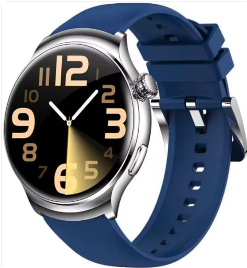
Figure 1: Front view of the Generic Z93 Pro Smart Watch, showcasing its round 1.5-inch HD display and blue strap.

This manual provides detailed instructions for the operation and maintenance of your Generic Z93 Pro Smart Watch. Please read this manual thoroughly before using the device to ensure proper functionality and longevity.