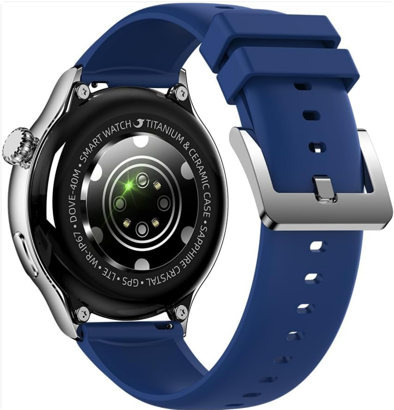
Figure 8: Rear view of the Z93 Pro Smart Watch, highlighting the health monitoring sensors and the titanium & ceramic case with sapphire crystal.