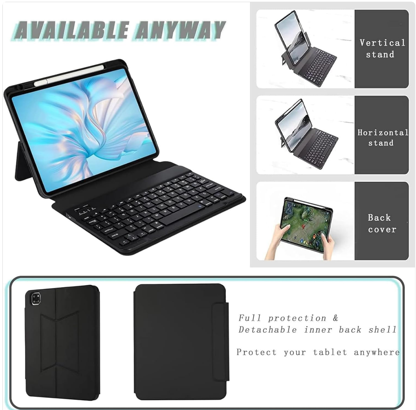
Image: Demonstrates the case's ability to function as a vertical stand, horizontal stand, and its protective back cover.

supports both portrait and landscape orientations. The transparent hard back shell showcases your iPad's original design.