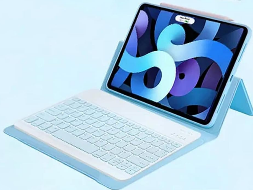
Image: Shows the dedicated space for the Apple Pencil, allowing for wireless charging while the iPad is in the case.