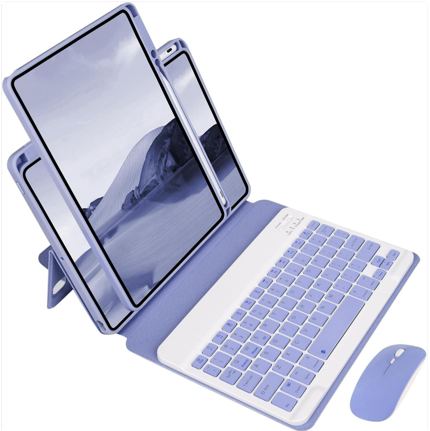
Image: The ZKAI AI 360 Rotating Keyboard Case in violet, showcasing the iPad in a stand, the detachable keyboard, and the accompanying Bluetooth mouse.