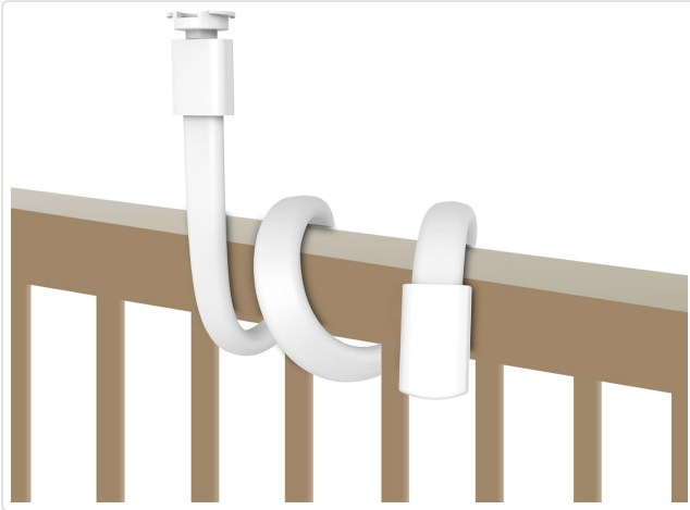
A detailed view of the flexible mount arm, designed to securely attach to various surfaces like crib railings.

The flexible mount allows for versatile placement without tools or wall damage.