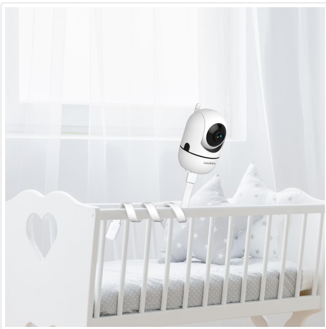
The HelloBaby camera unit securely attached to a crib railing using its flexible mount, providing an overhead view of the crib.