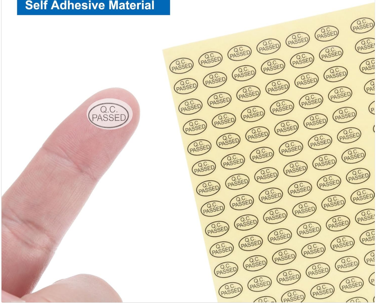
Image: A person's finger gently pressing an oval "Q.C. PASSED" sticker onto a surface, demonstrating the application process.