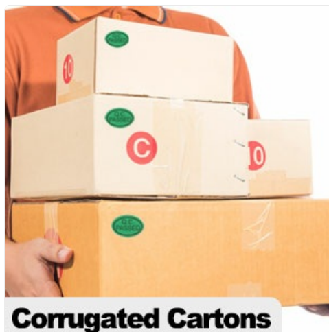
Image: Several cardboard boxes, some held by a person, with green "Q.C. PASSED" stickers clearly visible on their surfaces, indicating successful application.

Great for pasting on any surface of package, corrugated cartons, papers, boxes, glass, plastic, shrink wrap, etc