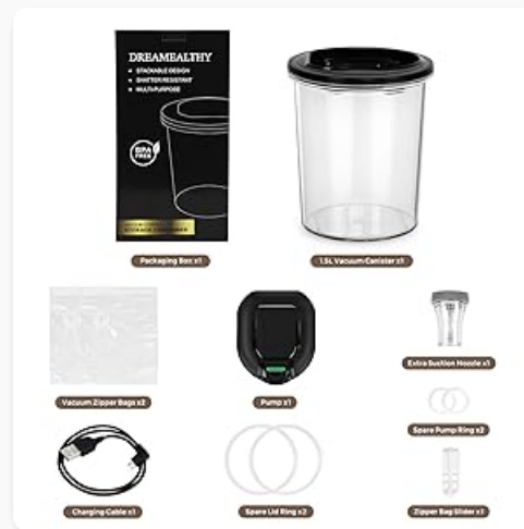
Image 3: Overview of all items included in the DREAMEALTHY vacuum canister set.