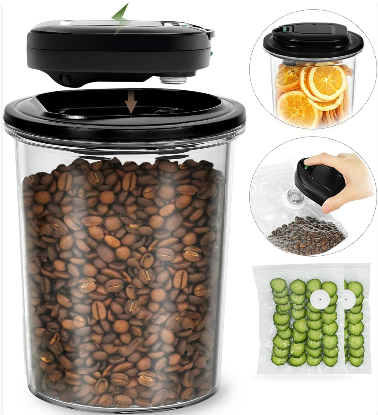
Image 1: The DREAMEALTHY Electric Vacuum Coffee Canister, showcasing its design and included vacuum bags.