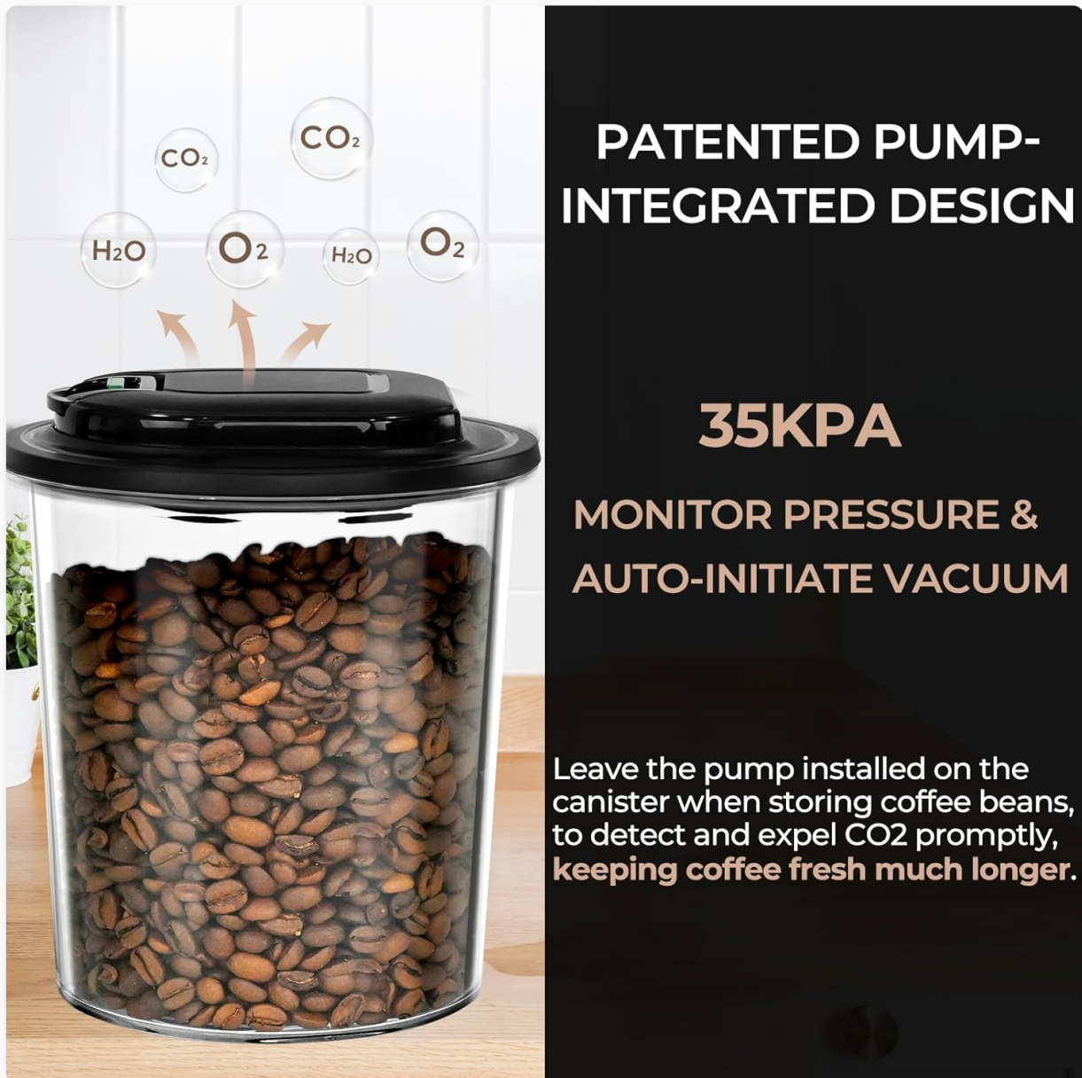
Image 2: Illustration of the patented pump-integrated design monitoring pressure and auto-initiating vacuum to preserve coffee beans.