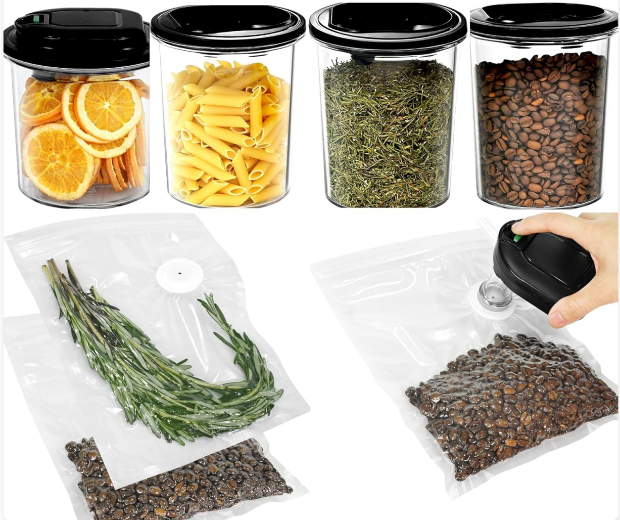
Image 6: The vacuum pump is versatile and can be used with vacuum zipper bags for various food items.