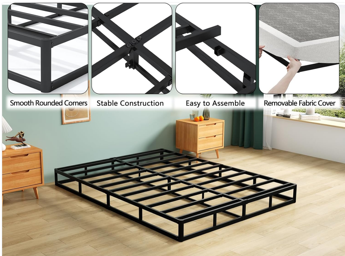
Image: The metal frame of the box spring before the fabric cover is applied, showing its sturdy construction.