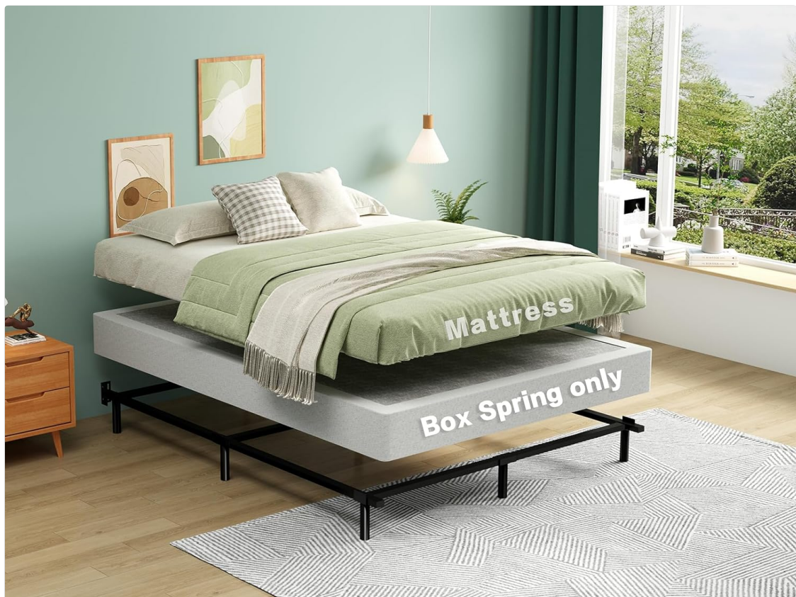
Image: Exploded view demonstrating how the mattress sits on the box spring, which rests on a bed frame.