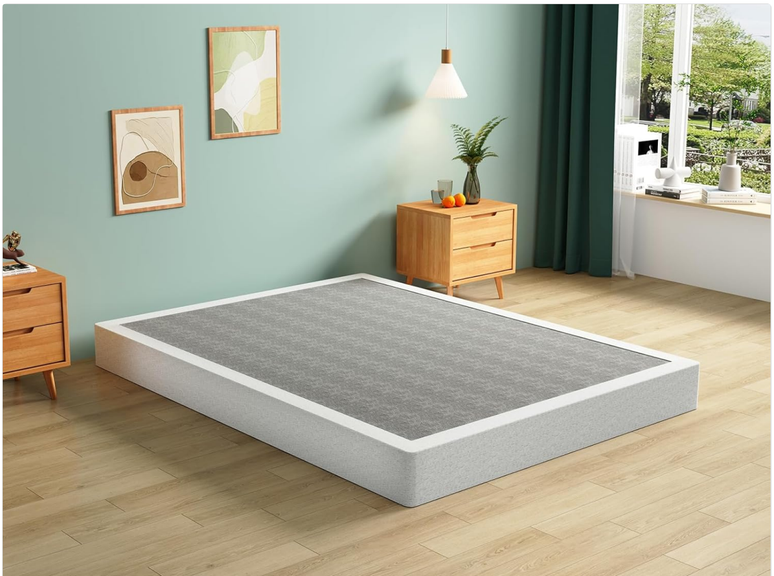
Image: The AROMUSTIME 7 Inch Full Box Spring with its fabric cover installed, showcasing its finished appearance.