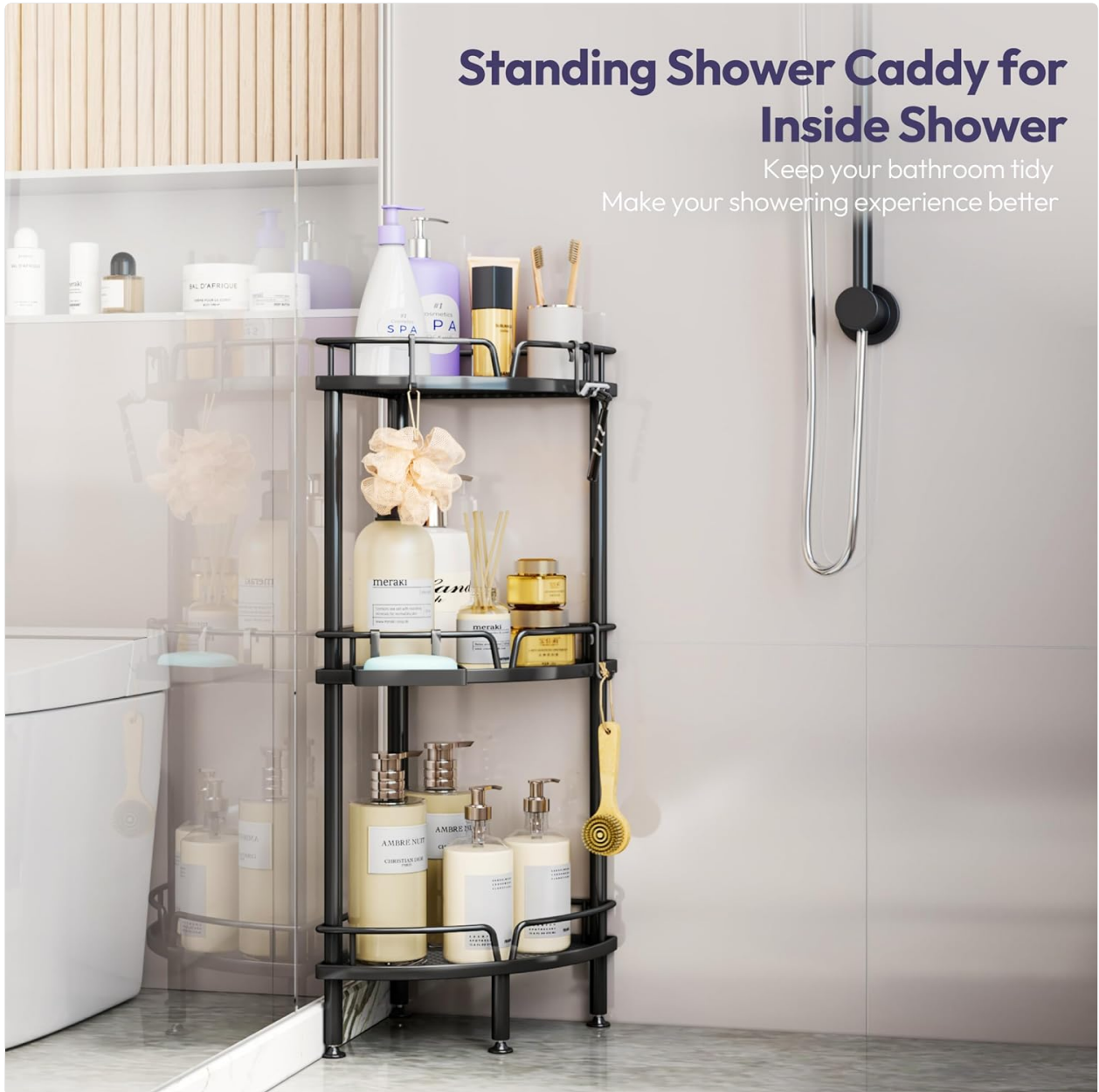
Image: The SWTYMIKI Shower Caddy positioned in a shower corner, ready for use.

Place the assembled shower caddy in your desired corner. Adjust the height of each individual foot by turning it until the caddy is perfectly level and stable. This is crucial for preventing wobbling and ensuring safety.