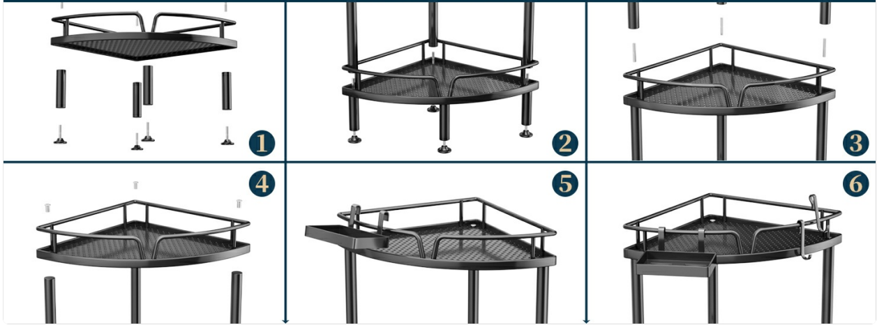
Image: Visual guide for connecting the shelf units with the support rods.