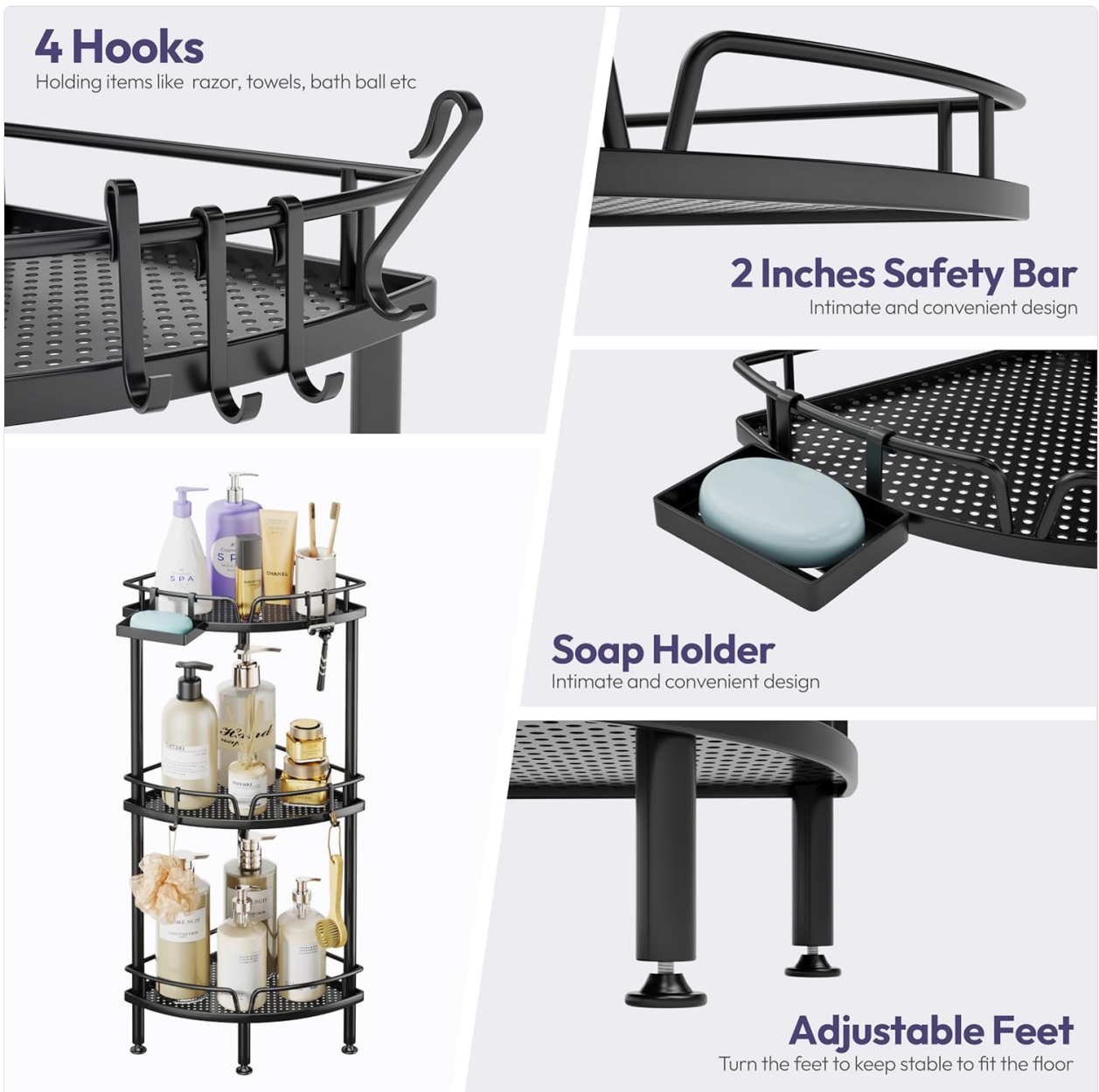
Image: The shower caddy with its hooks and soap holder in place.

Once the main structure is assembled, attach the four hanging hooks to the side rails of the shelves as desired. The soap holder can be hung on any of the side rails for easy access.