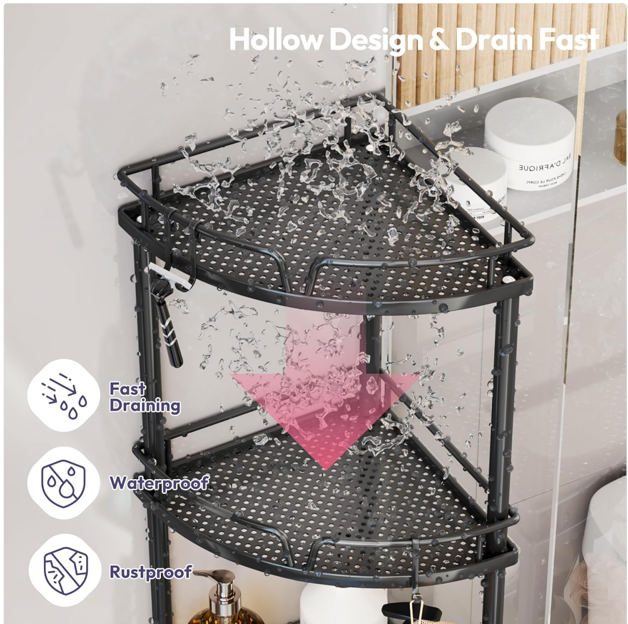
Image: The perforated design of the shelves facilitates quick water drainage, aiding in cleanliness.

Due to its stainless steel construction and hollow design, the caddy is easy to clean. Simply wipe down the shelves and frame with a damp cloth and mild detergent as needed. Rinse thoroughly and dry to prevent water spots.