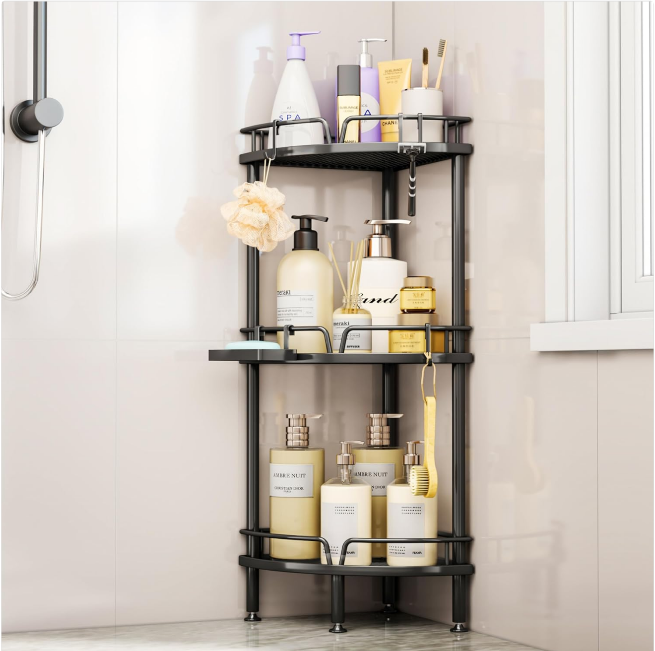
Image: The SWTYMIKI Shower Caddy fully stocked with bath products, demonstrating its storage capacity.