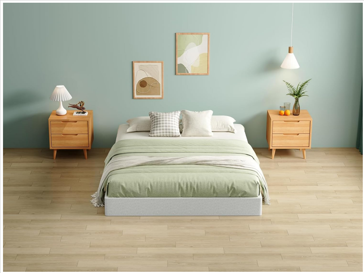
Image: The AROMUSTIME box spring with a mattress and bedding, ready for use.