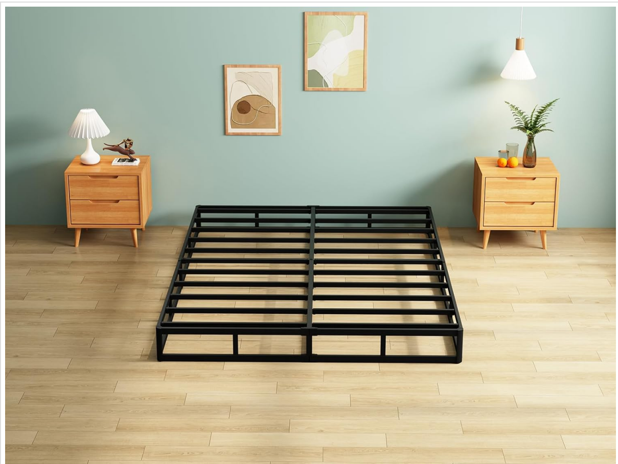
Image: The fully assembled metal frame of the box spring before the fabric cover is applied.