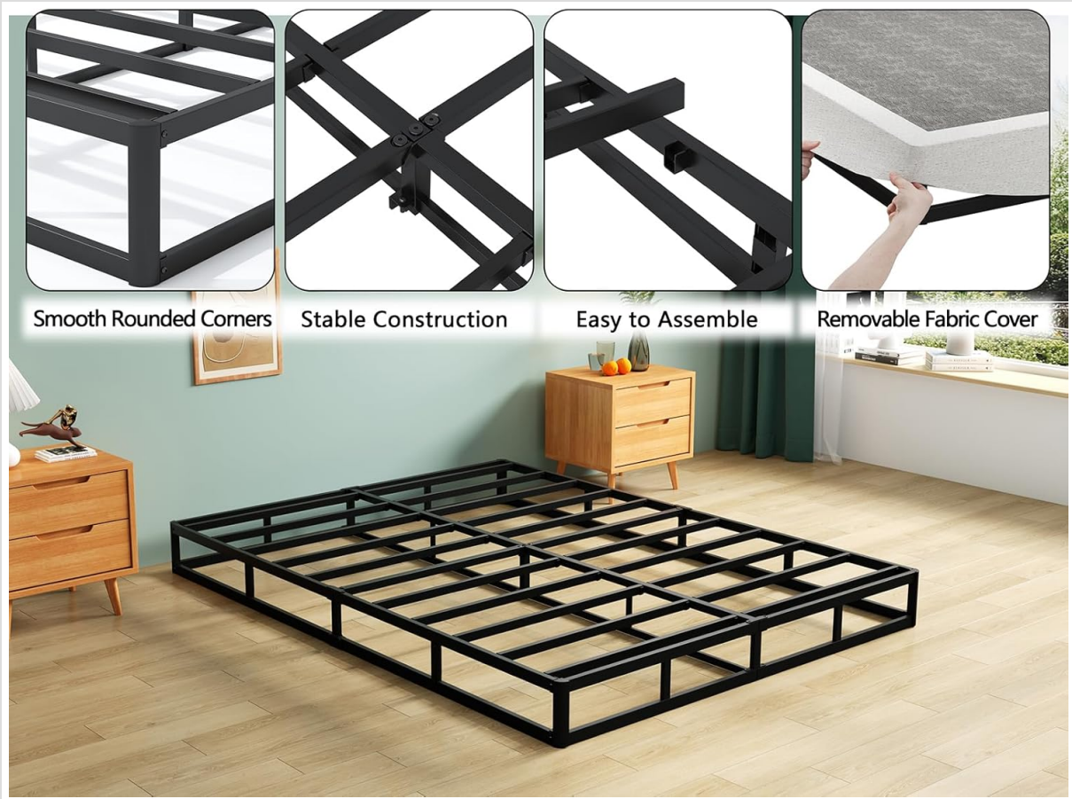
Image: Close-up views of smooth rounded corners, stable construction, easy assembly points, and the removable fabric cover.