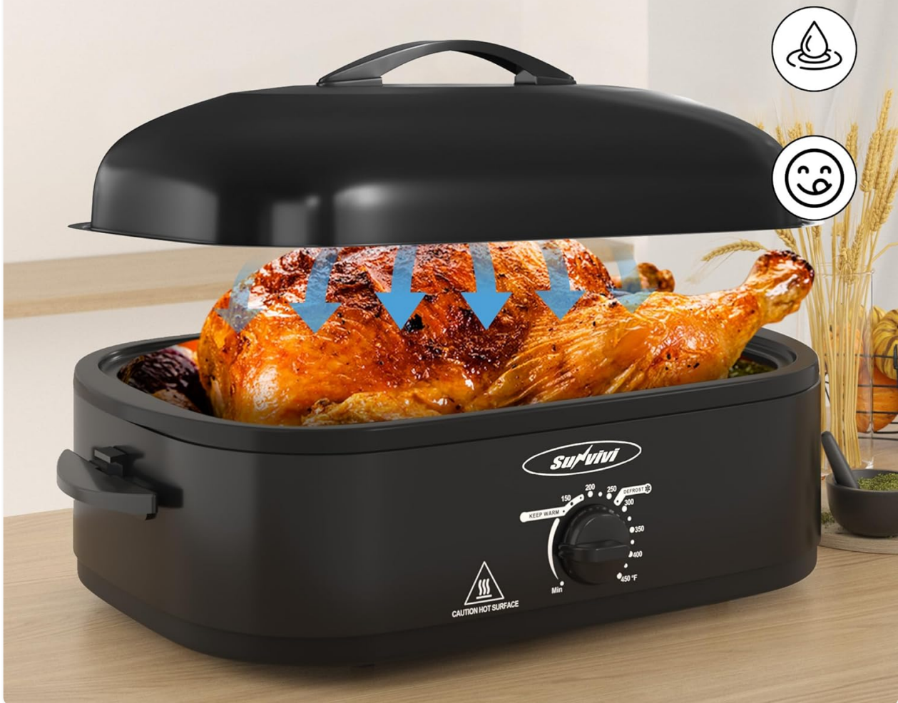
Figure 5: The self-basting lid ensures even moisture distribution during cooking.