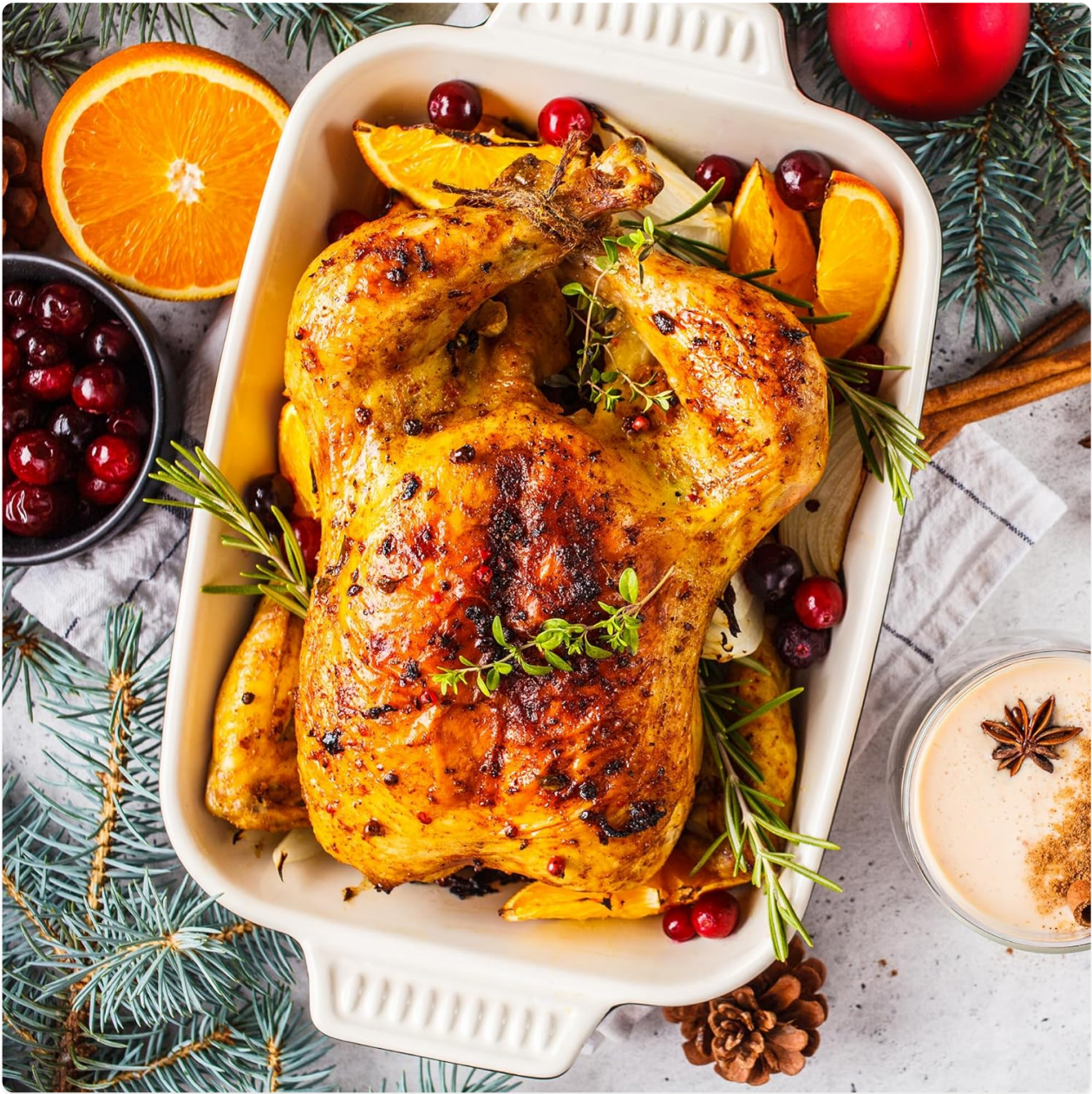
Figure 3: Example of a roasted chicken prepared in the roaster oven.