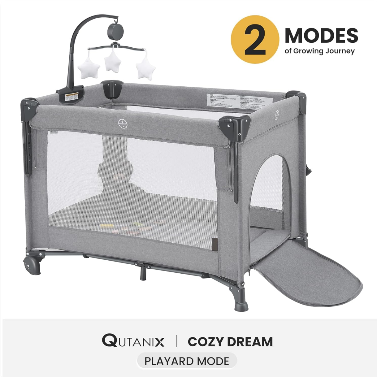
Figure 6: The playard mode, suitable for toddlers, featuring a zipped game entrance.