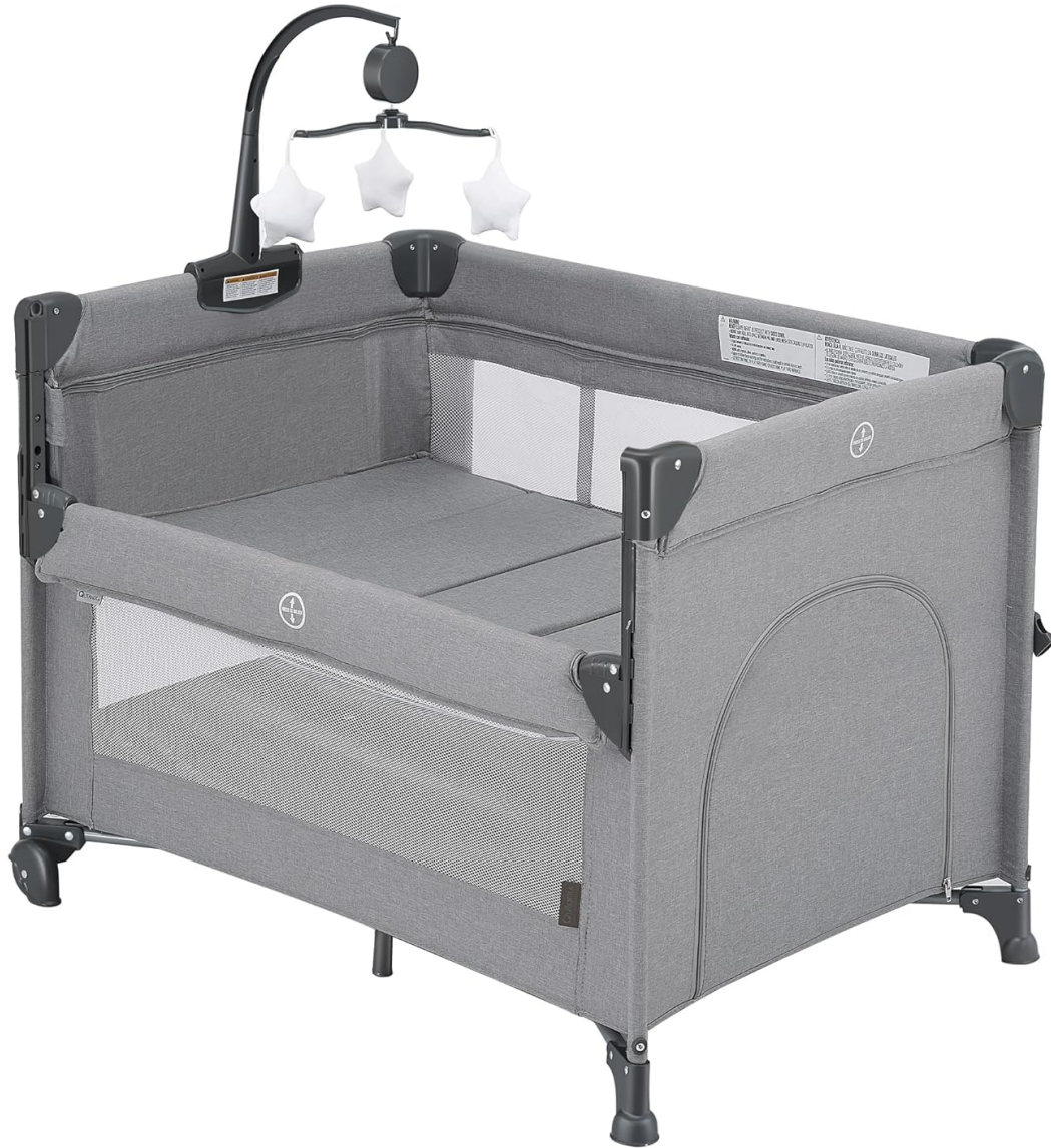
Figure 1: The QUTANIX 2-in-1 Baby Playard and Bassinet in its assembled form.