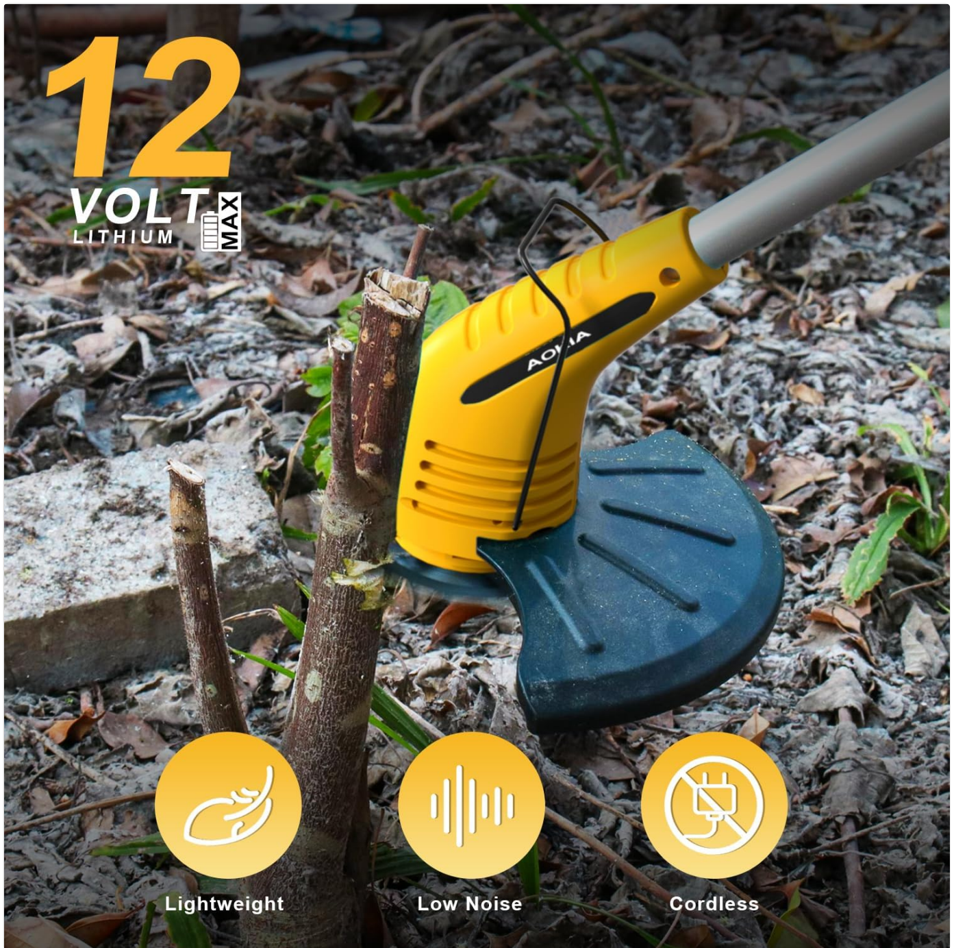
Image 6.2.2: Highlights the key operational benefits: lightweight design for easy handling, low noise output for quieter operation, and cordless functionality for unrestricted movement.