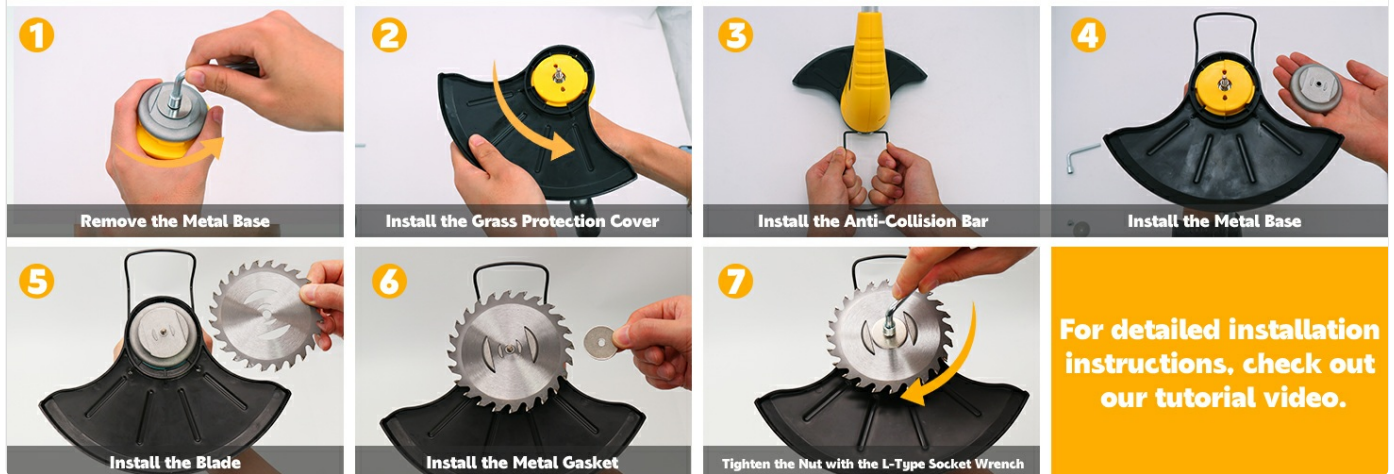
Image 4.2.2: Step-by-step visual guide for installing the cutting blade on the weed wacker. It shows removing the metal base, installing the grass protection cover, attaching the anti-collision bar, reinstalling the metal base, placing the blade and iron piece, and finally tightening the nut with the L-type socket wrench.