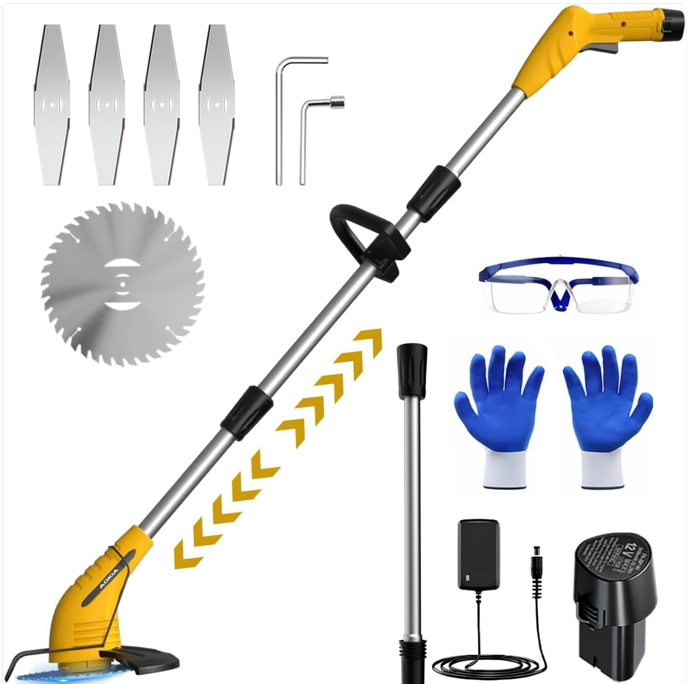
Image 3.1: Contents of the Aokia Cordless Weed Wacker package. This image displays the main weed wacker unit, various cutting blades (metal and circular saw blade), two wrenches for assembly, safety glasses, a pair of protective gloves, the battery charger, and a 12V lithium-ion battery.