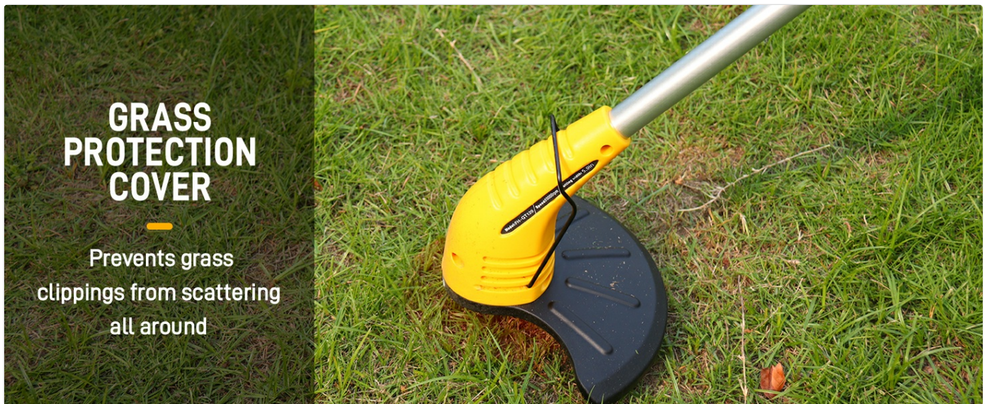
Image 4.1.1: The grass protection cover, designed to prevent clippings from scattering during operation.