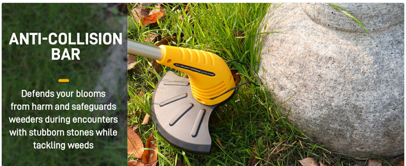
Image 4.1.2: The anti-collision bar, which protects plants and the weed wacker from damage during use.

Securely attach the grass protection cover and the anti-collision bar to the trimmer head. These components are crucial for user safety and protecting the device and surrounding plants.