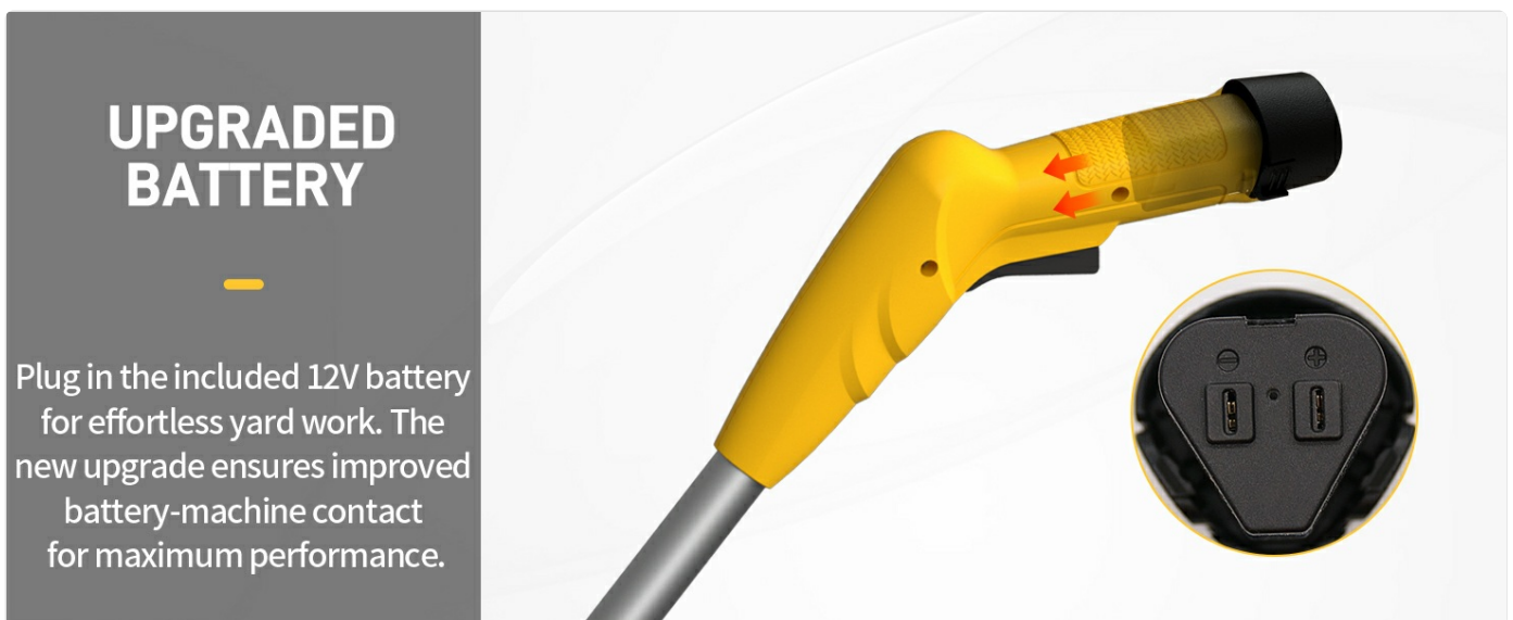
Image 5.2.1: Illustration showing the insertion point for the 12V battery into the weed wacker handle. The upgraded design ensures improved battery-machine contact for maximum performance.

Align the battery with the battery slot at the base of the handle and slide it in until it clicks securely into place. Ensure the battery is fully seated before operation. To remove, press the release button (if present) and slide the battery out.