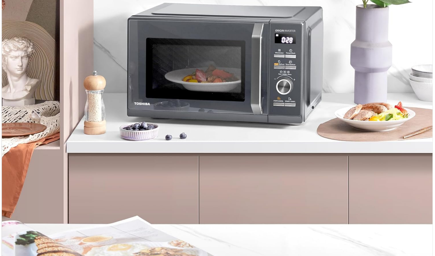
Figure 3: Key Features of the Microwave Oven.