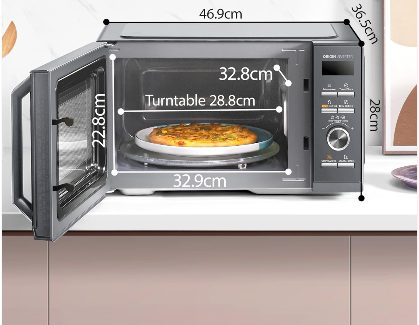
Figure 7: 900W Power Output.

25L capacity with a 288mm glass turntable.