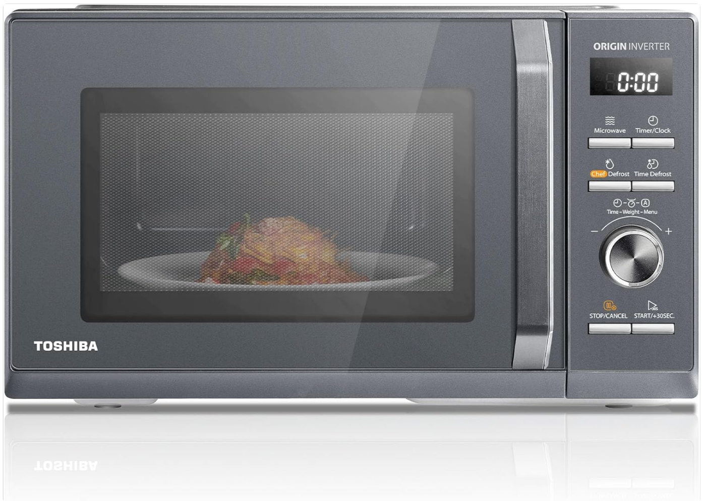
Figure 2: Toshiba 25L 900W Microwave Oven.