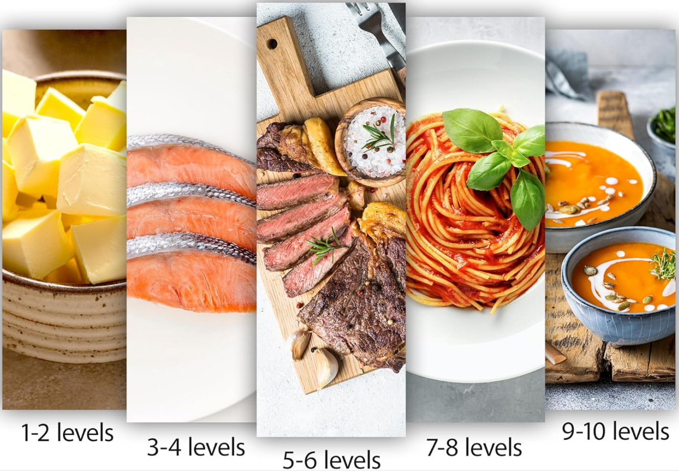
Figure 4: Recommended Power Levels for Various Dishes.

Meeting your daily cooking requirements from defrost to reheat to boil.