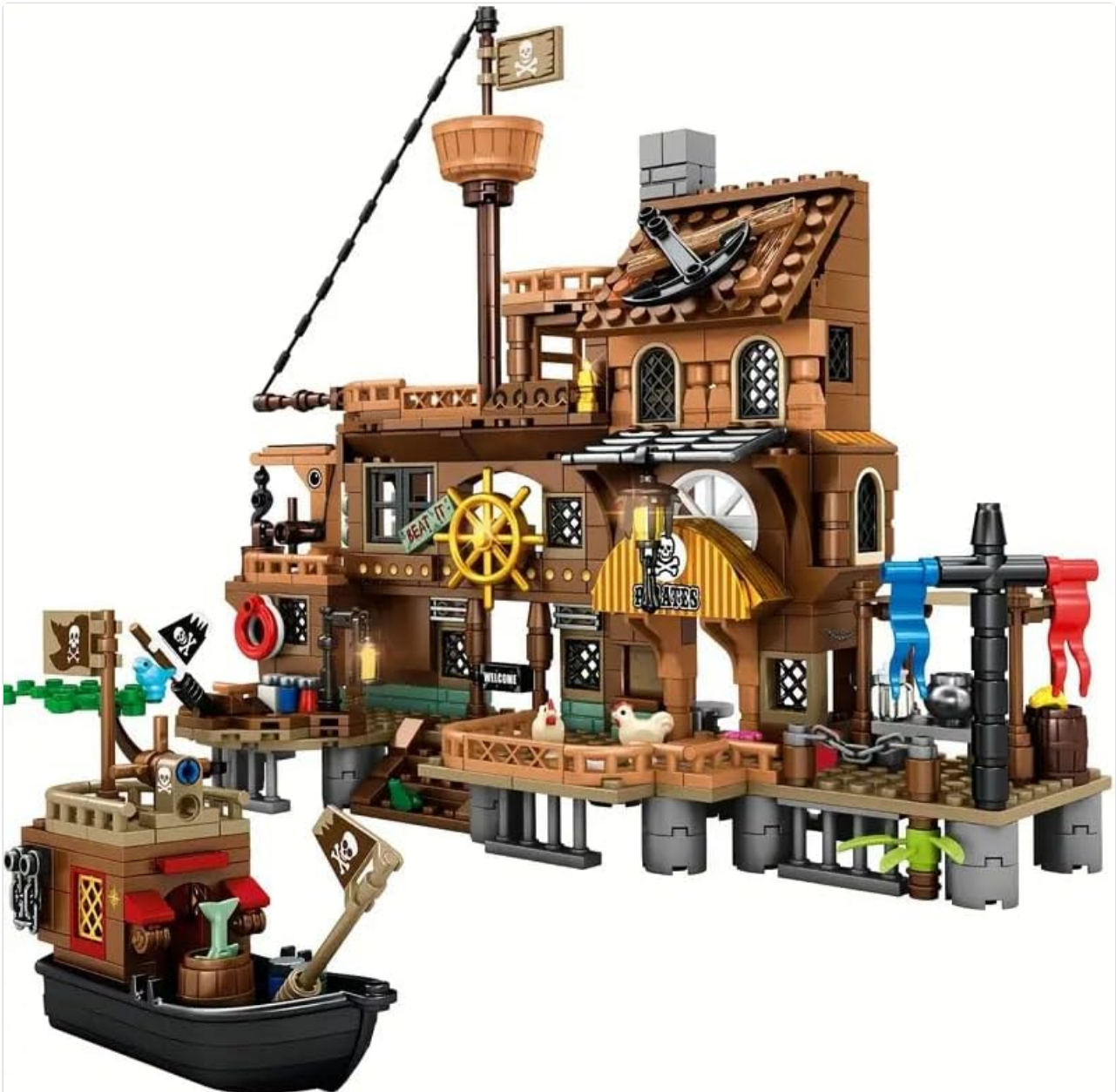
Figure 4.1: The fully assembled Medieval Pirate's Island House and Pirate Ship.

Proceed through the instruction manual page by page, carefully following the visual diagrams. Each step will guide you in connecting the blocks to form the Medieval Pirate's Island House and the accompanying Pirate Ship. Pay close attention to the orientation of pieces and the number of studs required for each connection.