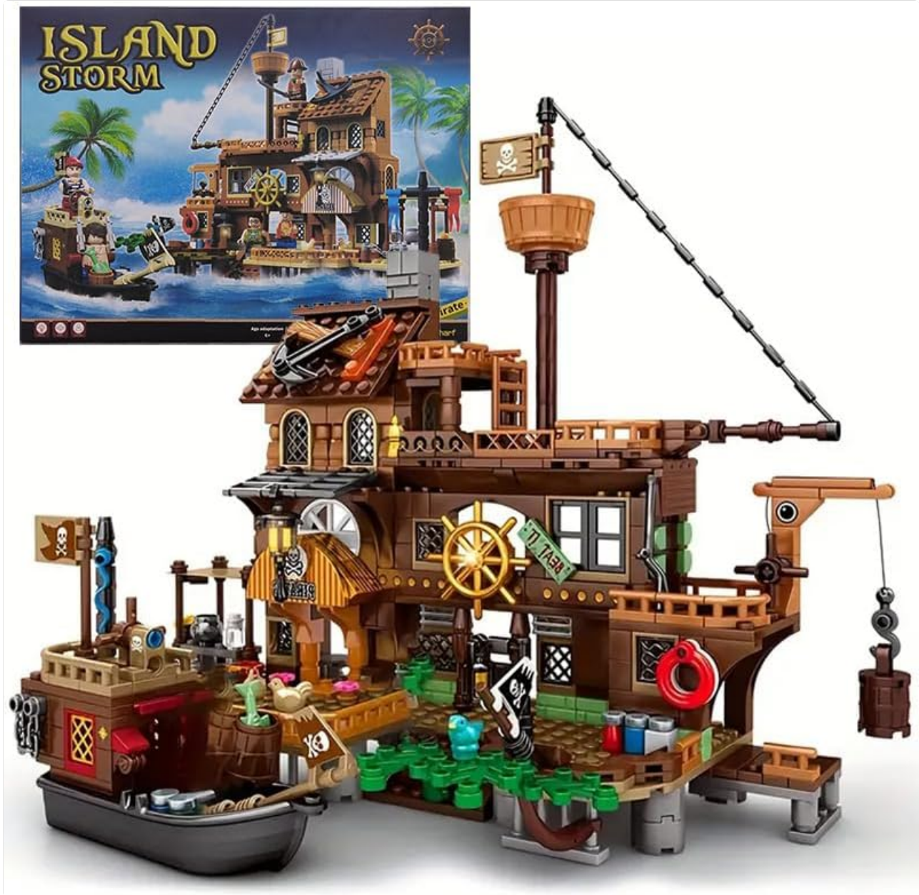
Figure 1.1: The Bibilock Island Storm Building Blocks Set, showing the product packaging and the assembled model.