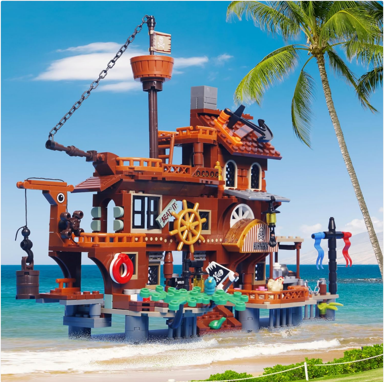
Figure 5.1: The assembled set in an imaginative play setting.