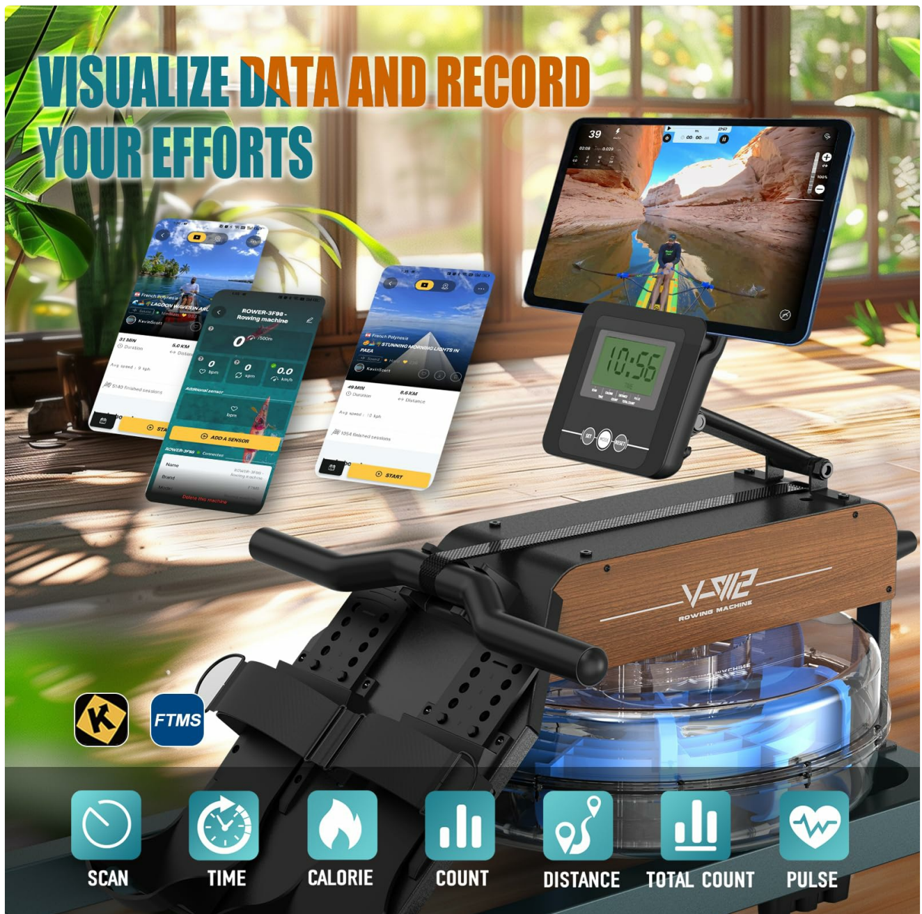
Figure 5: The VOWVIT V-W2's monitor and tablet integration, showcasing data visualization and app connectivity.