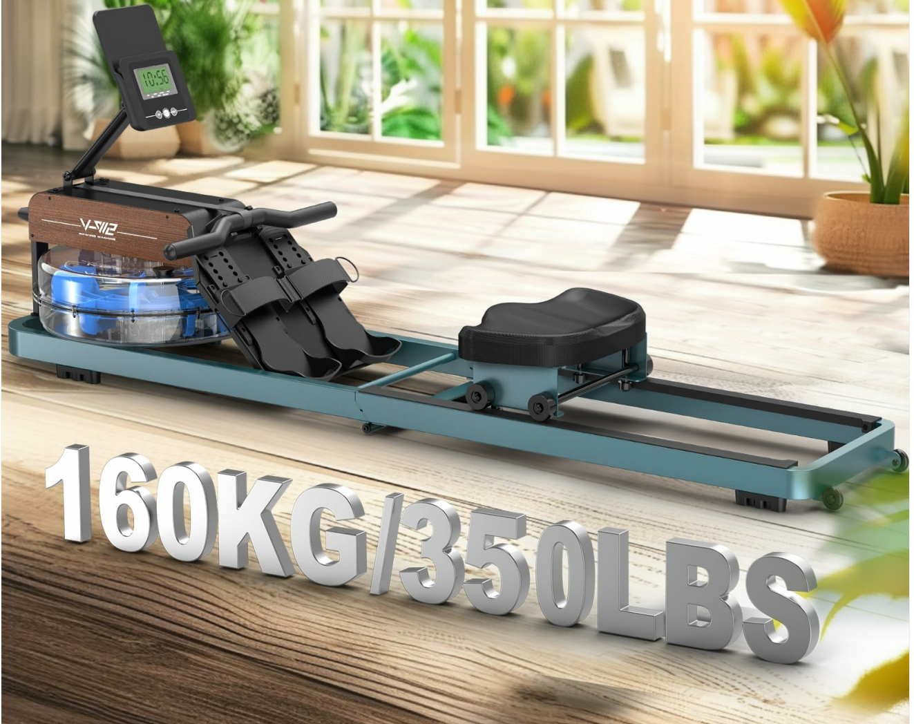
Figure 7: The VOWIT V-W2 Water Rower's durable construction, built to withstand rigorous use.