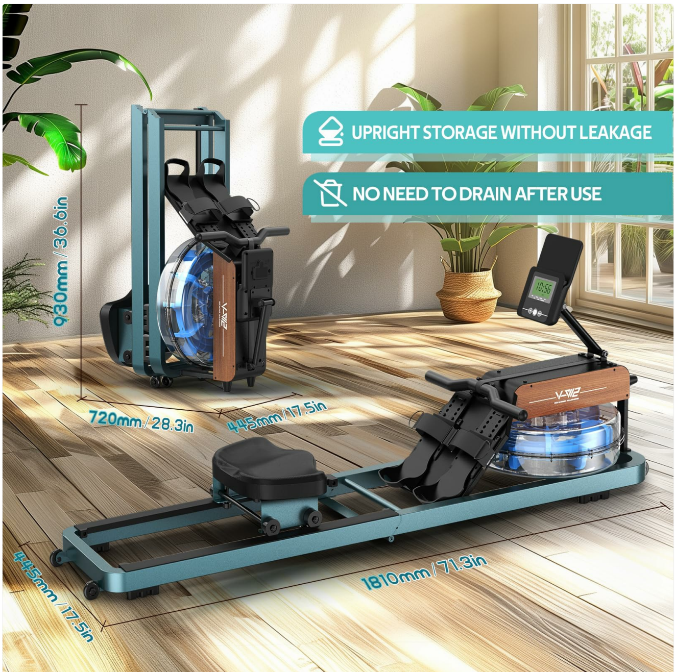
Figure 2: The VOWVIT V-W2 Water Rower components, highlighting its 95% pre-assembly for quick setup.