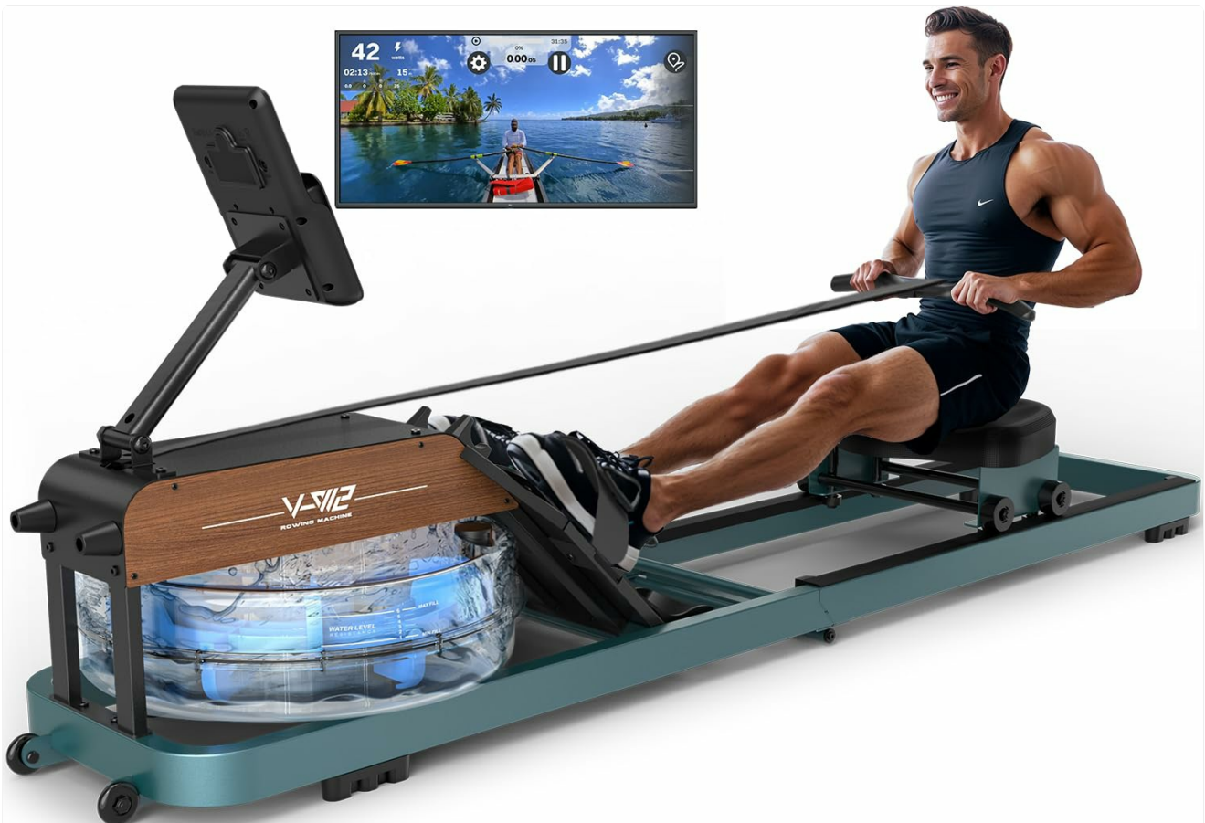
Figure 1: VOWVIT V-W2 Water Rower in action, demonstrating its interactive display capabilities.

Thank you for choosing the VOWVIT V-W2 Water Rower. This manual provides essential information for the safe and effective use of your new fitness equipment. Please read it thoroughly before assembly and operation to ensure optimal performance and longevity of your rower.