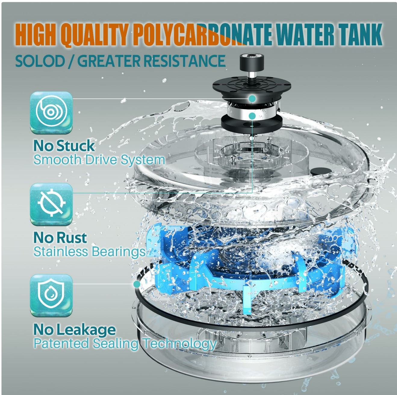
Figure 3: Detailed view of the high-quality polycarbonate water tank, emphasizing its robust and leak-proof design.