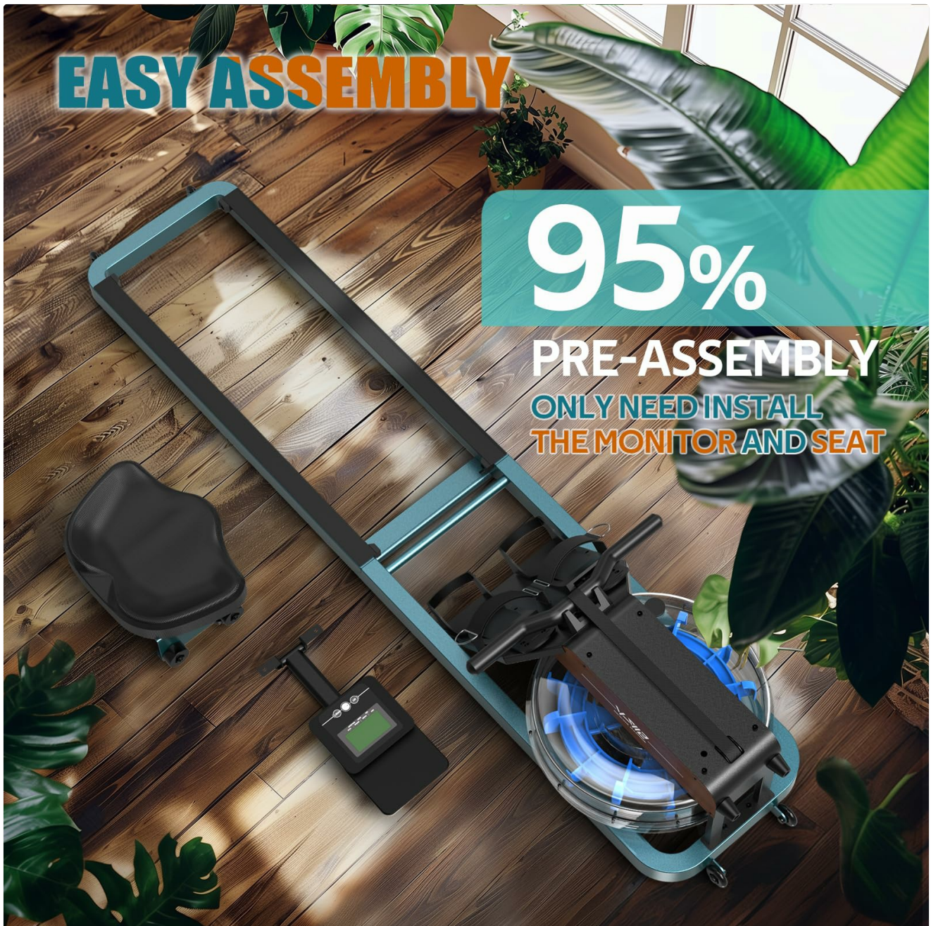
Figure 4: The VOWVIT V-W2's ergonomic seat, designed for optimal comfort and support during workouts.