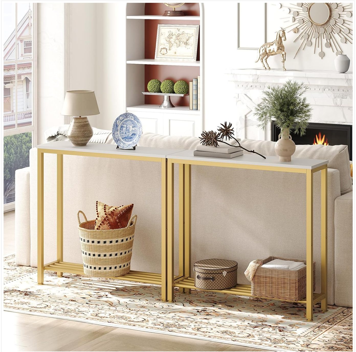
Figure 2: Console table positioned behind a sofa, showcasing its narrow design.