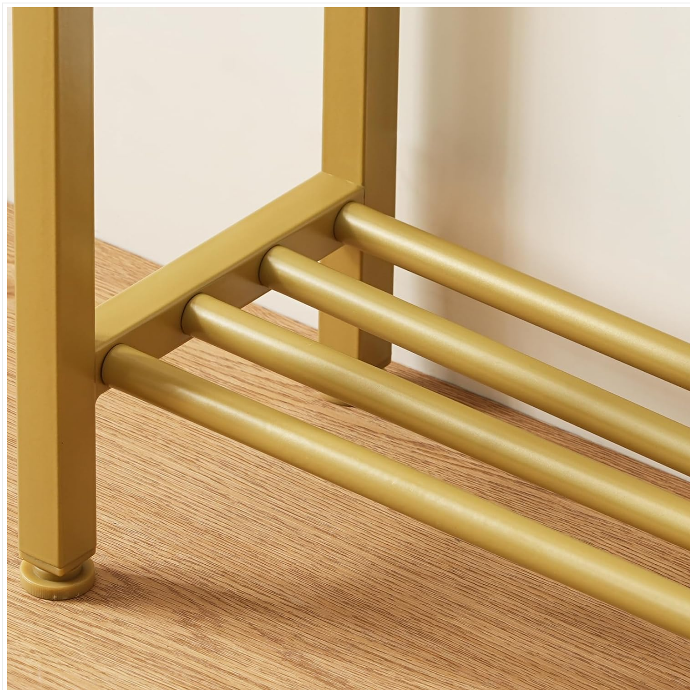
Figure 3: Console table used in an entryway, demonstrating its functional and decorative potential.

Video 1: Official product video demonstrating the YATINEY Narrow Console Table in various settings.