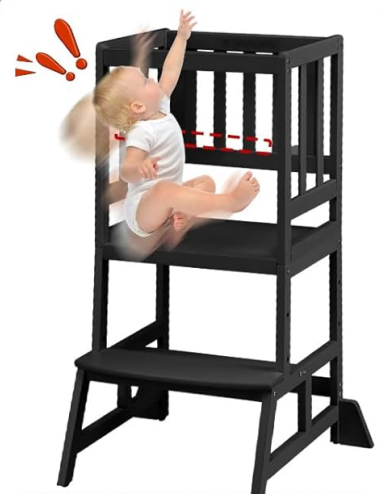
Without Anti-Drop Rolling Rail

The removable anti-drop bar allows for easy entry and exit while maintaining a secure environment for your child.