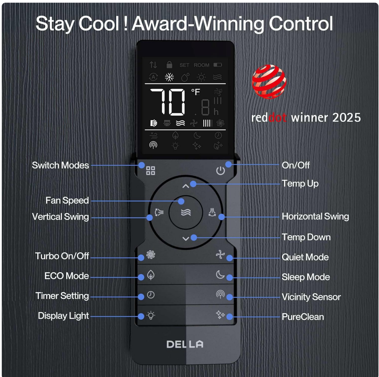
Detailed view of the Della mini split remote control with labeled buttons for various functions like mode, fan speed, swing, timer, and sleep.