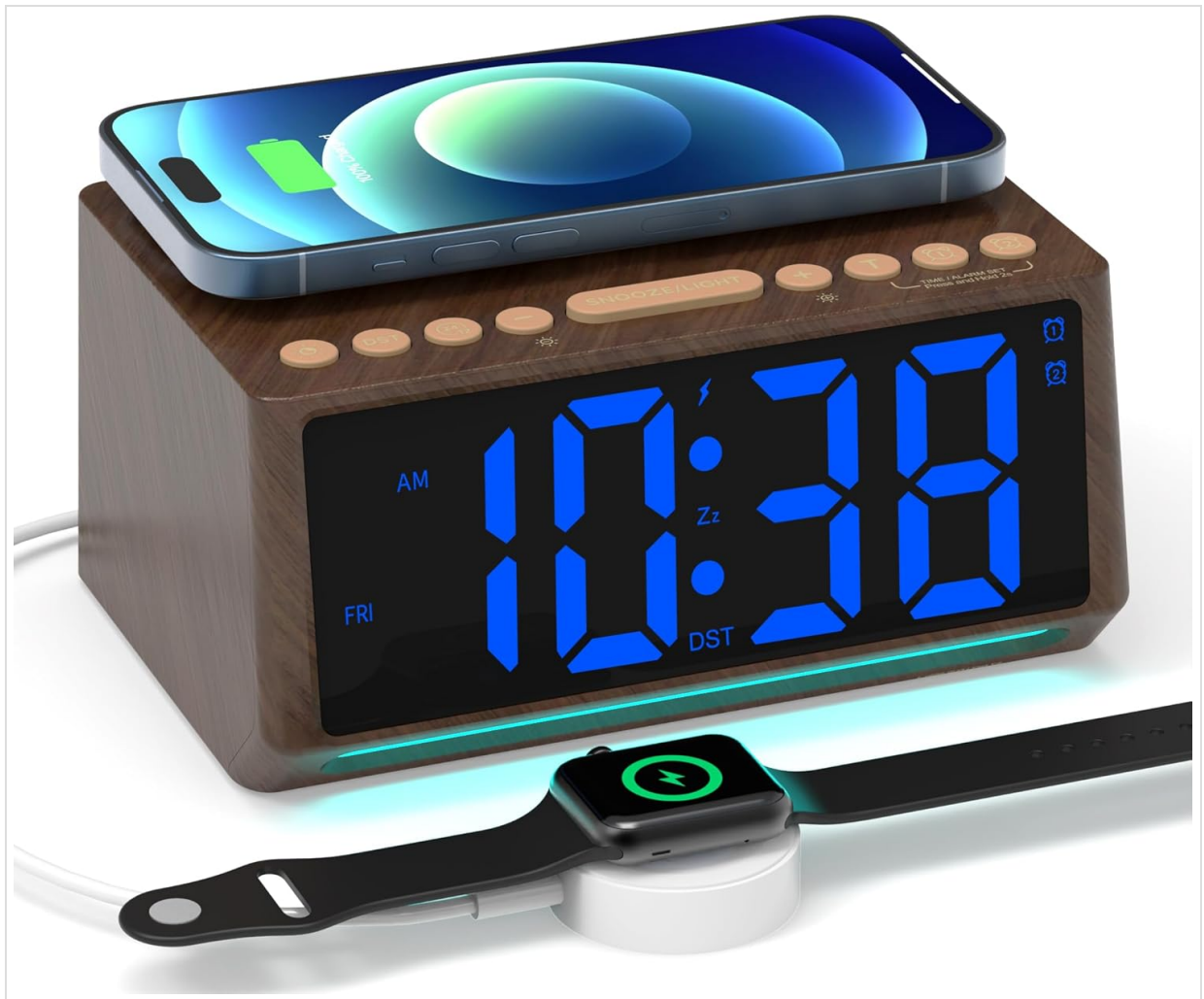
Image: Front view of the Te-Rich Retro Digital Alarm Clock displaying time with a phone on its wireless charging pad.