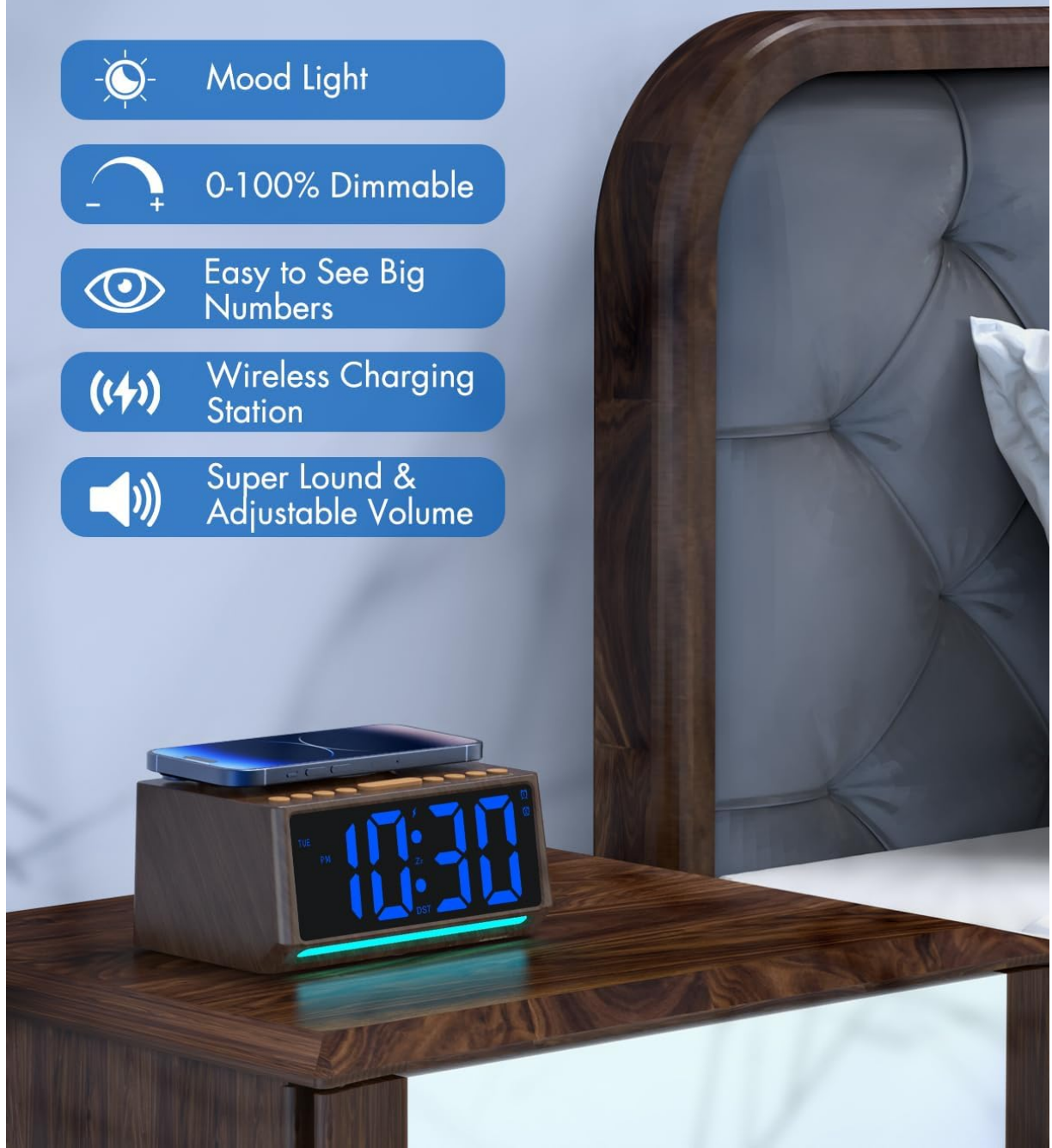
Image: The alarm clock on a nightstand, showcasing its design and charging capabilities.