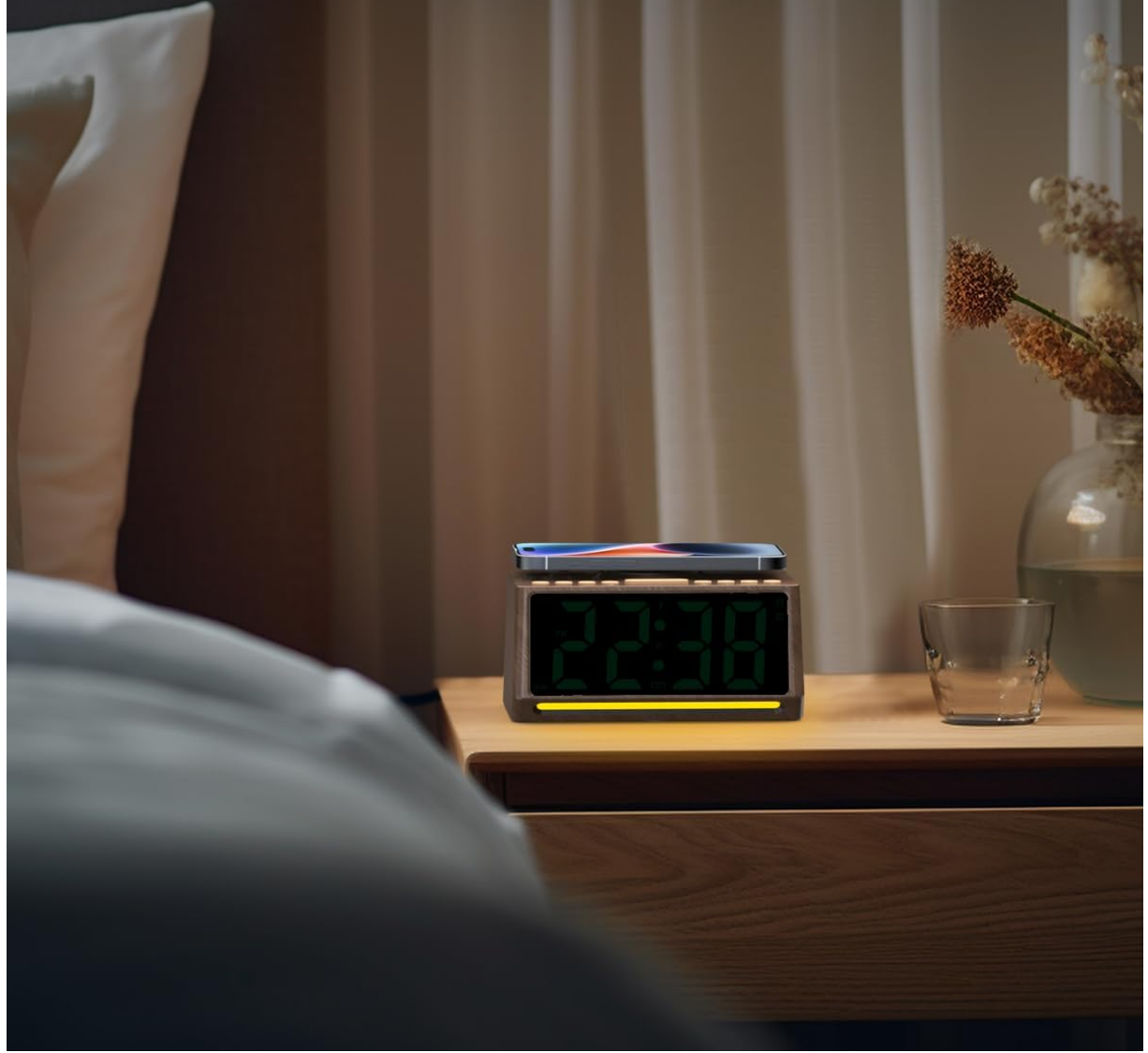
Image: Visual representation of the alarm clock's dimmable display feature.