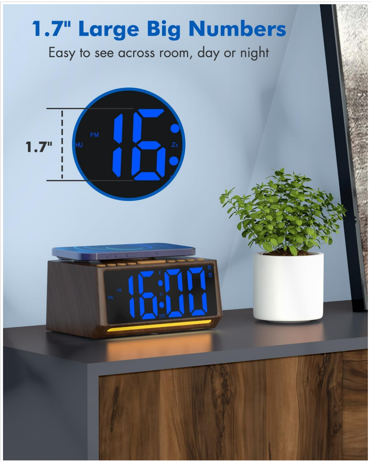
Image: Close-up of the alarm clock showing a smartphone wirelessly charging on its top surface.