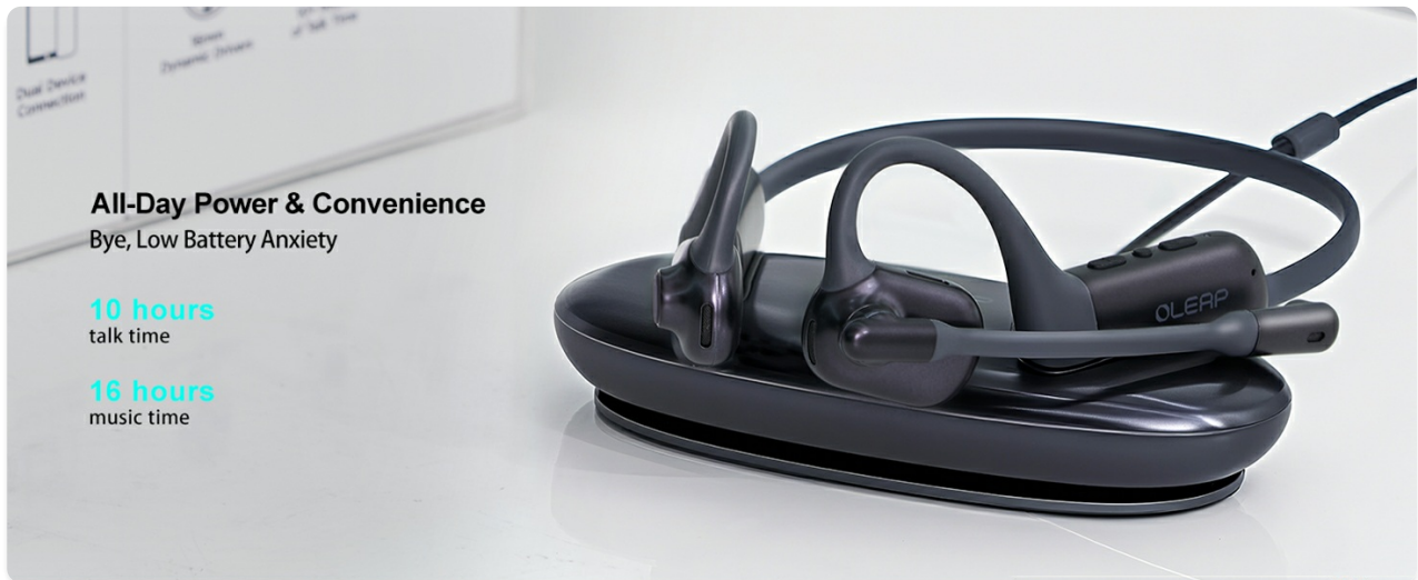
Figure 8.1: Oleap Service Support Details.

The oleap team is available 24/7 to provide support and ensure a high-quality communication experience.