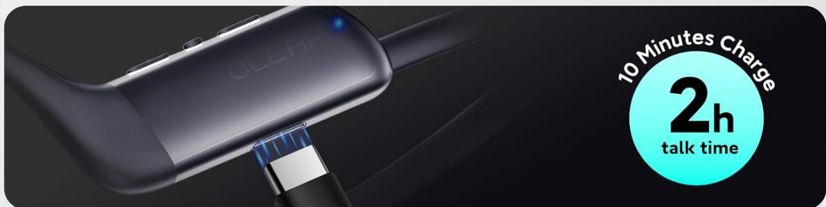
Figure 3.1: Charging the Pilot P200b Pro Headset.

Ensure the headset is adequately charged for uninterrupted use. A full charge provides up to 10 hours of talk time and 16 hours of playback.