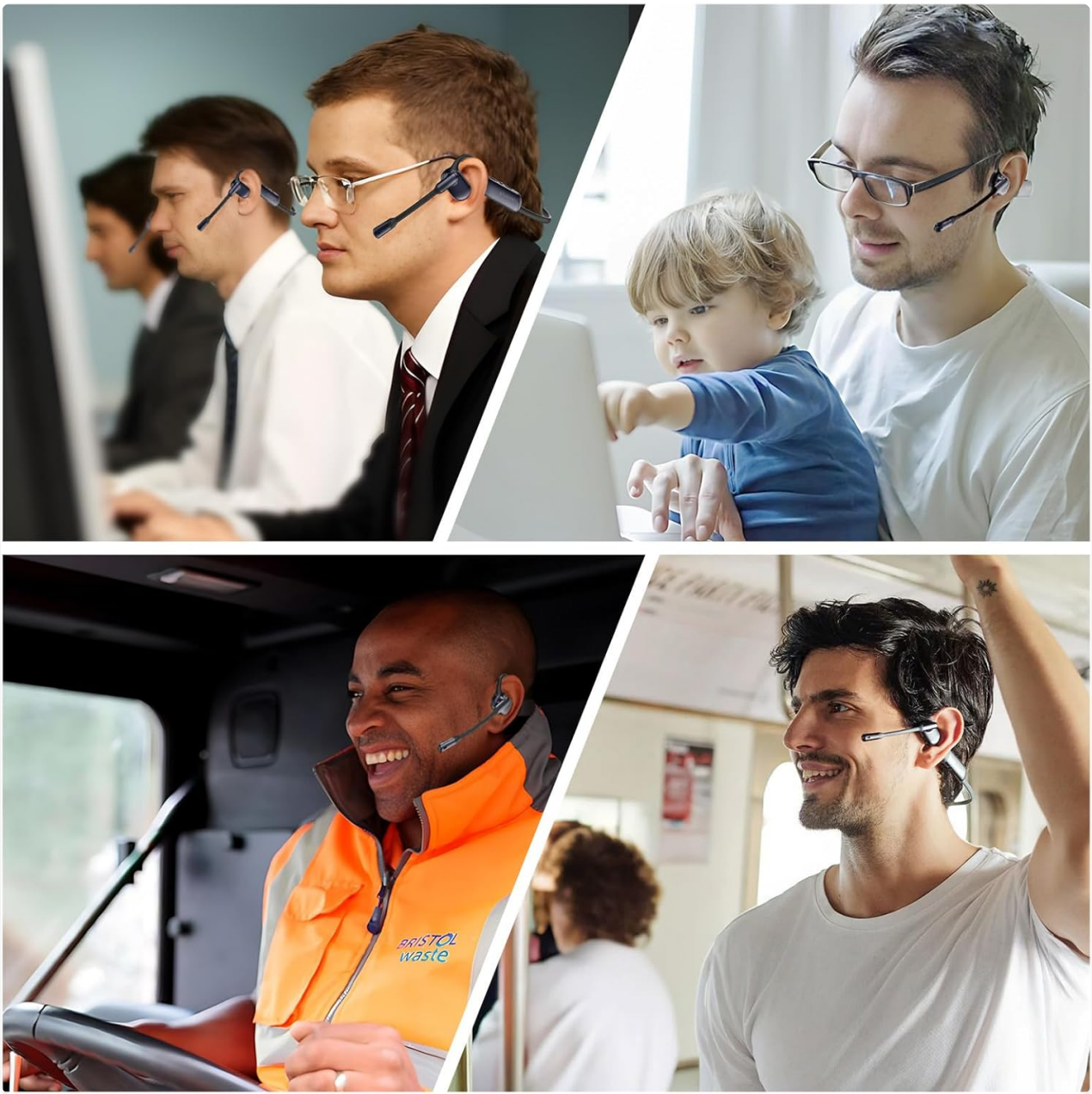
Figure 4.2: Headset in Use Across Different Environments.

The controls are designed for easy access and seamless management of calls and audio playback.