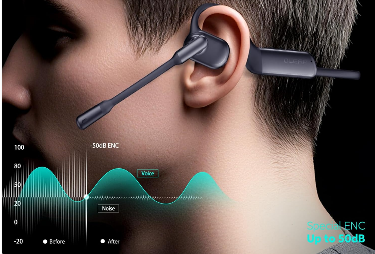
Figure 4.1: Proper Headset Placement for Optimal Performance.

OLEAP VoiceOn™ ENC cancels 50dB of noise. Your voice, crystal clear, anywhere.