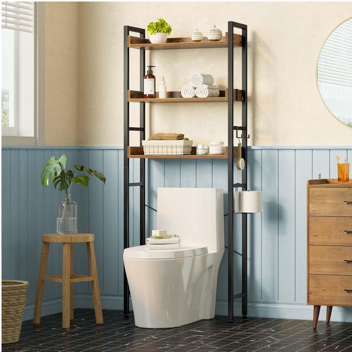
Image: The Rolanstar 3-Tier Over-the-Toilet Storage Rack installed over a toilet.