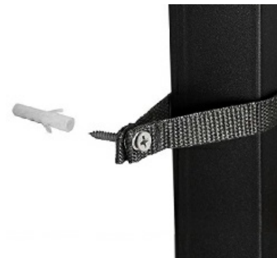
Image: Detail of the anti-tip kit for wall attachment.

Important Safety Information: Always secure the cabinet to the wall using the provided anti-tip kit to prevent tipping. Be cautious when assembling, moving, or installing the cabinet due to its weight and size. Always follow the assembly instructions carefully to ensure safety. Keep small parts away from children during assembly.