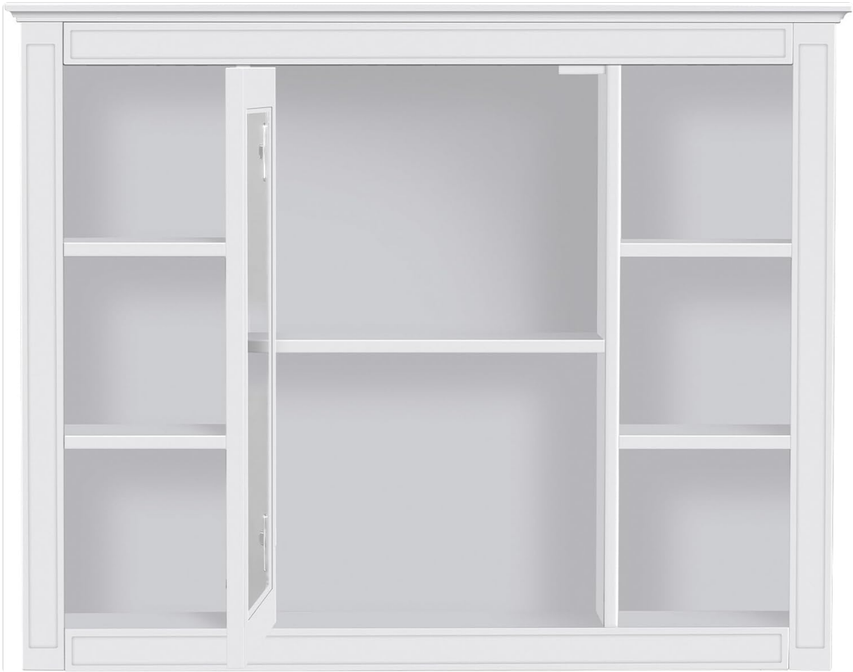
Figure 2: Cabinet interior with shelves visible.