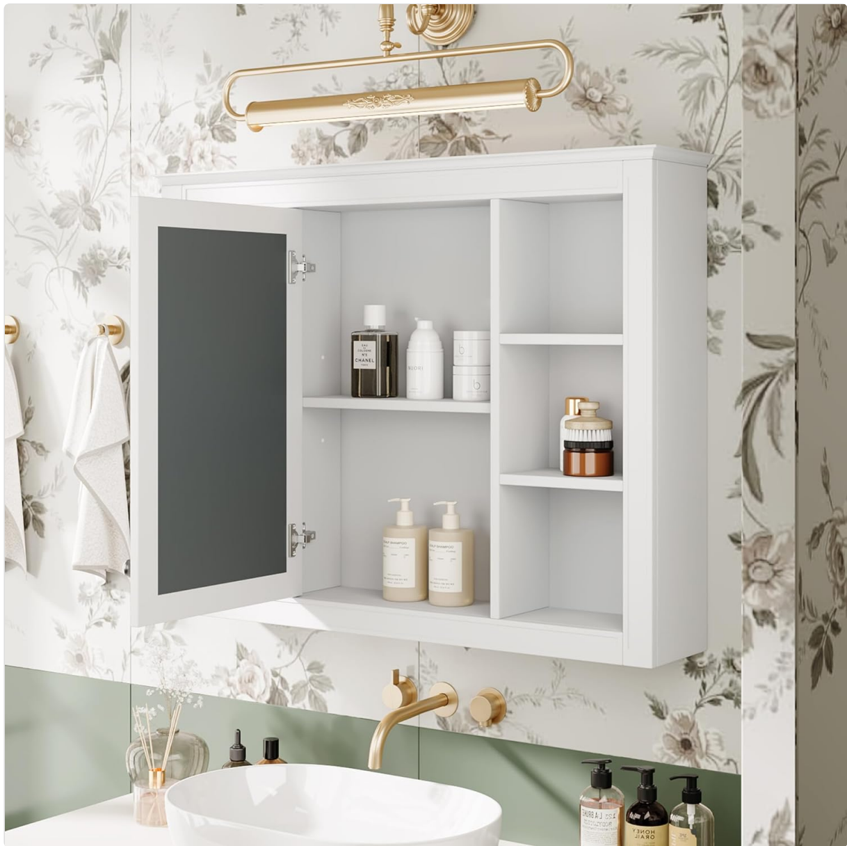
Figure 5: Cabinet with door open, demonstrating storage capacity.