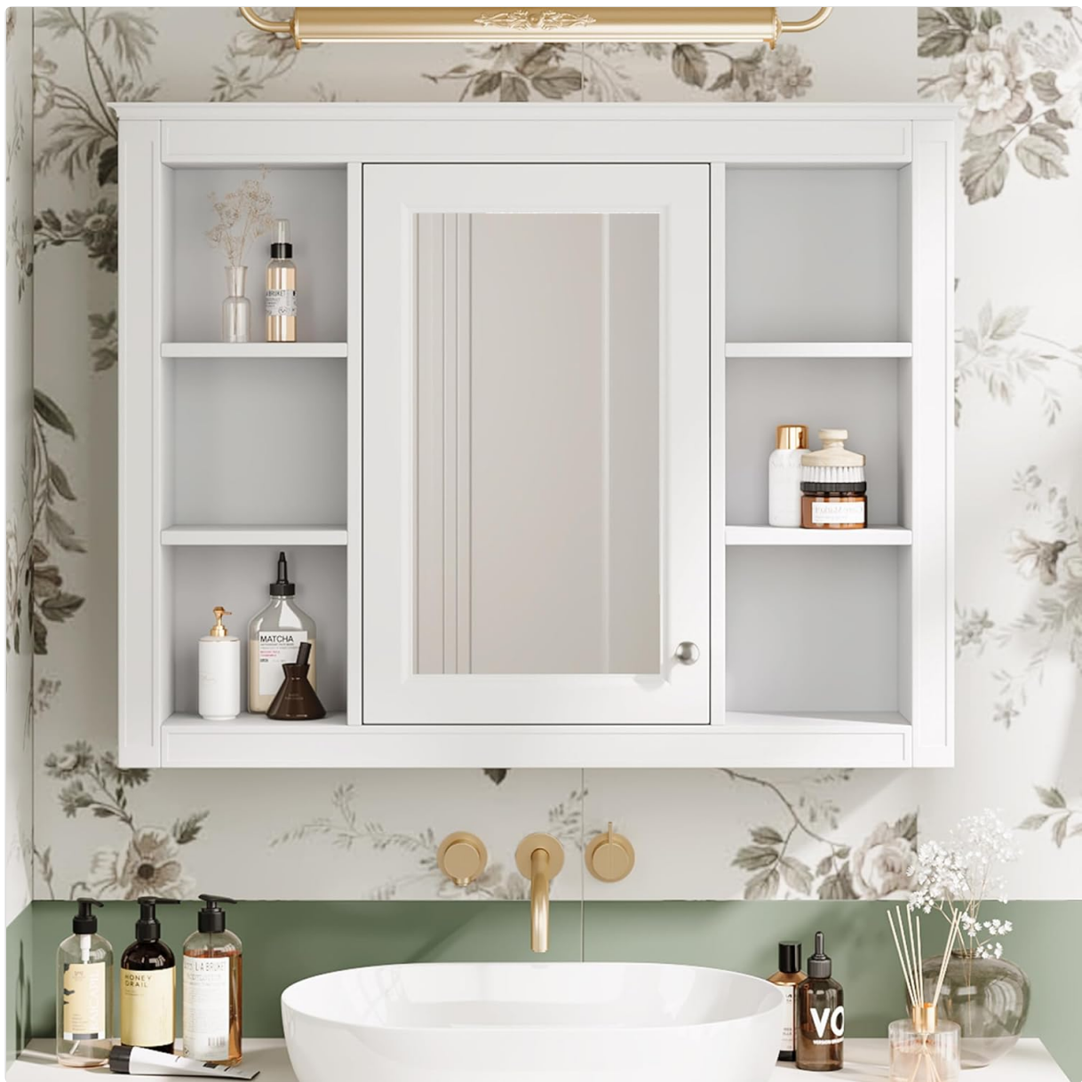
Figure 1: Merax Bathroom Medicine Cabinet (Model SJ-71) installed.