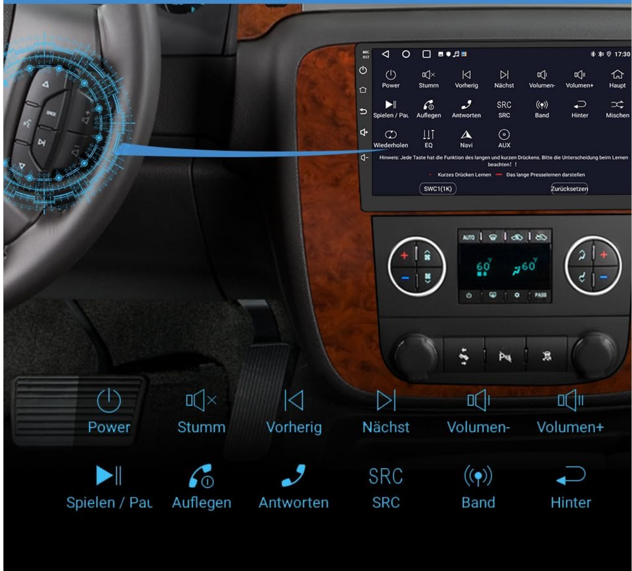
Image: The car stereo display showing the steering wheel control mapping interface, with various button functions highlighted.