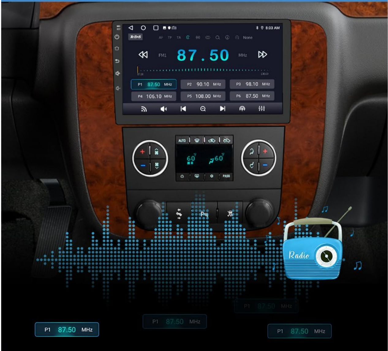
Image: The car stereo display showing the FM radio interface with frequency selection and audio wave visualization.