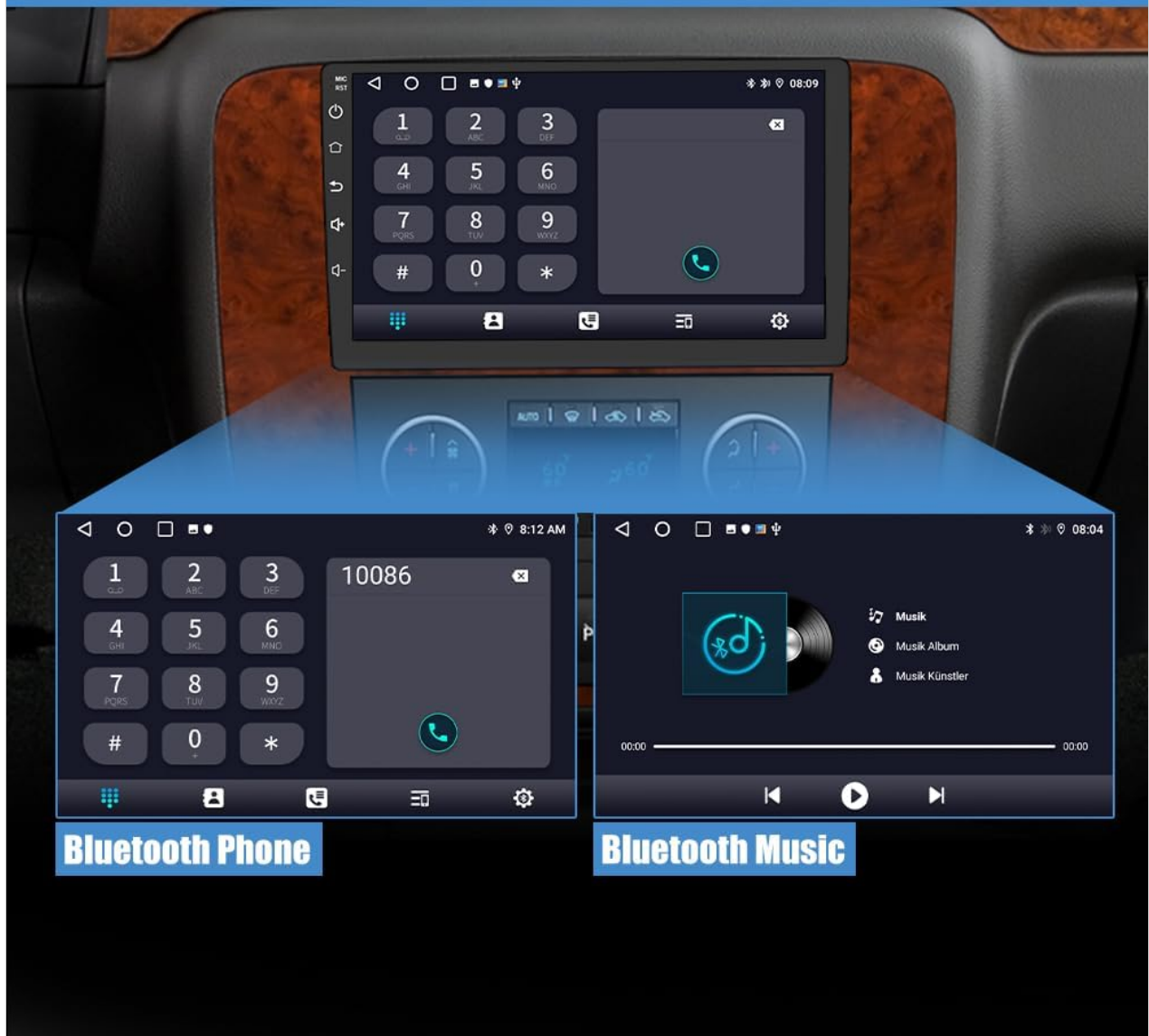
Image: The car stereo display showing Bluetooth phone dialer and Bluetooth music playback interfaces.