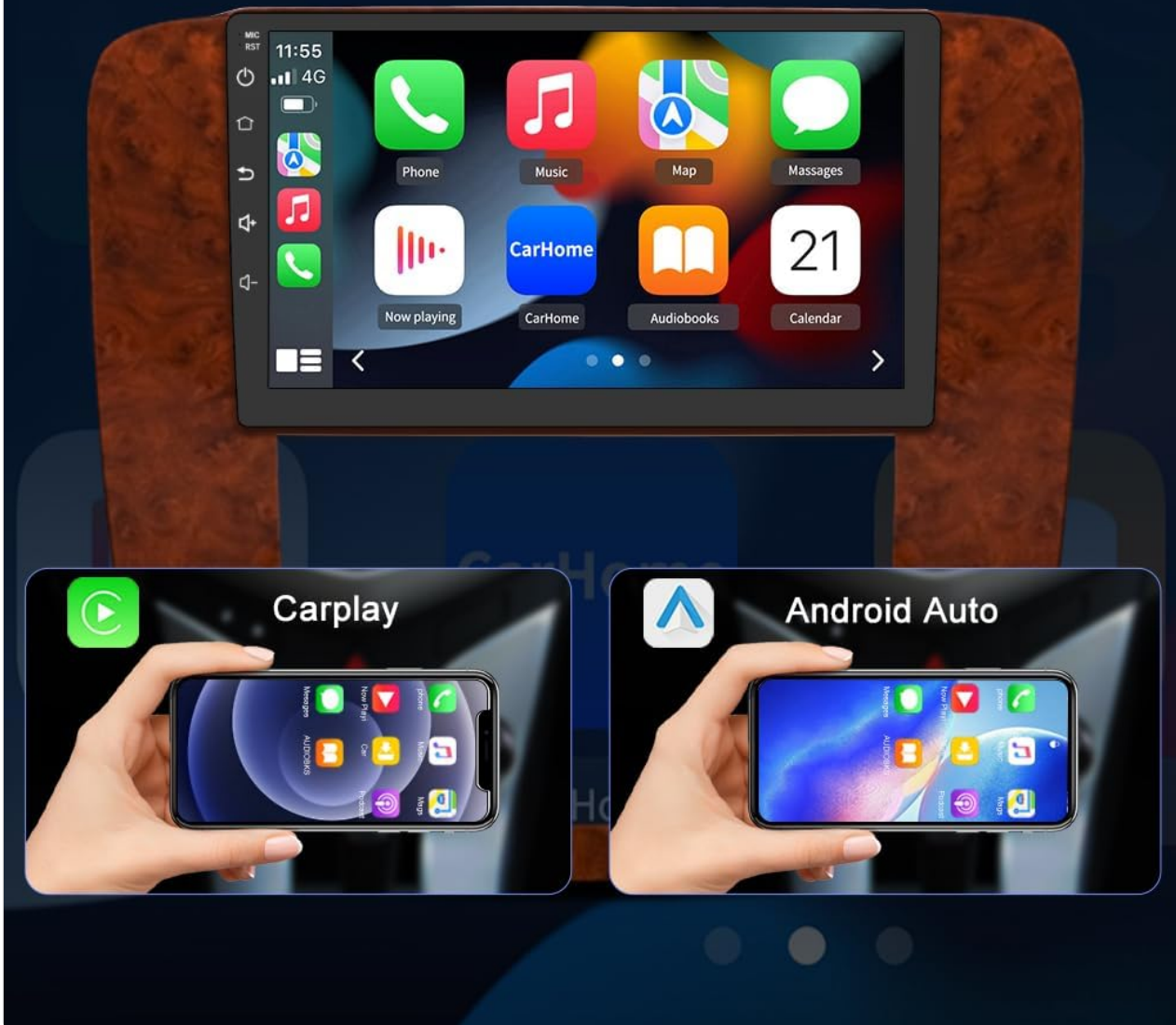
Image: The car stereo display showing both Apple CarPlay and Android Auto interfaces, highlighting seamless smartphone integration.