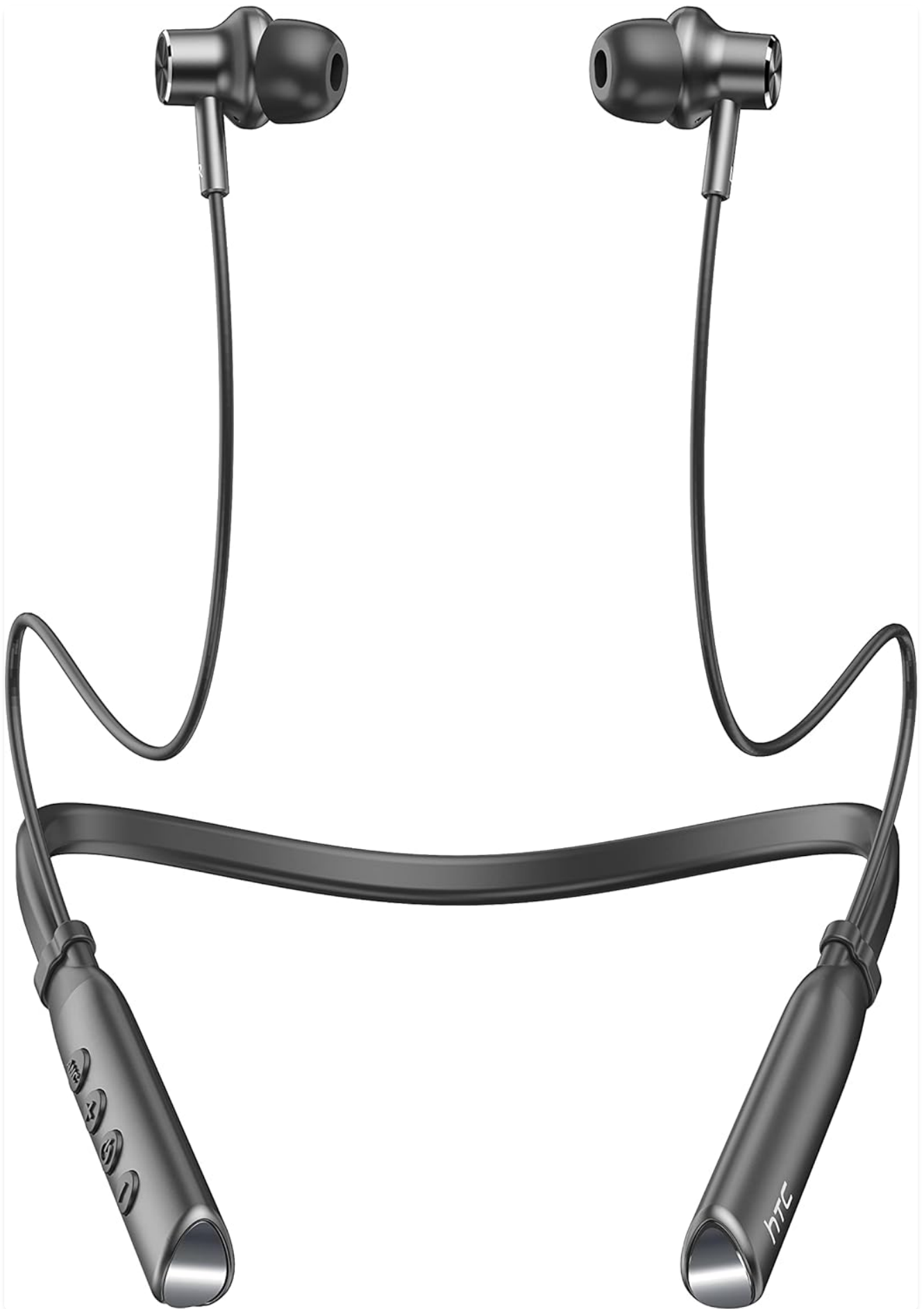
Image: Front view of the HTC Neckband Headphones, showcasing the neckband design and earbuds.