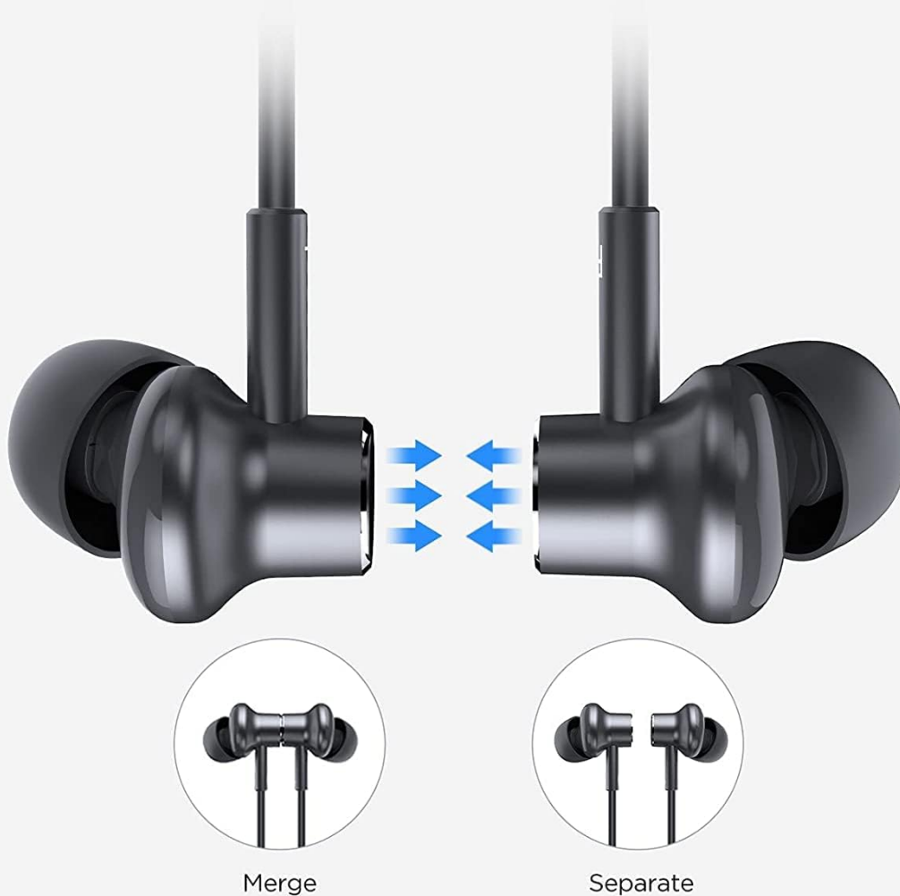
Image: Illustration showing the magnetic suction feature of the earbuds, demonstrating how they merge and separate.