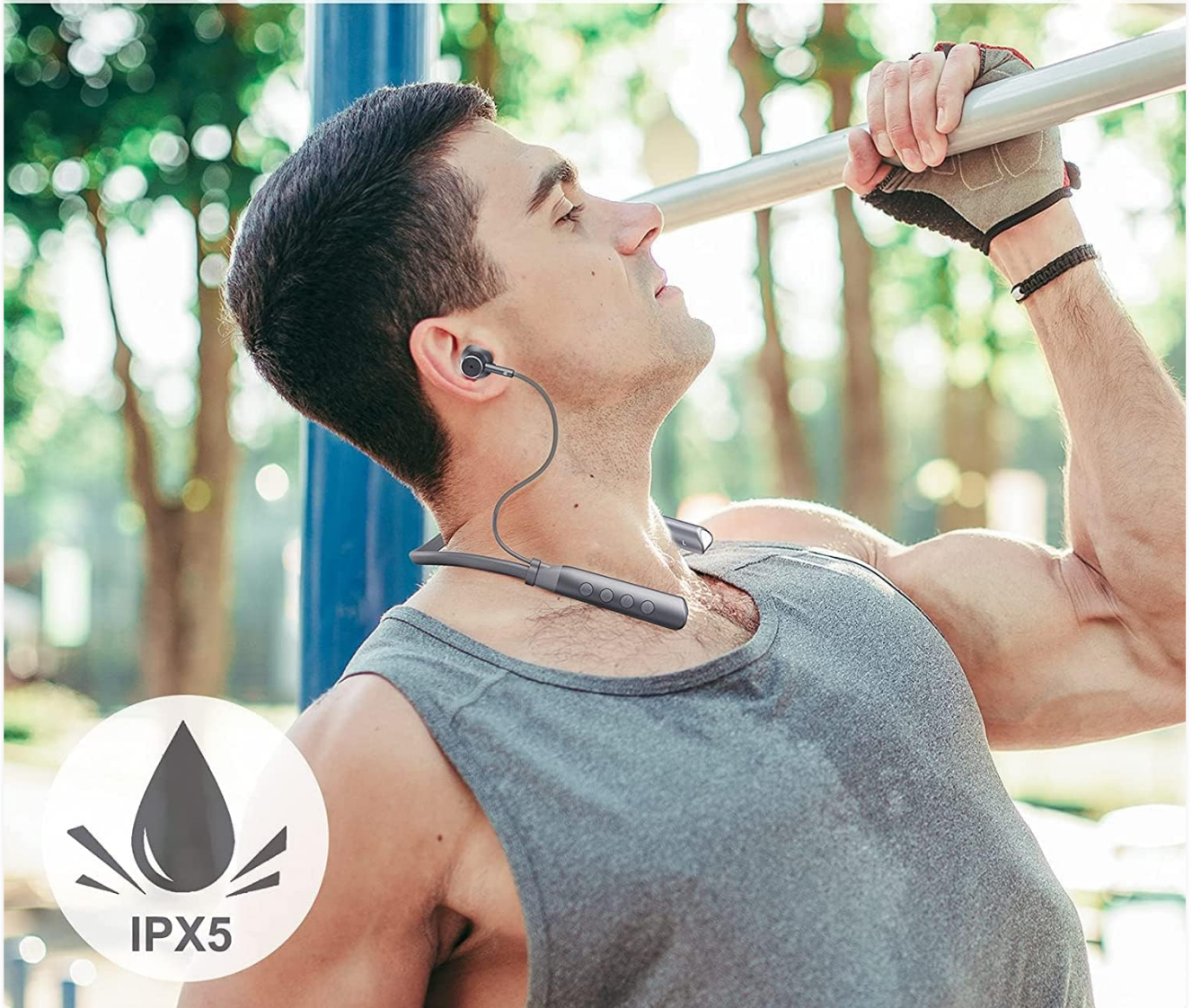
Image: A man exercising outdoors while wearing the headphones, with an IPX5 waterproof icon indicating its resistance to sweat and splashes.