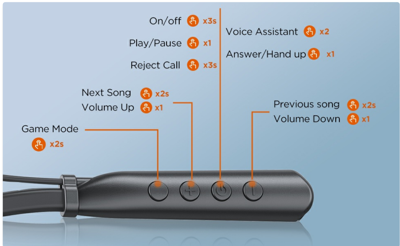
Image: A detailed diagram illustrating the functions of each button on the neckband, including power, volume, and mode controls.

The control buttons are located on the right side of the neckband. Familiarize yourself with their functions: